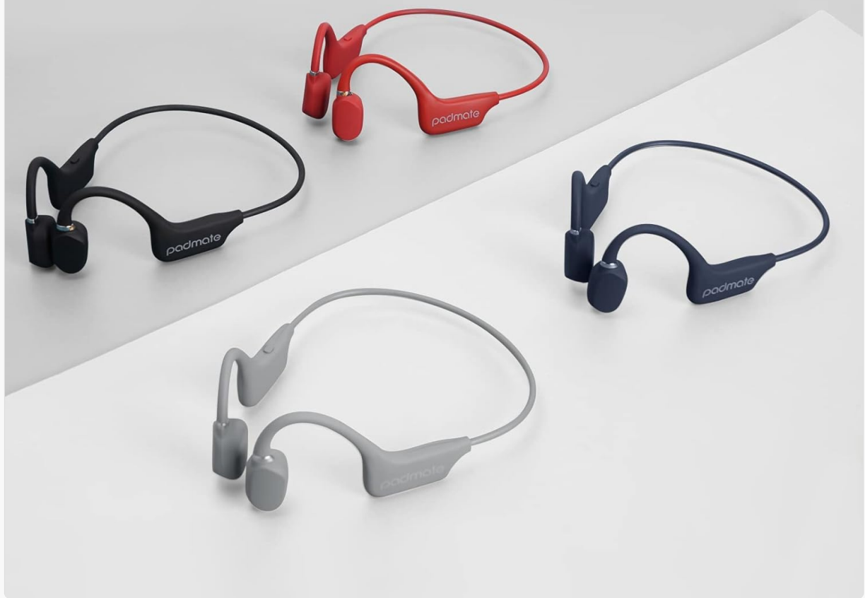
Image: A close-up view of the Padmate S26 headphones, showing the control buttons and the flexible memory titanium design.