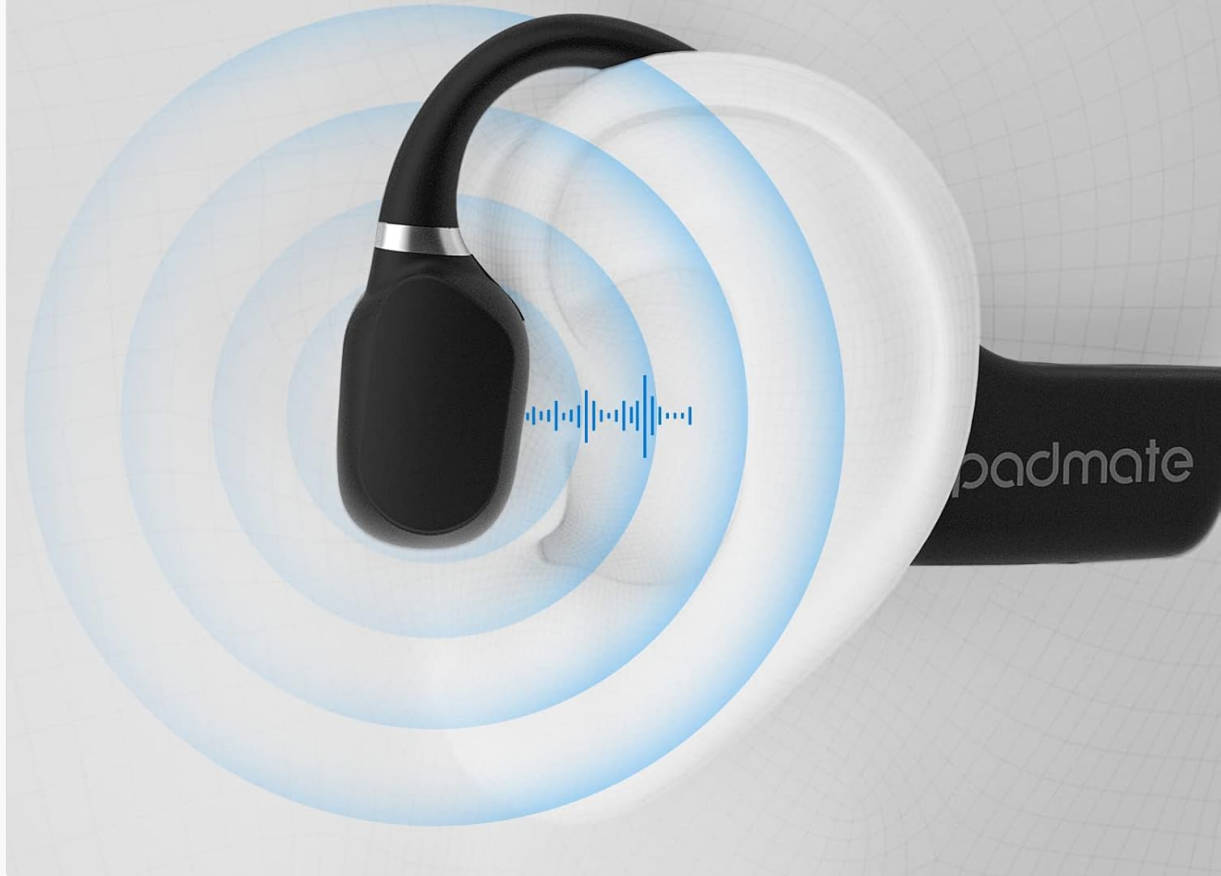
Image: A person wearing the Padmate S26 headphones, illustrating the comfortable and secure fit of the open-ear design.

The sound through air conduction, hear surrounding and traffic, running, cycling, driving safer