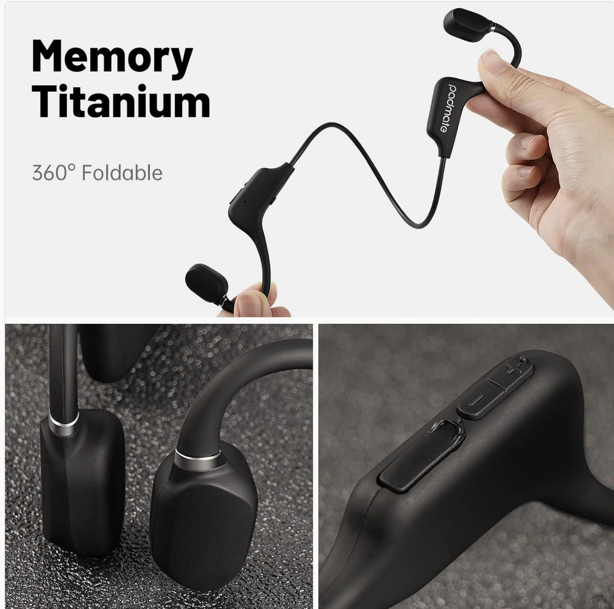
Image: The Padmate S26 headphones highlighting their 8-hour battery life, indicating the charging port location.

Before first use, fully charge your Padmate S26 headphones. Connect the provided USB charging cable to the charging port on the headphones and to a compatible USB power source (e.g., computer USB port, wall adapter). The LED indicator will show charging status and turn off when fully charged.