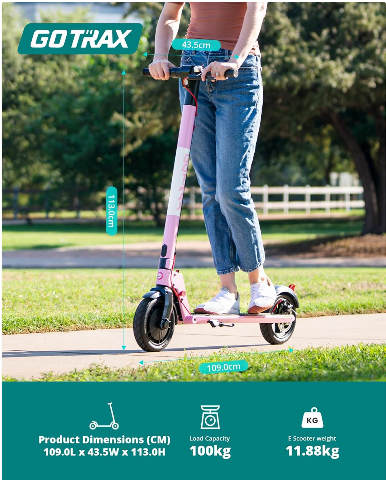
Figure 7: Detailed product dimensions and load capacity for the GXL V2 scooter.