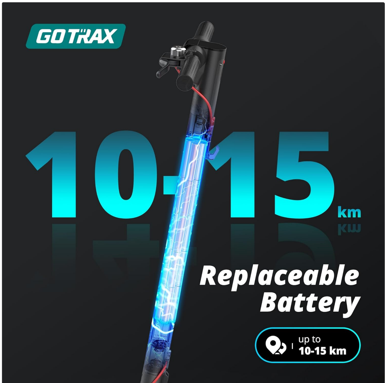
Figure 4: The scooter features a replaceable battery, offering a maximum distance range of 15 kilometers.