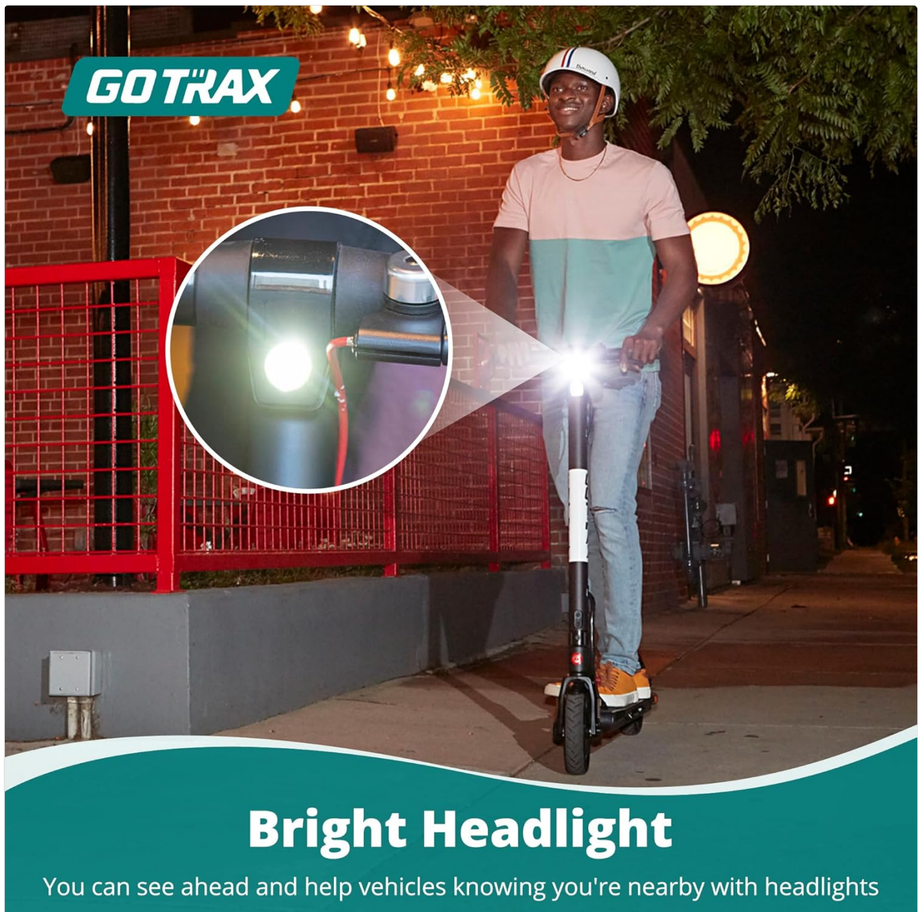
Figure 6: The bright headlight ensures visibility and safety during night rides or in low-light environments.