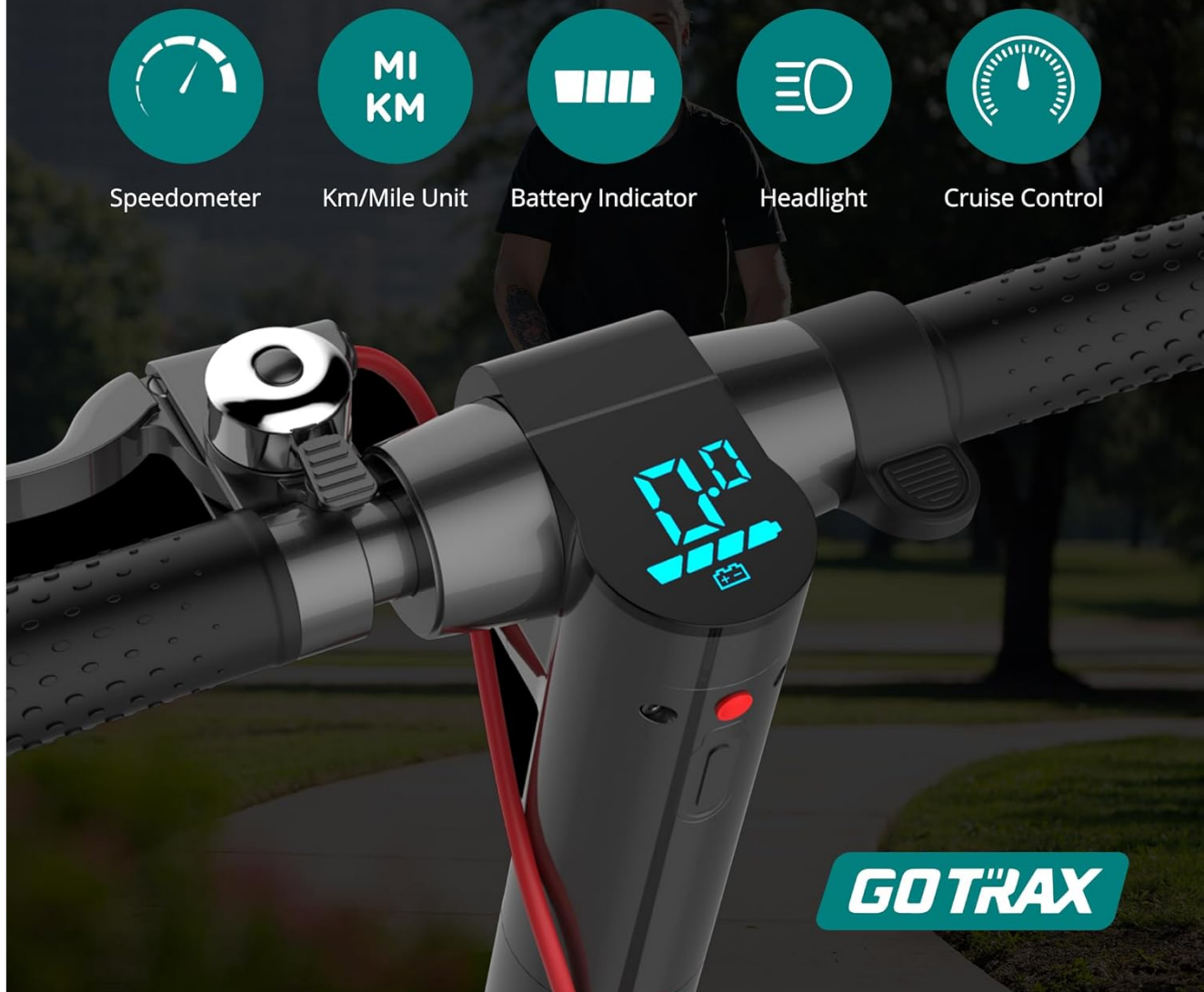
Figure 5: The Smart LED Display provides real-time information including speedometer, Km/Mile unit, battery indicator, headlight status, and cruise control activation.