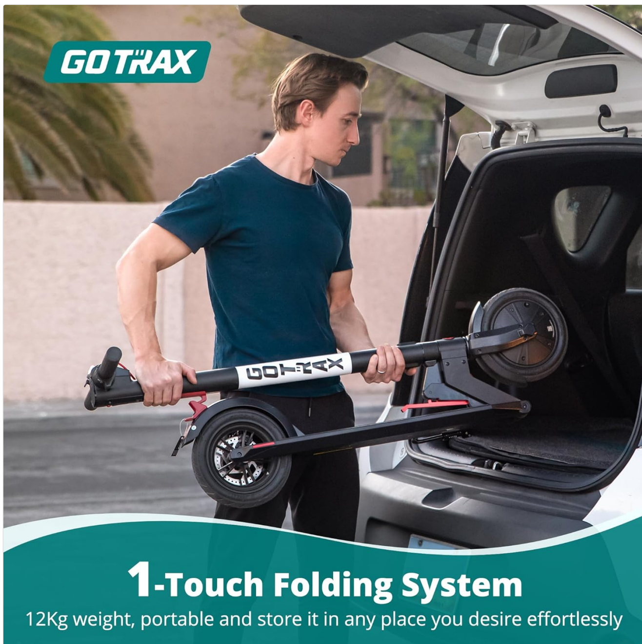
Figure 3: The scooter's one-touch folding system allows for easy storage and portability.