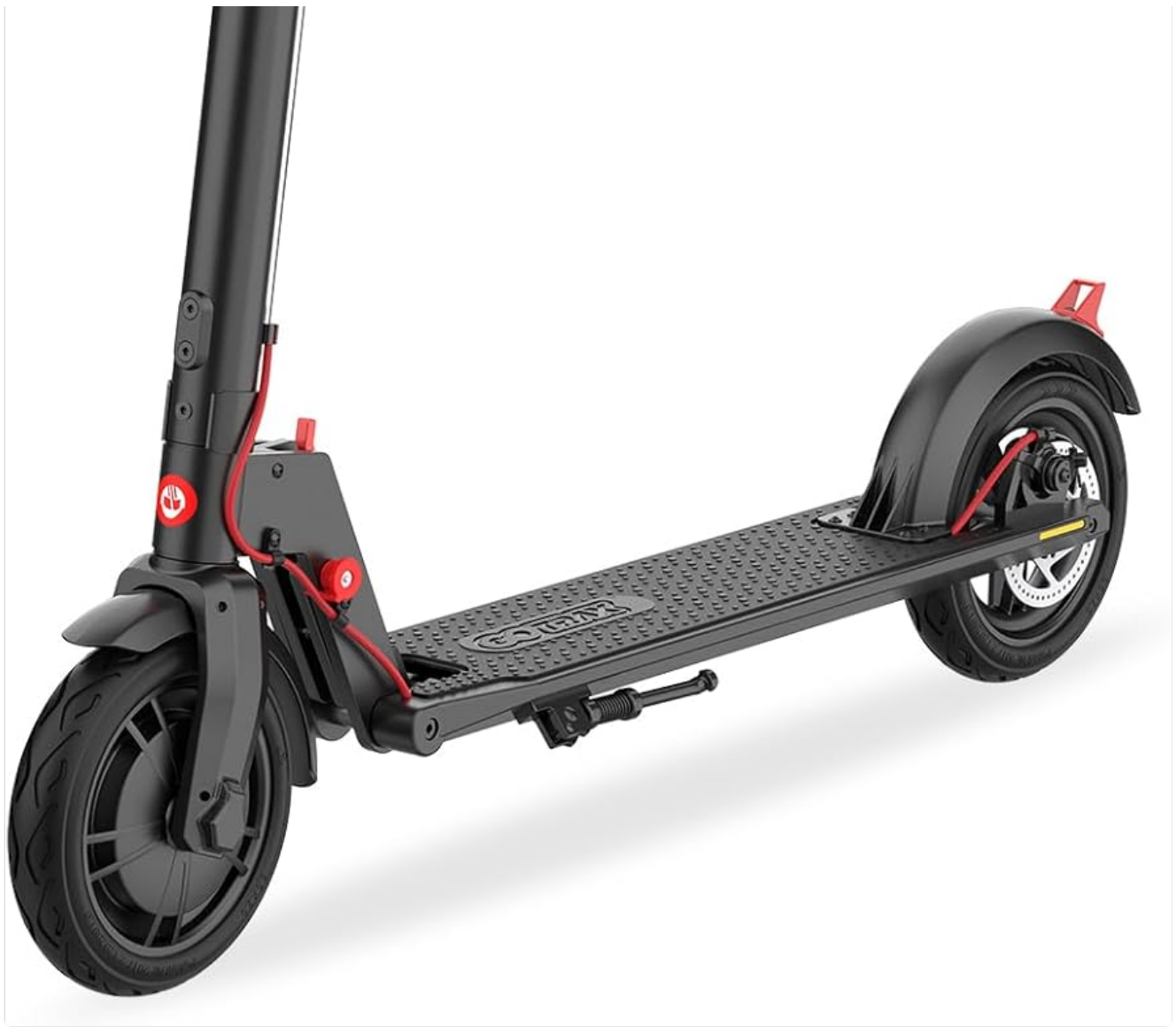
Figure 1: Gotrax GXL V2 Electric Scooter, showcasing its sleek design and sturdy build.

Key features include a large digital console, extended battery life, a front headlight for visibility, and UL2272 certification for safety. The scooter is also equipped with EABS and a rear disk brake system for effective stopping power.