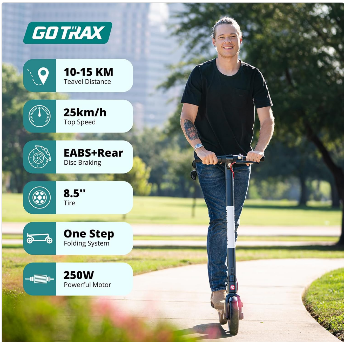
Figure 2: Visual representation of key features including travel distance, top speed, braking system, tire size, folding system, and motor power.