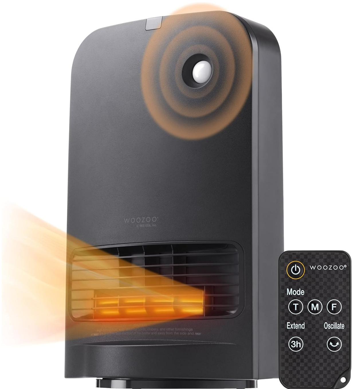
Figure 1: IRIS USA WOOZOO Portable Ceramic Heater with Remote