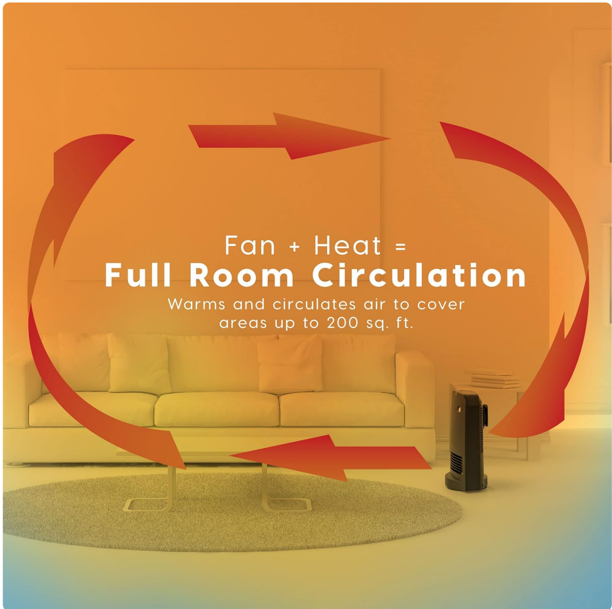
Figure 6: Full Room Circulation