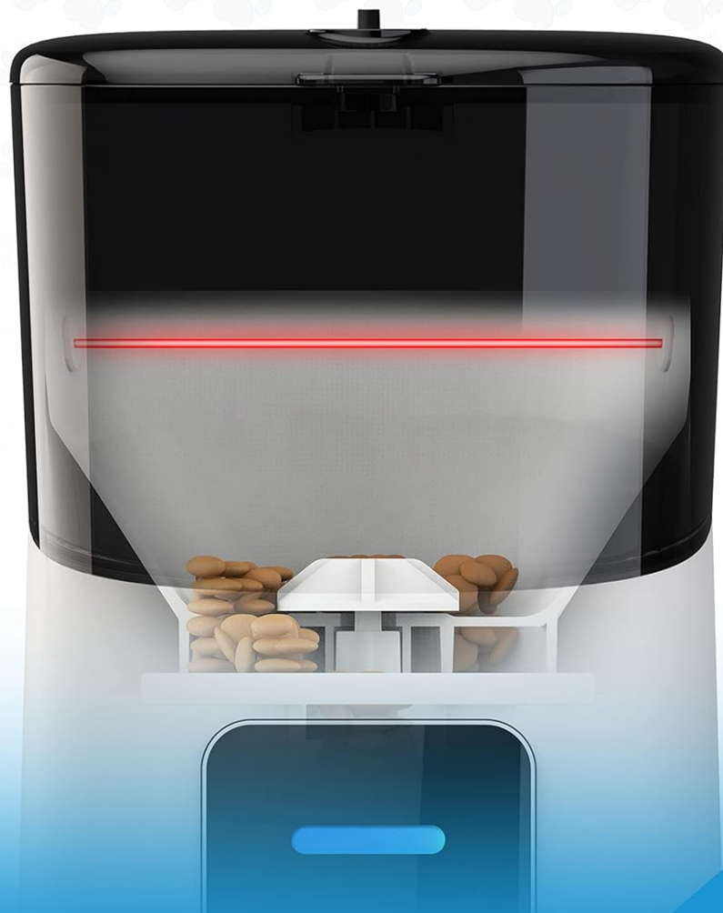
Image: A close-up view of the infrared sensors located inside the Pretty Paws feeder's food container, which detect when the food level is low.