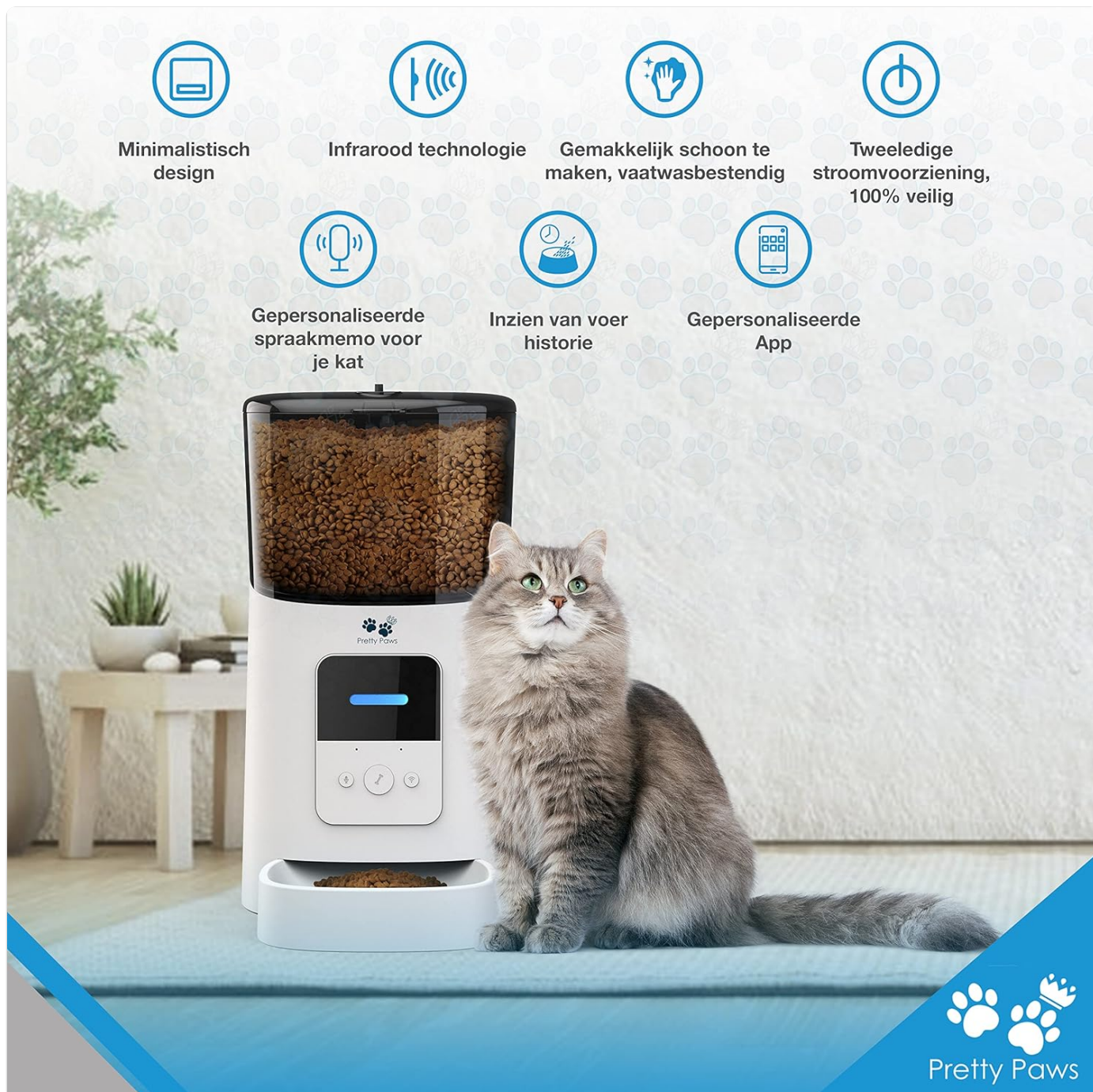
Image: An overview of the Pretty Paws PP005's key features, including minimalist design, infrared technology, easy cleaning, dual power, personalized voice memo, feeding history, and app control, with a cat sitting next to the feeder.