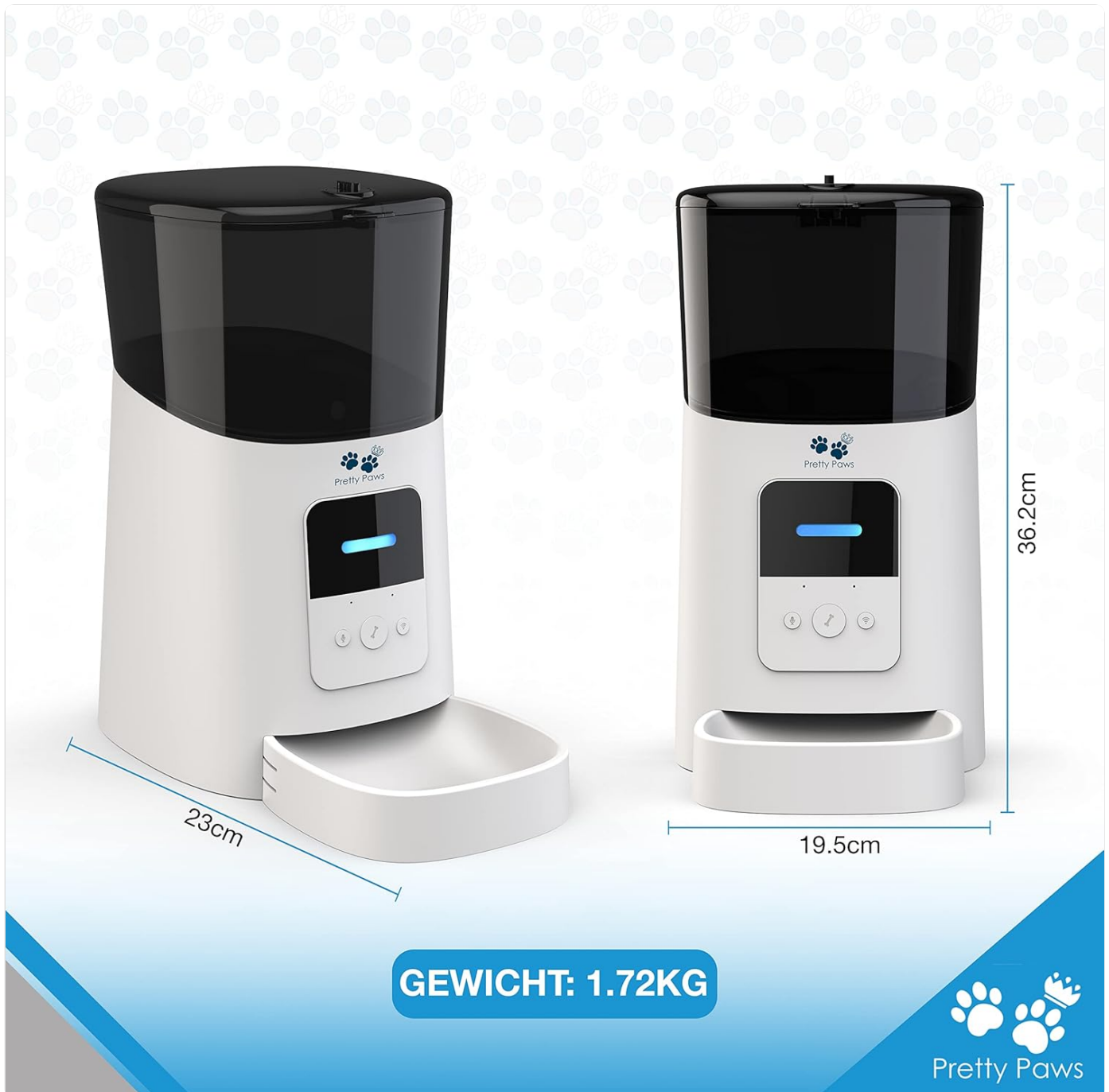
Image: A visual representation of the Pretty Paws PP005 feeder's dimensions (width, depth, height) and its weight, providing clear size information for placement.