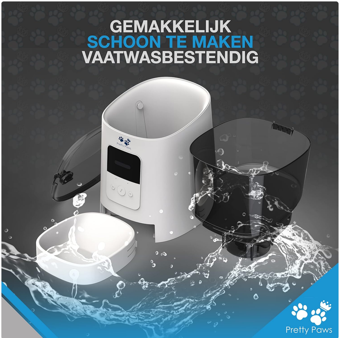
Image: The Pretty Paws feeder disassembled into its main components (food container, lid, main unit, and food bowl), illustrating how easily it can be taken apart for thorough cleaning, with water splashes indicating its washability.