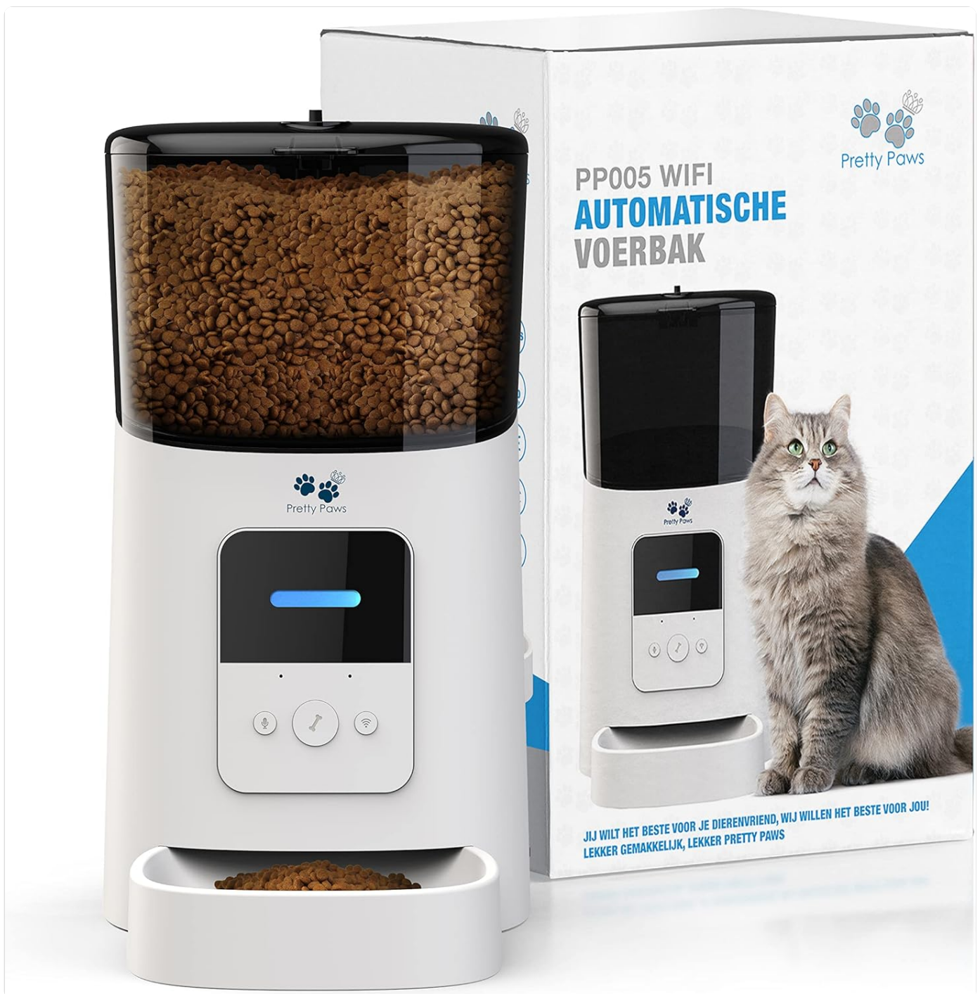
Image: The Pretty Paws PP005 Wifi Automatic Pet Feeder, showcasing its sleek design and transparent food container filled with pet kibble.