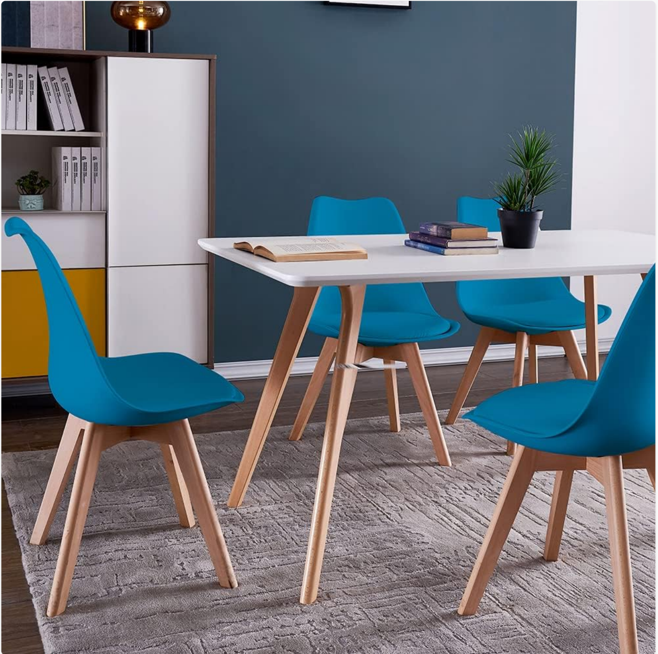
Figure 3: Chairs in a Dining Setting. This image displays four blue DEWINNER chairs surrounding a white dining table, illustrating their intended use in a dining area.