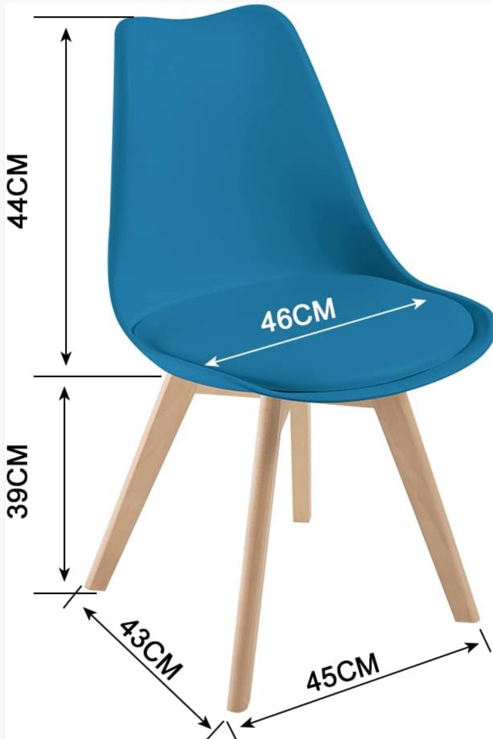
Figure 2: Chair Dimensions. This diagram illustrates the key measurements of the chair, including seat height (39cm), seat width (46cm), backrest height (44cm), and overall depth (45cm) and height (83cm).