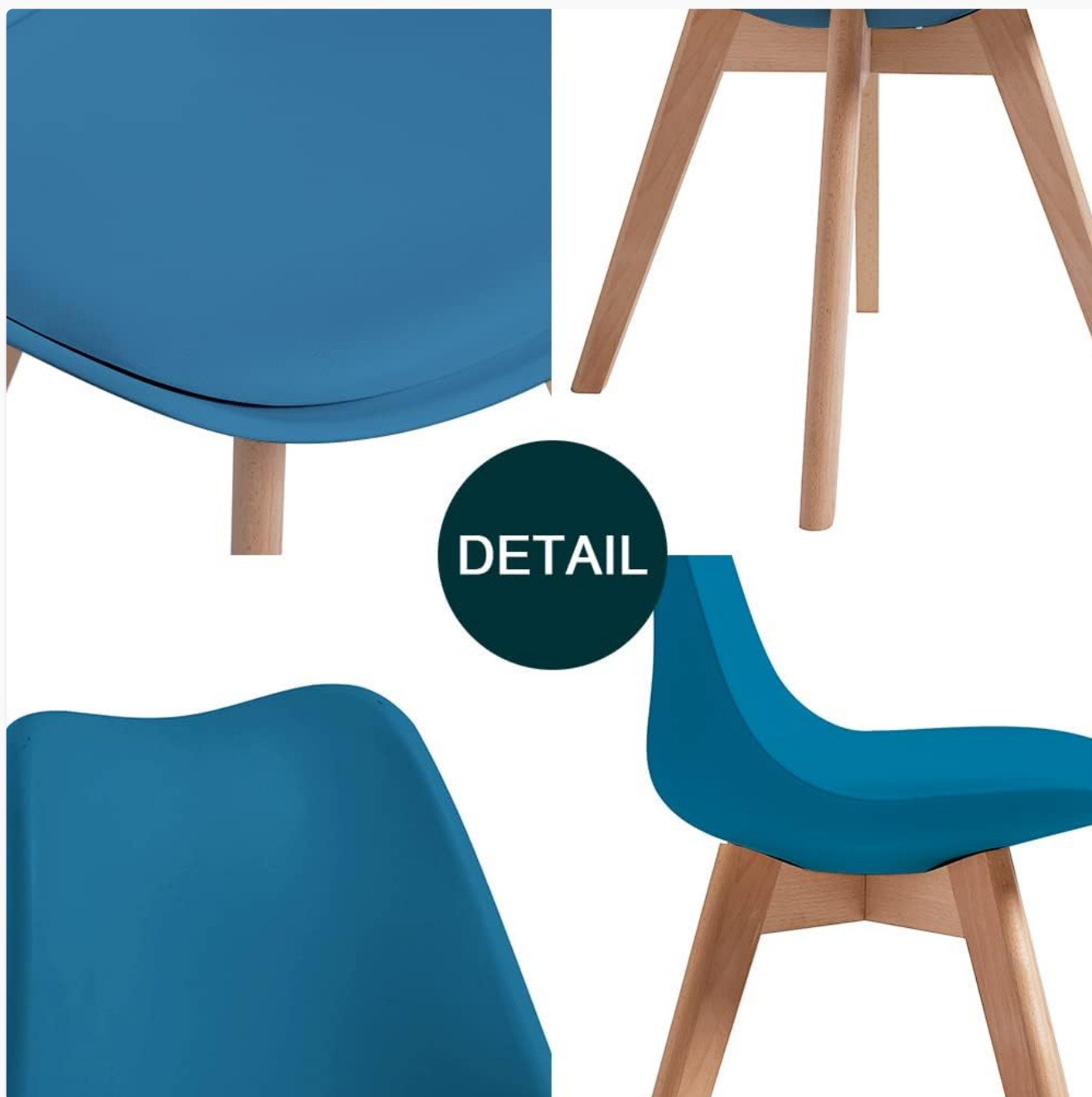
Figure 4: Chair Details. This image provides close-up views of the chair's features, including the padded seat, the sturdy connection of the wooden legs, and the ergonomic curve of the backrest.