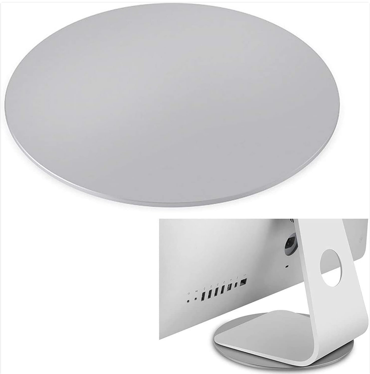
Image: The Yoqanr 360° Rotation Monitor Swivel Base, ready for device placement.