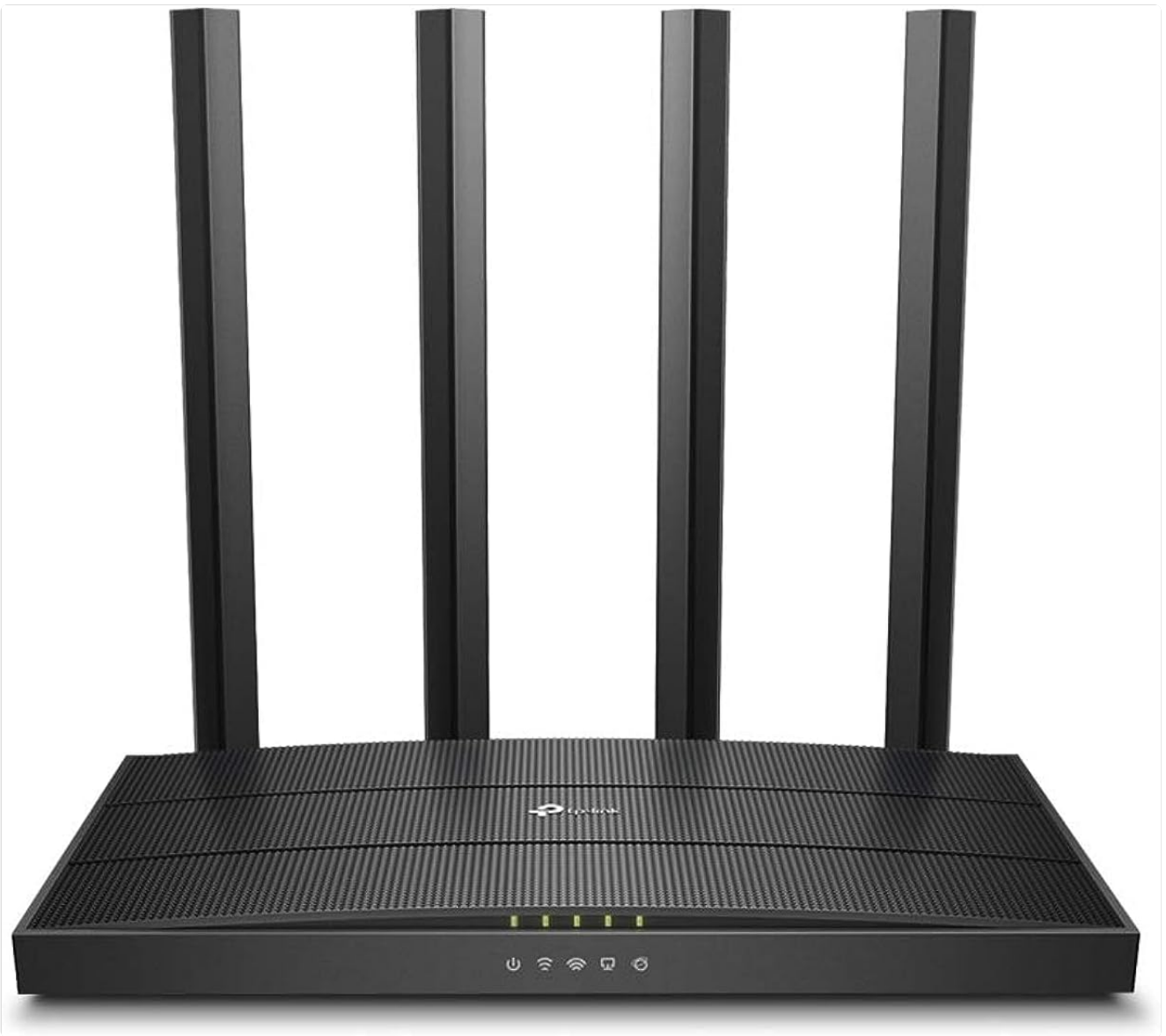
Figure 1.1: TP-Link Archer C80 AC1900 Wireless Router