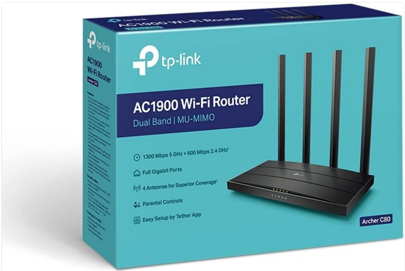
Figure 2.1: Archer C80 Retail Packaging