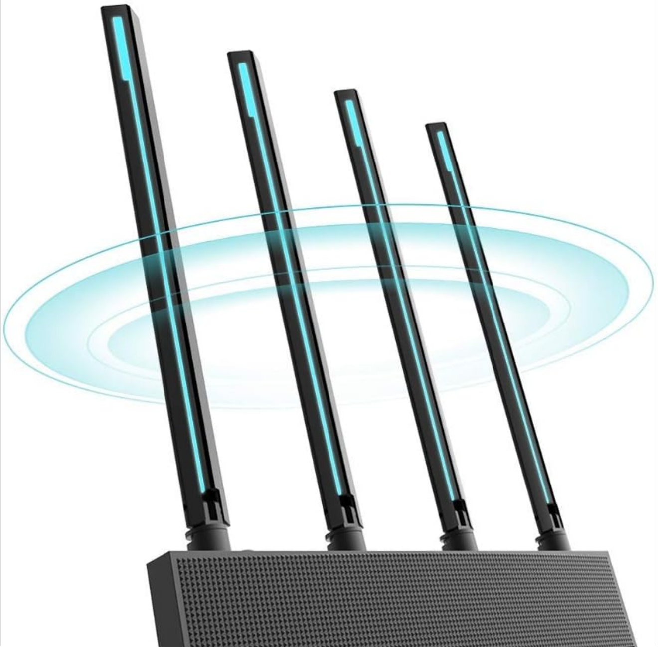
Figure 5.2: Broader Coverage with Beamforming