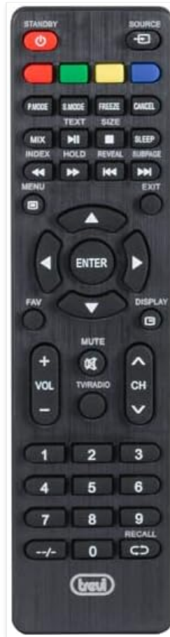
The remote control for the Trevi LTV 1904 SA2 TV.