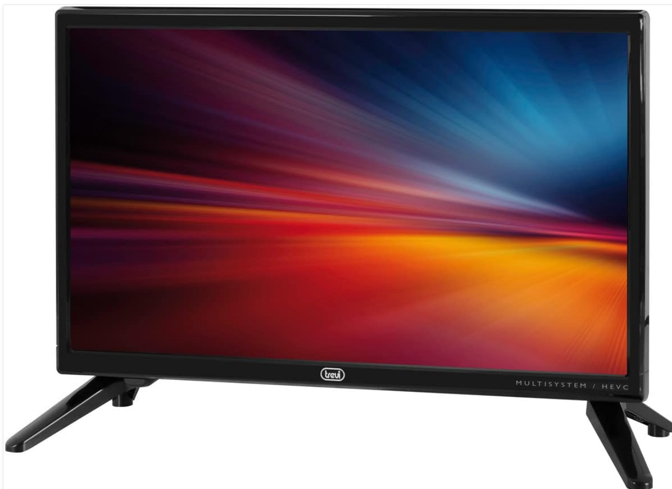
Front view of the Trevi LTV 1904 SA2 19-inch LED TV with its stand.

The Trevi LTV 1904 SA2 is a versatile 19-inch LED television designed for various environments, including campers and secondary homes. It features integrated DVB-T2 (Digital Terrestrial) and DVB-S2 (Digital Satellite) tuners, offering a wide range of entertainment options. The TV supports USB and HDMI connectivity for external devices and includes practical functions such as SLEEP timer and HOTEL mode. It can be powered by both standard mains electricity and a 12V cigarette lighter adapter, enhancing its portability and adaptability.