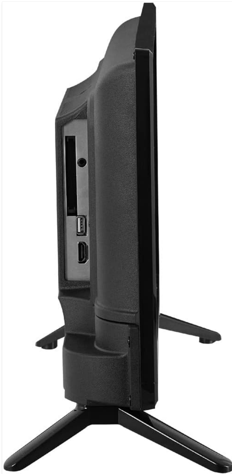
Rear view of the Trevi LTV 1904 SA2 TV, illustrating the various input and output connections.