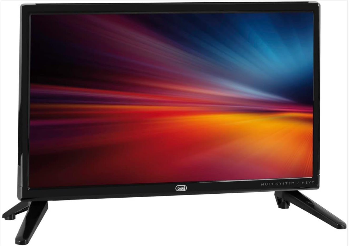
Side view of the Trevi LTV 1904 SA2 TV, showing the USB and HDMI ports.