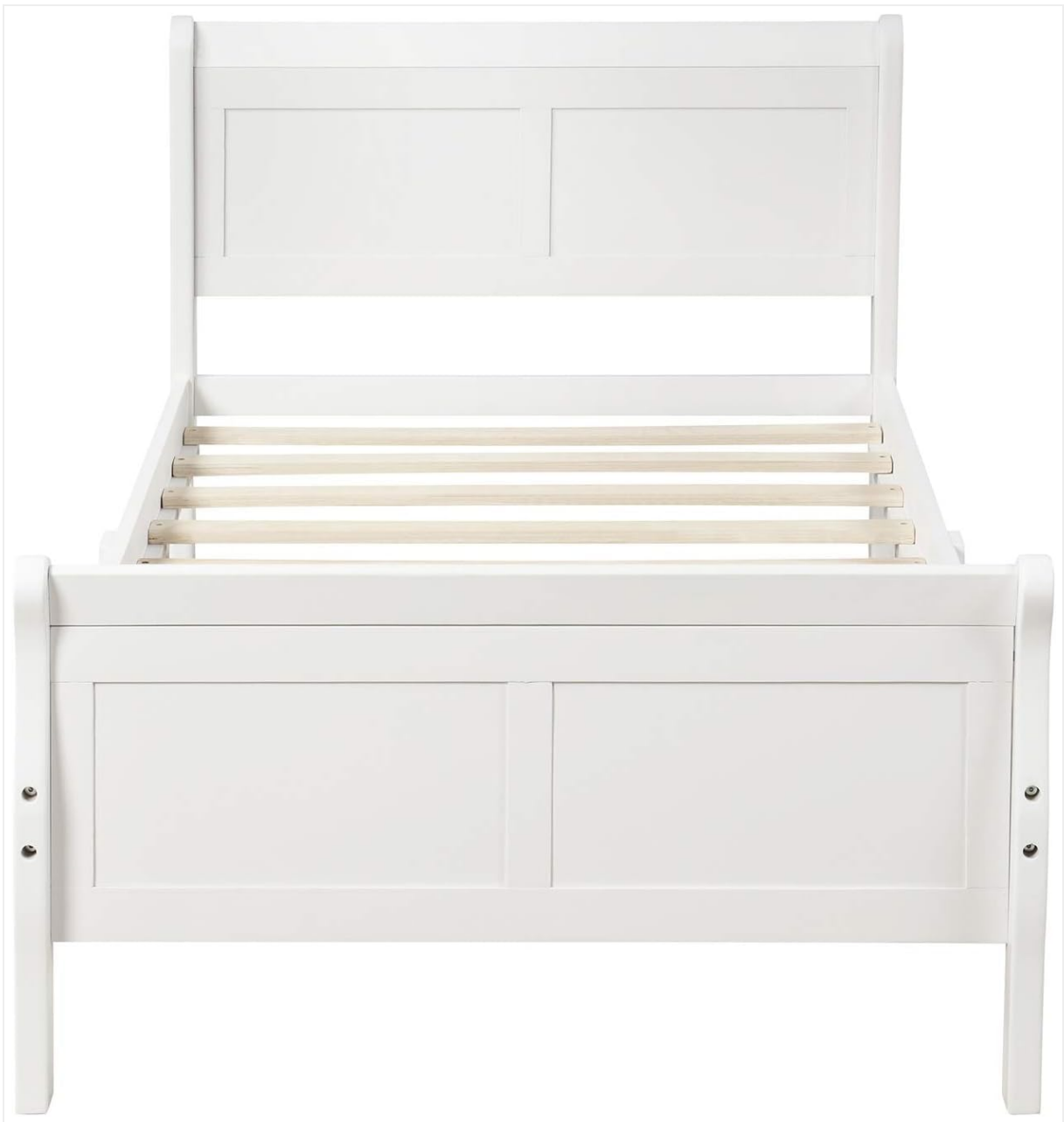
Figure 3: Front view of the assembled headboard and footboard sections, showcasing the sleigh design.