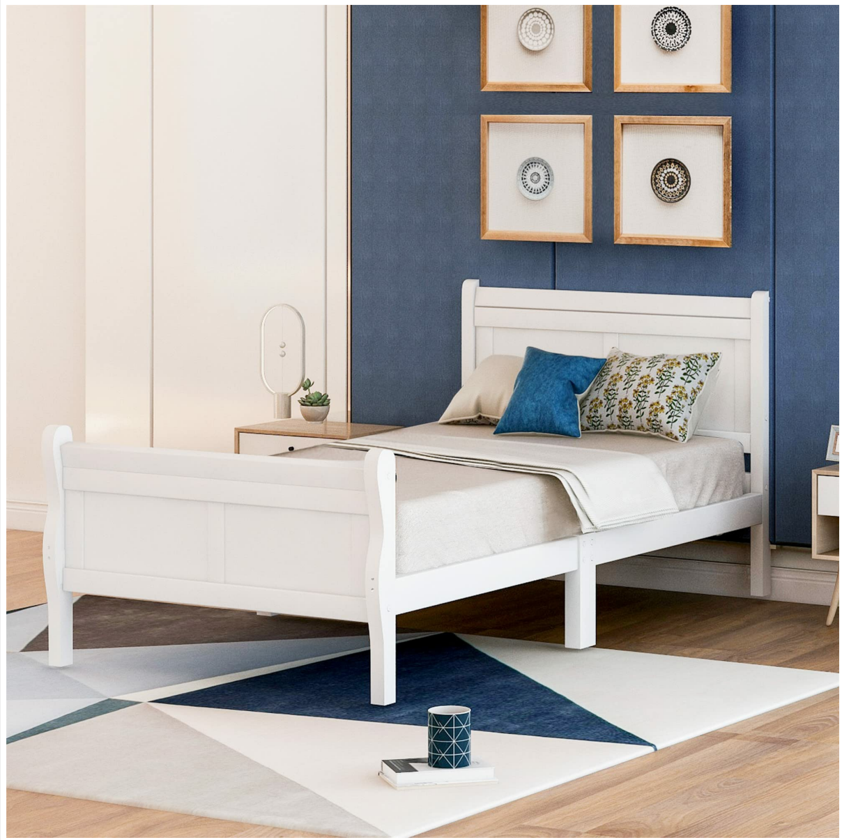
Figure 6: The MERITLINE Simple Sleigh Bed Twin Size Frame shown in a bedroom, illustrating its functional and aesthetic integration.