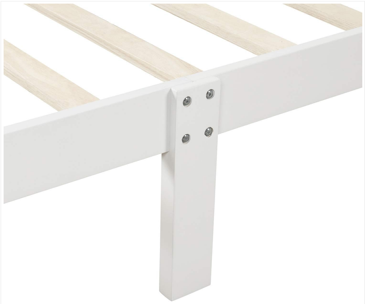
Figure 4: Detail of the center support leg and its attachment to the bed frame, providing additional stability.