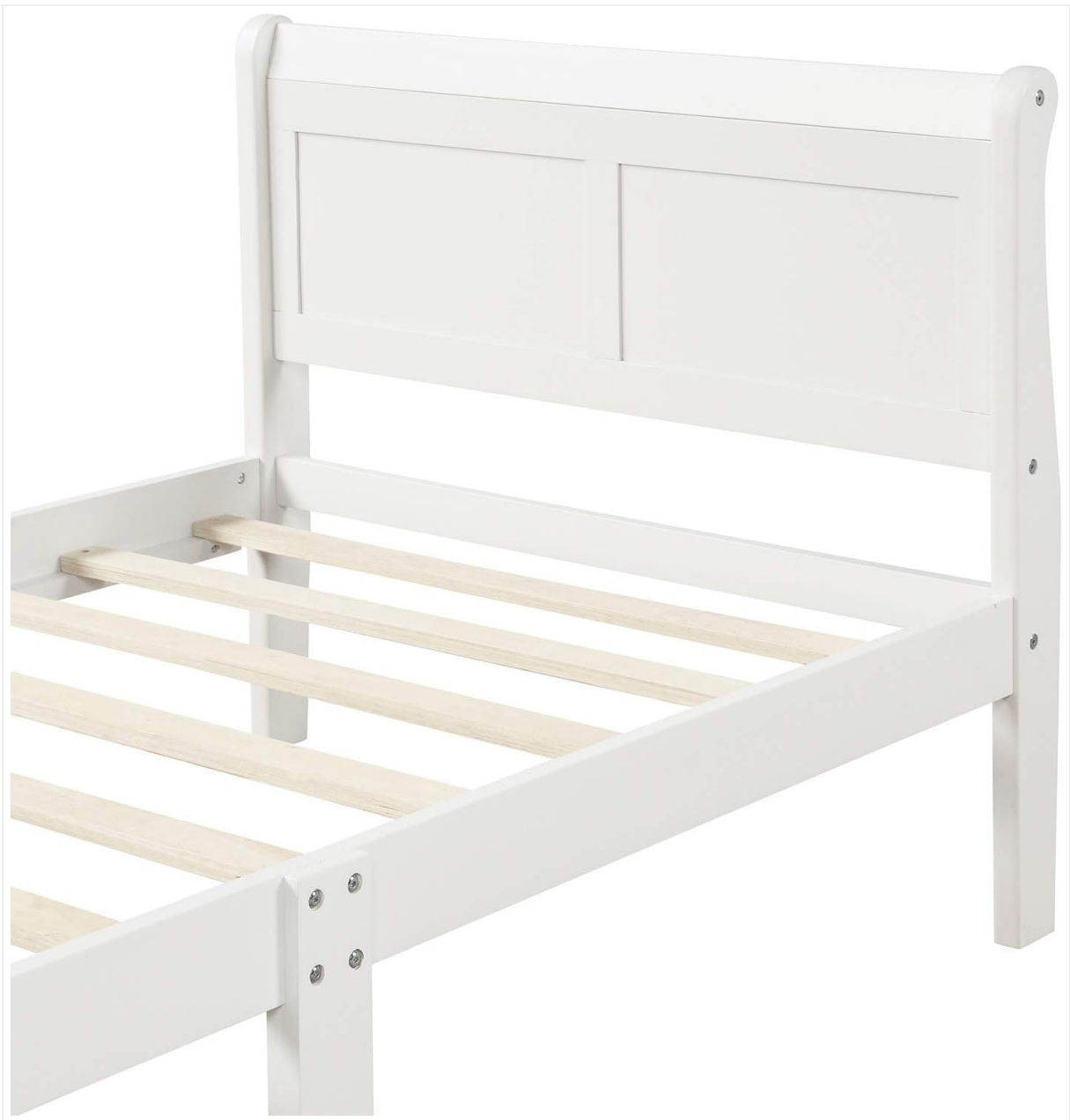
Figure 5: View of the bed frame with all wooden slats properly installed, ready for a mattress.