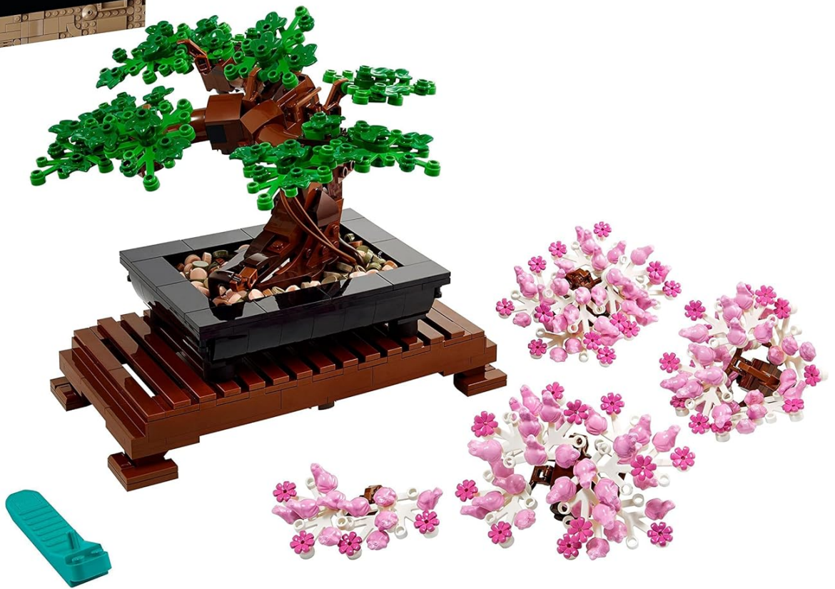
Image: The LEGO 10281 Bonsai Tree set, showing the product box and the fully assembled bonsai tree with green foliage.