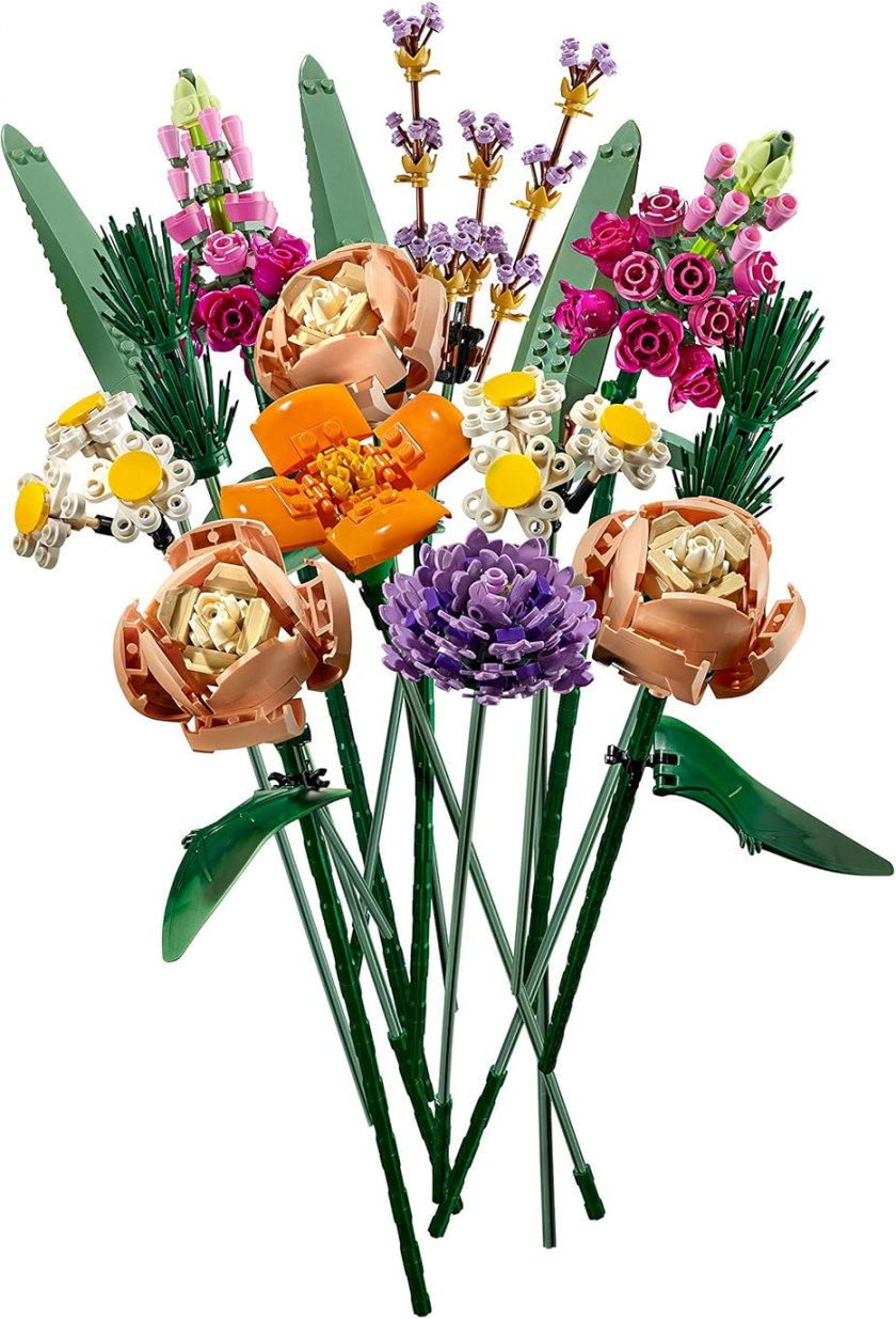
Image: The LEGO 10280 Flower Bouquet set, showing the product box and the fully assembled bouquet with various colorful flowers.