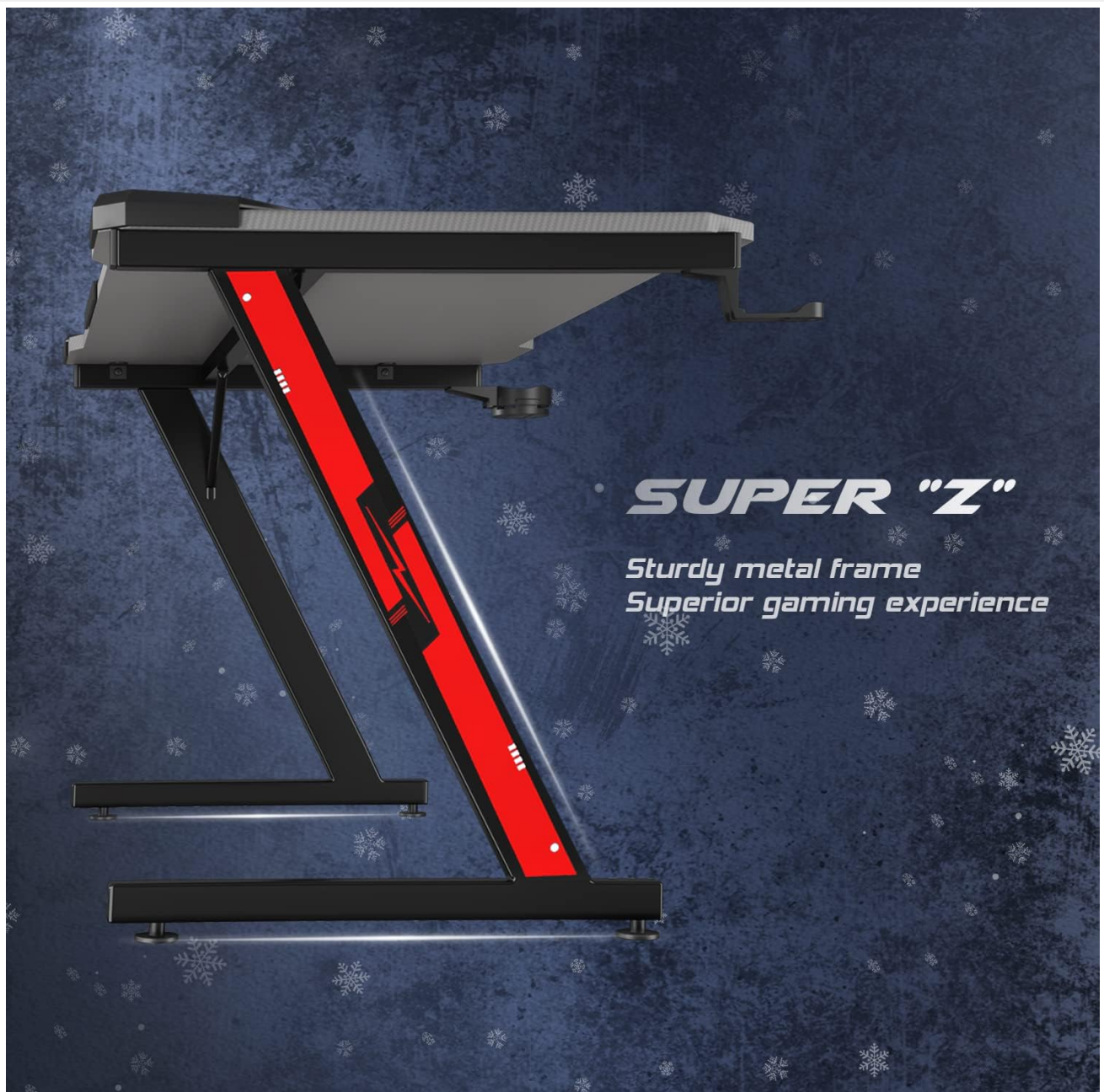
Figure 3.2: The sturdy Z-shaped metal frame provides stability.