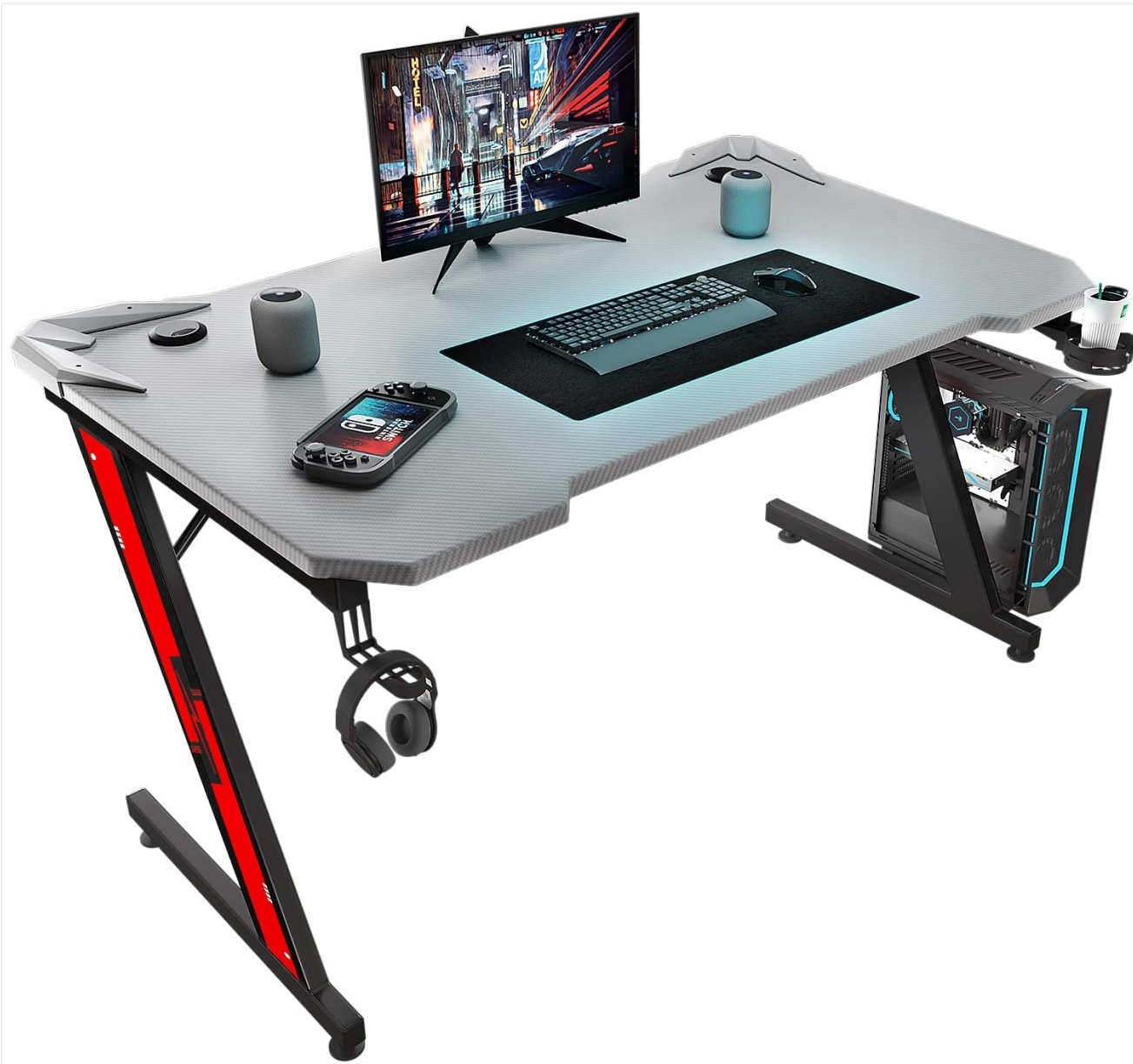
Figure 2.1: The Homall 44-inch Gaming Computer Desk in a typical gaming environment.