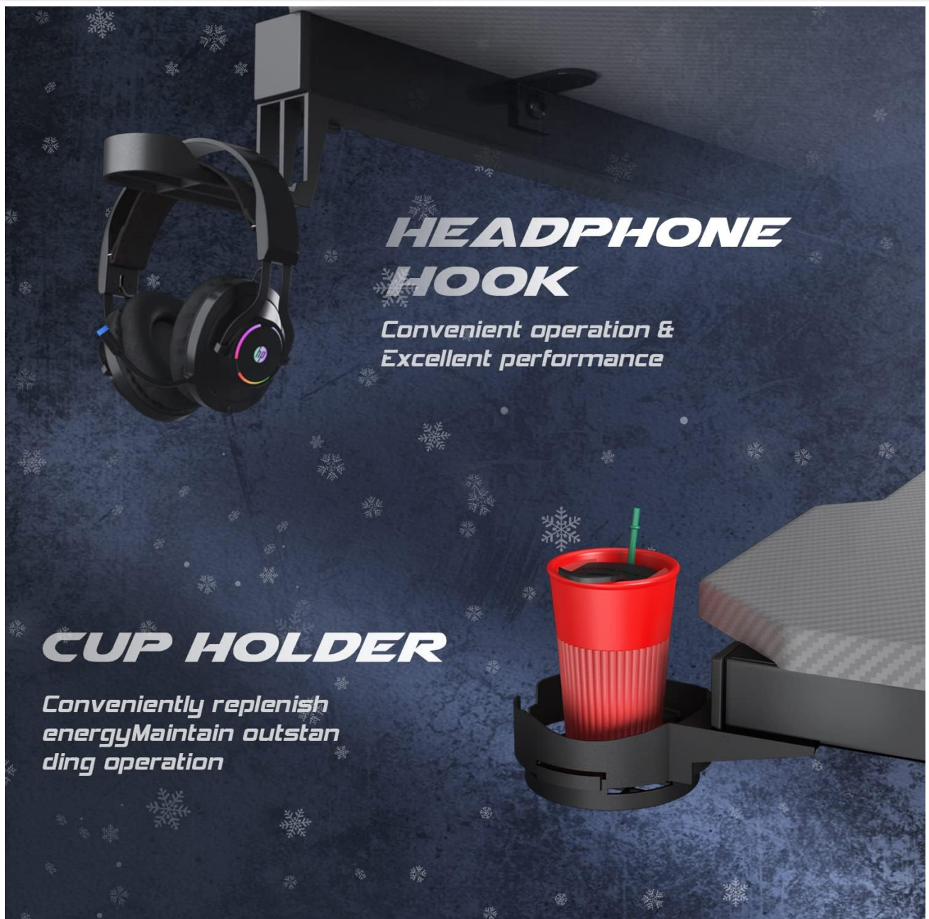
Figure 4.2: Dedicated headphone hook and cup holder for convenience.