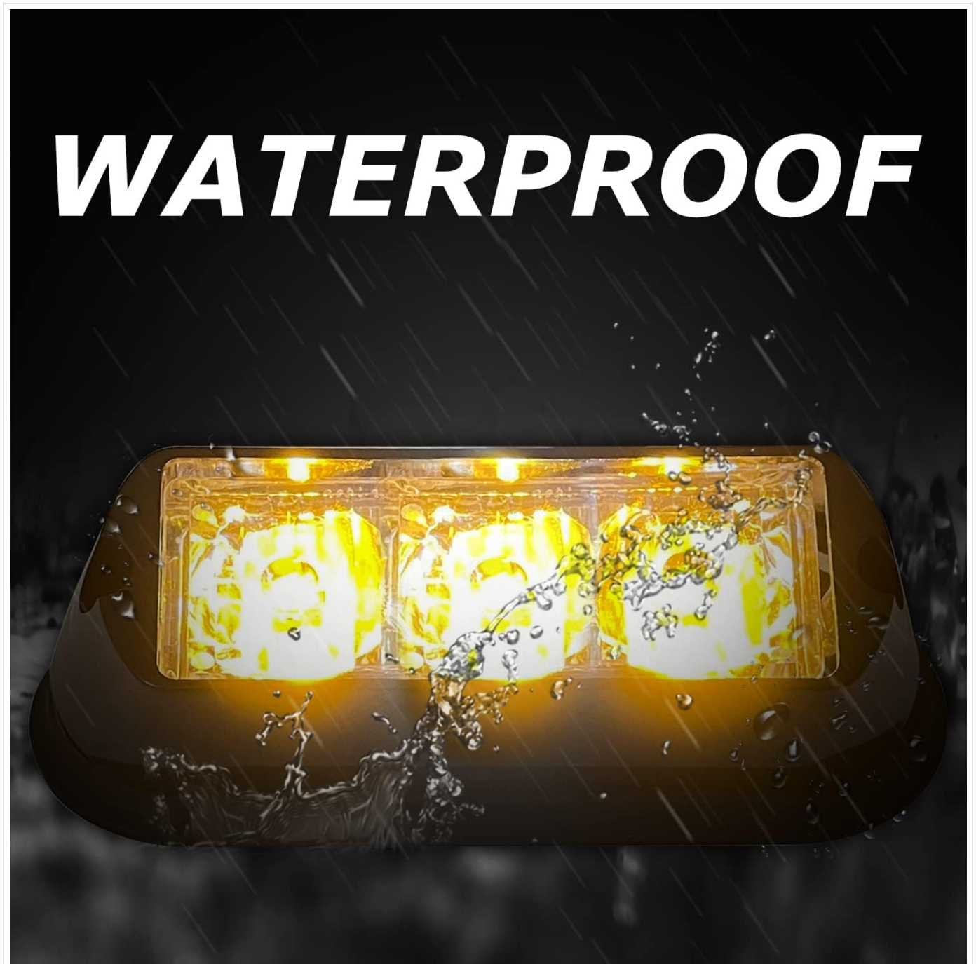
Image: An EASE2U EUBYL11 LED Strobe Light being sprayed with water, illustrating its IP66 waterproof capability.