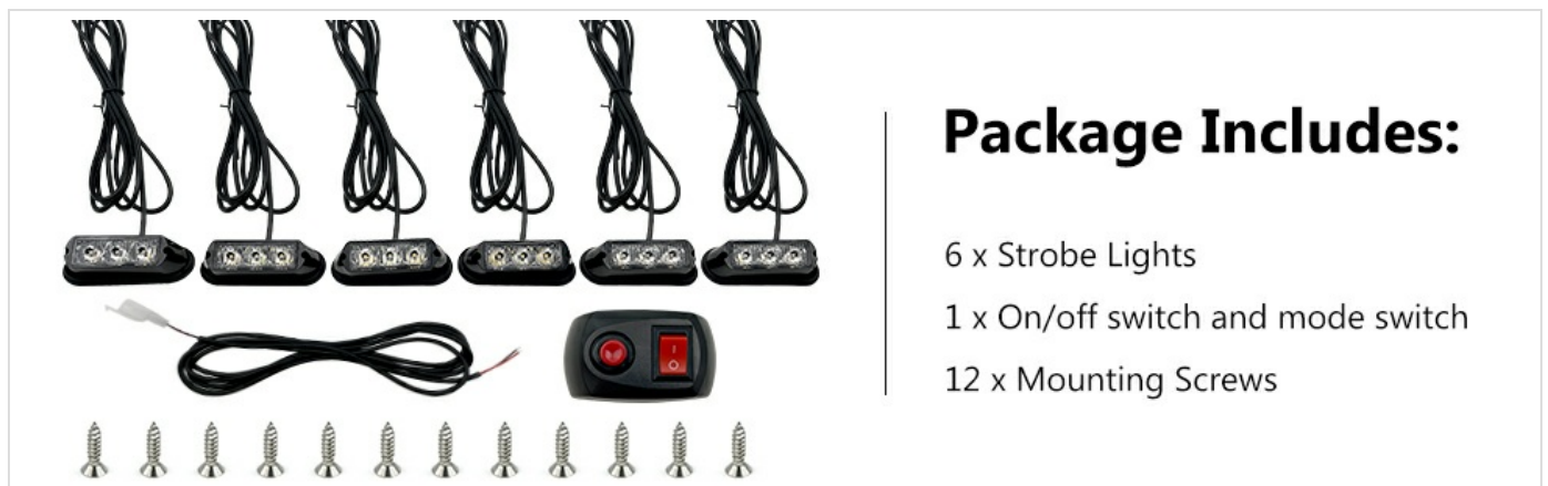
Image: Contents of the EASE2U EUBYL11 LED Strobe Lights package, showing six amber LED light units, a control switch, and mounting screws.