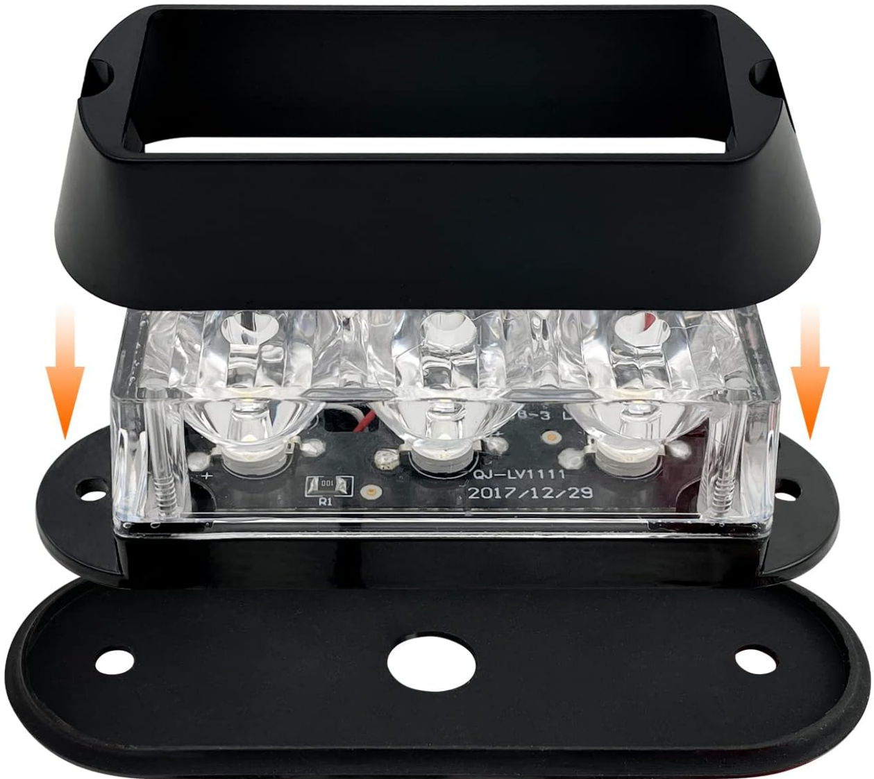
Image: An exploded view of the EASE2U EUBYL11 LED Strobe Light, showing the clear lens, LED board, and the protective plastic casing.

More waterproof, stronger, lamp protection, more durable