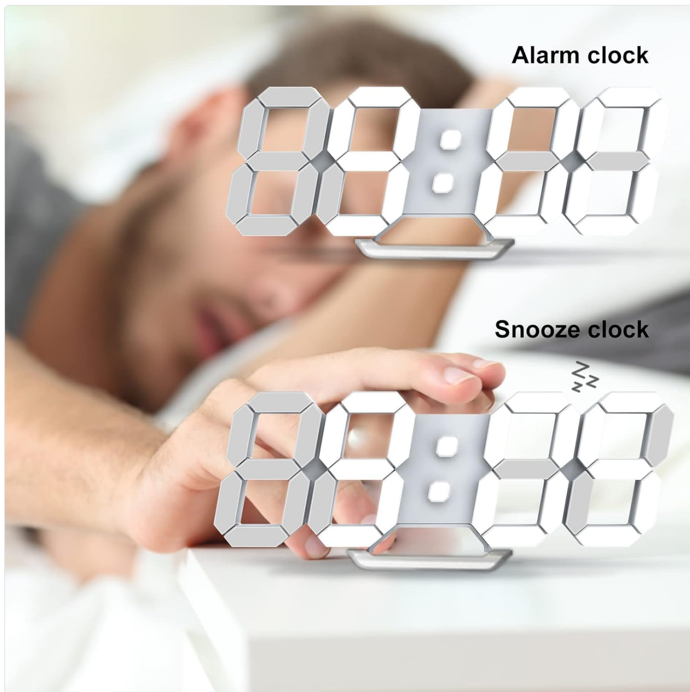
Image: The clock displaying an alarm time and a separate image showing the snooze function activated.