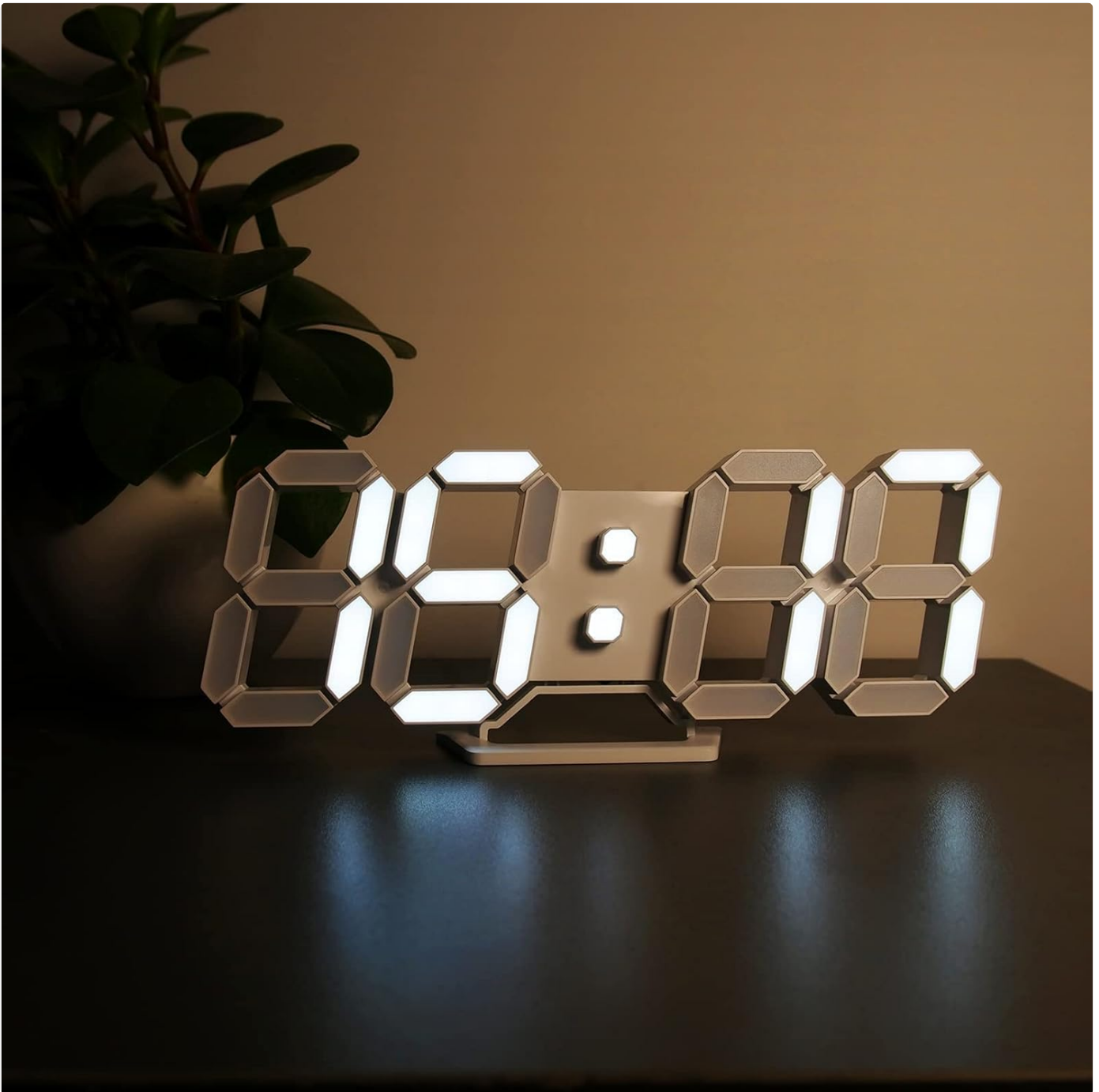
Image: The 3D LED clock displaying time, positioned on a bedside table in a dimly lit room.