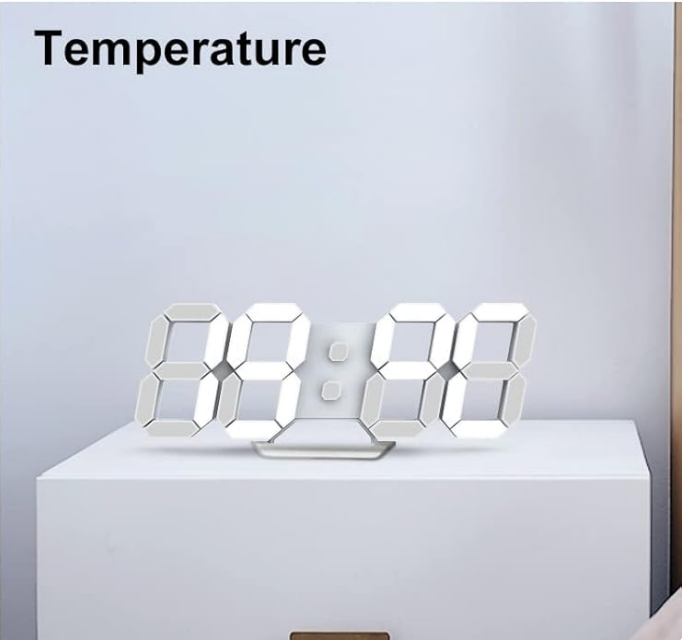
Image: The clock demonstrating its loop display mode, showing transitions between time, date, and temperature readings.