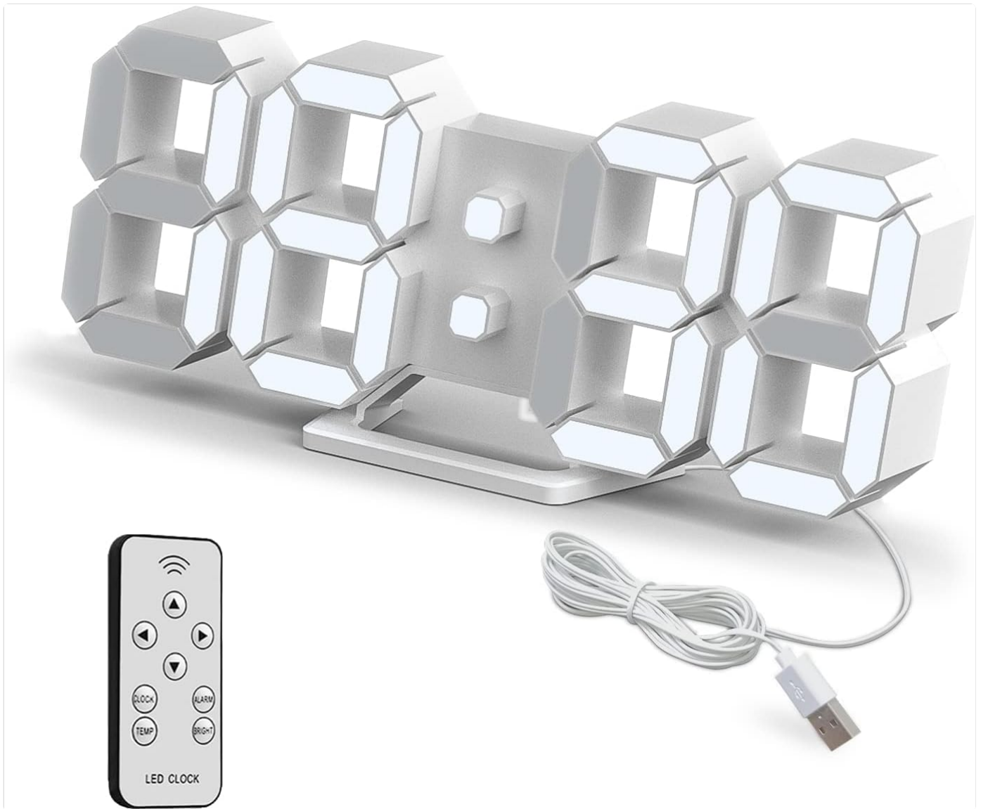
Image: The Deeyaple 3D LED Digital Alarm Clock, showing the main unit, remote control, and USB power cable.