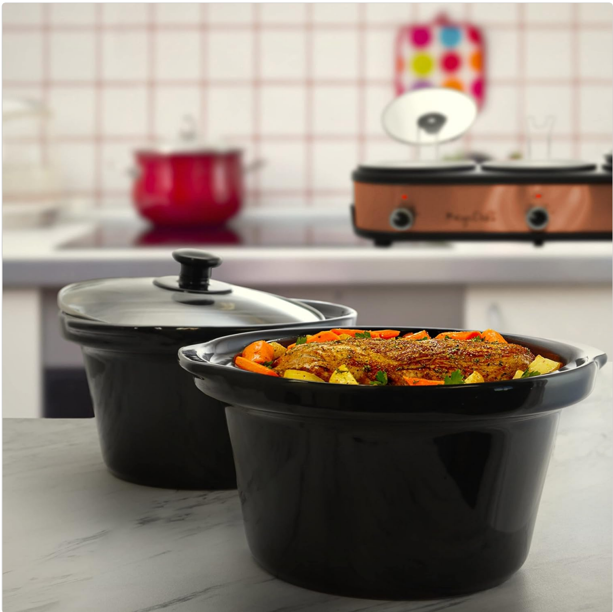
Image: A close-up view of one of the ceramic pots filled with cooked food, demonstrating the appliance in use.

Your browser does not support the video tag.