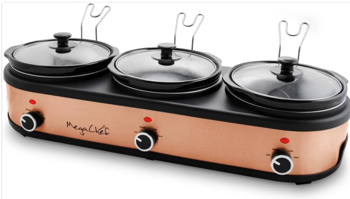
Image: The Megachef Triple 2.5 Quart Slow Cooker and Buffet Server, showcasing its three individual cooking pots and control knobs.

This manual provides essential instructions for the safe and efficient use of your Megachef Triple 2.5 Quart Slow Cooker and Buffet Server. Please read all instructions carefully before first use and retain this manual for future reference.