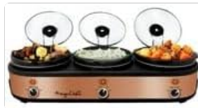
Image: The slow cooker with its three lids open and placed on the integrated lid rests, demonstrating their functionality.