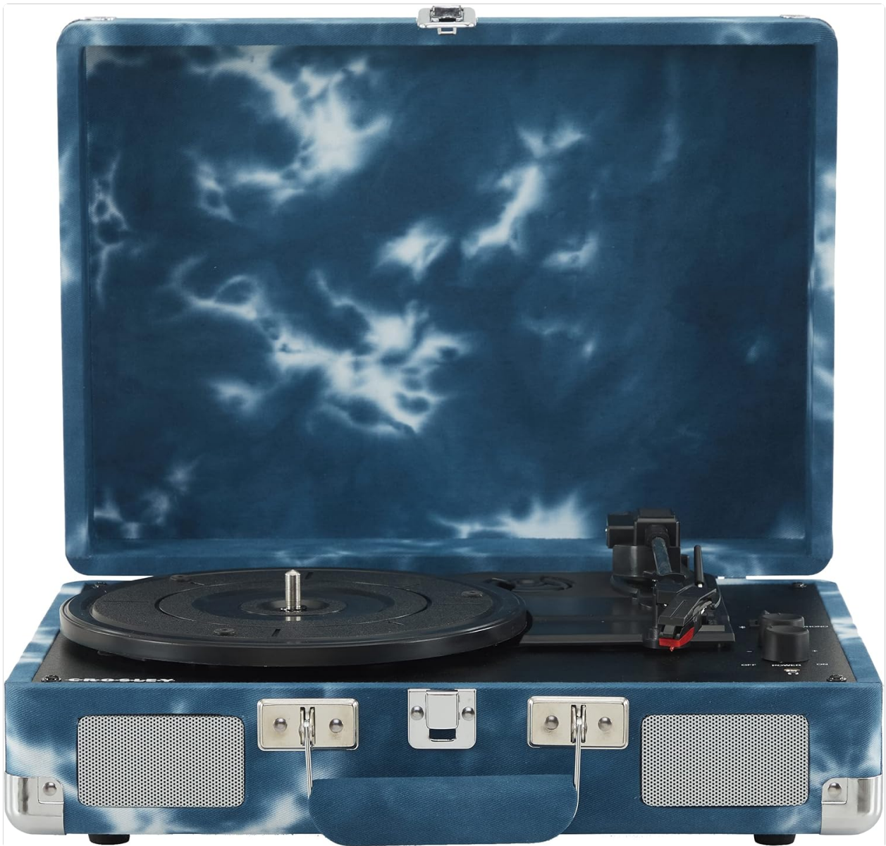
Image: The Crosley CR8005F Cruiser Plus Turntable, showcasing its portable suitcase design and open platter.