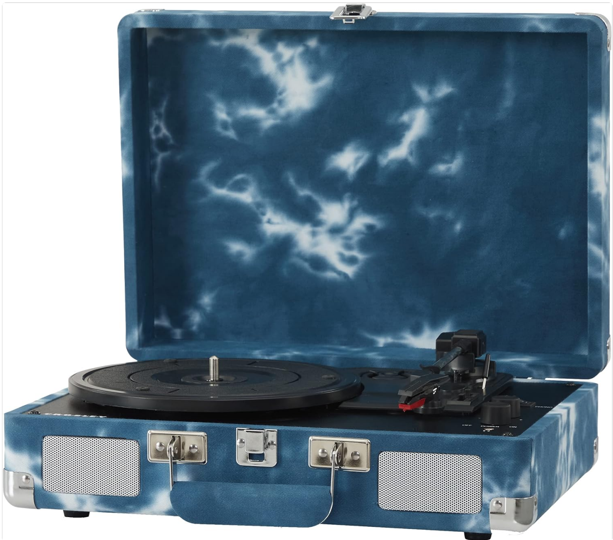
Image: A detailed view of the turntable's stylus and tonearm, ready to play a record.