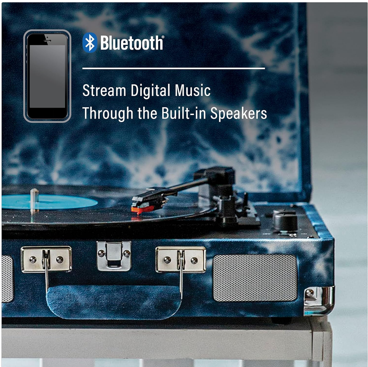
Image: A smartphone connected via Bluetooth to the turntable, demonstrating digital music playback through the integrated speakers.