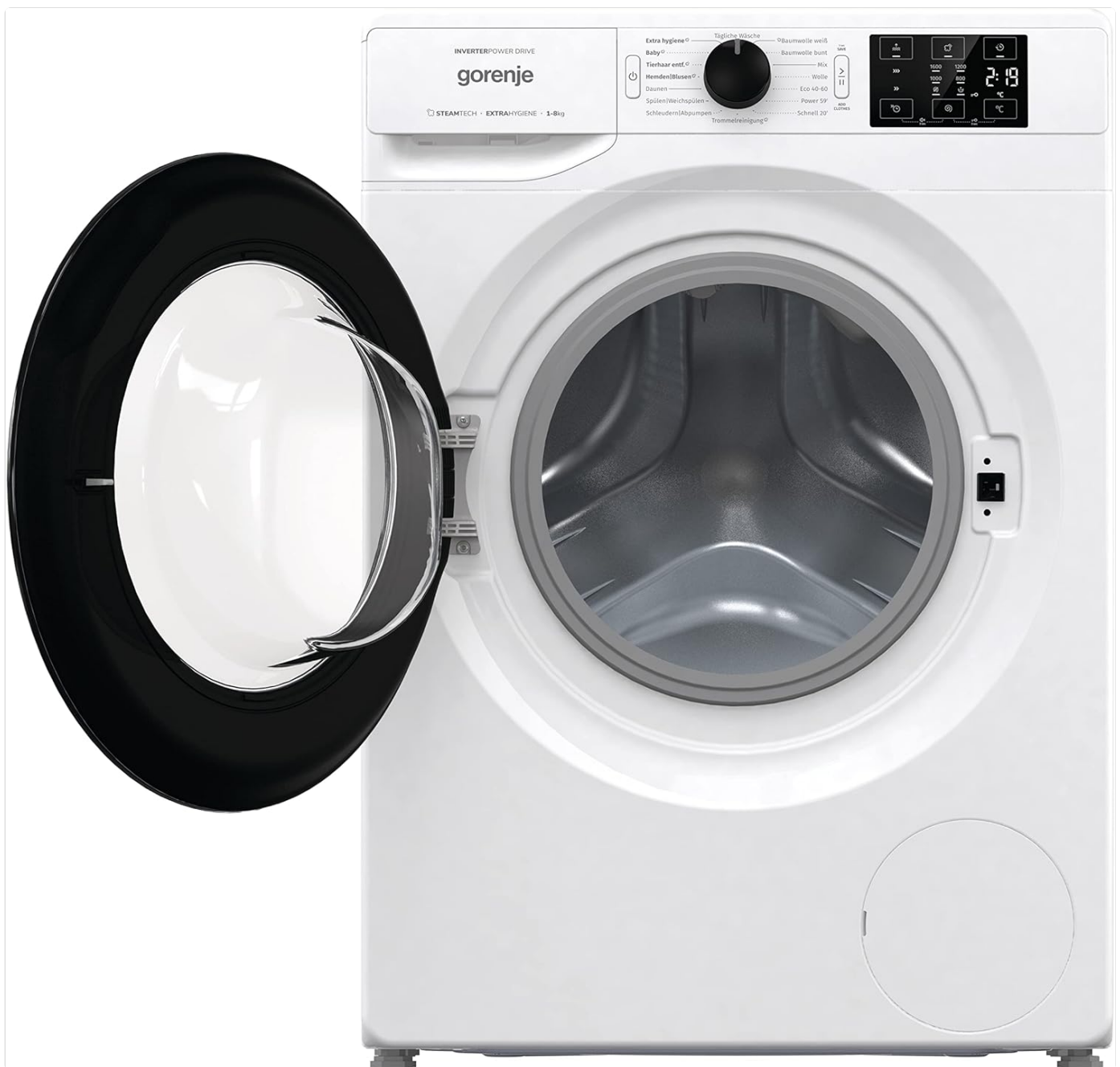
Image: The washing machine with its front-loading door open, revealing the stainless steel drum.