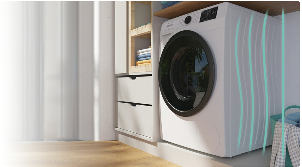
Image: An illustration showing steam inside the washing machine drum, representing the SteamTech function for hygienic cleaning.