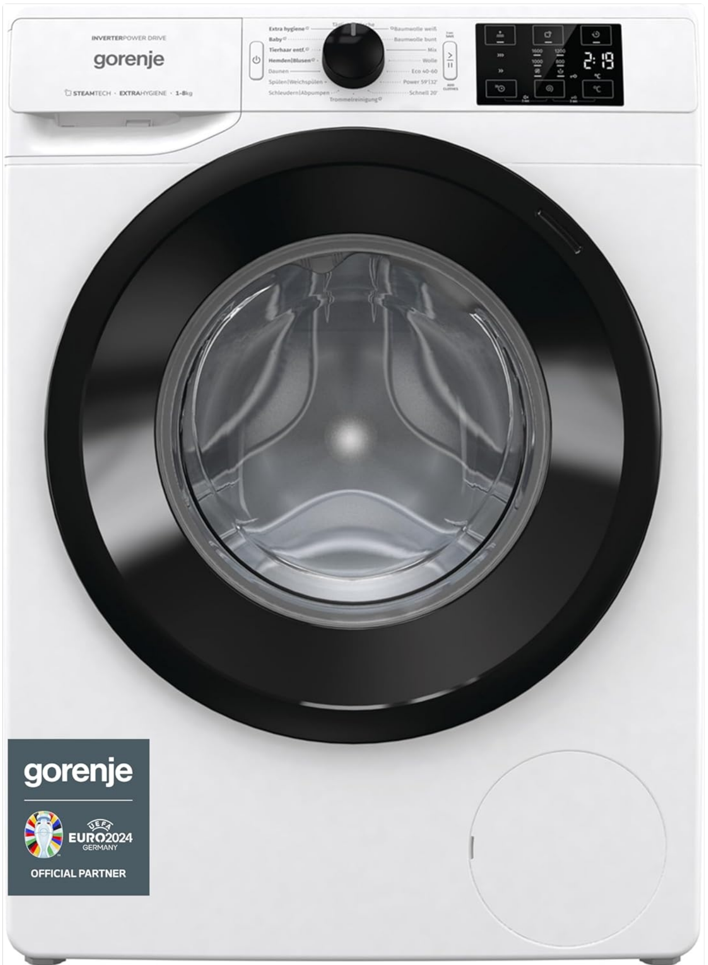
Image: Front view of the Gorenje WNEI 86 APS washing machine, showcasing its white body and black door.