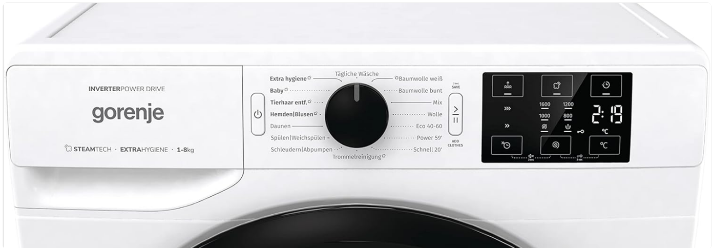
Image: Detailed view of the washing machine's control panel, showing the program dial, digital display, and function buttons.

The control panel features a program selector knob, a digital display, and various touch buttons for additional functions and settings. The display shows the selected program, remaining time, and other relevant information.