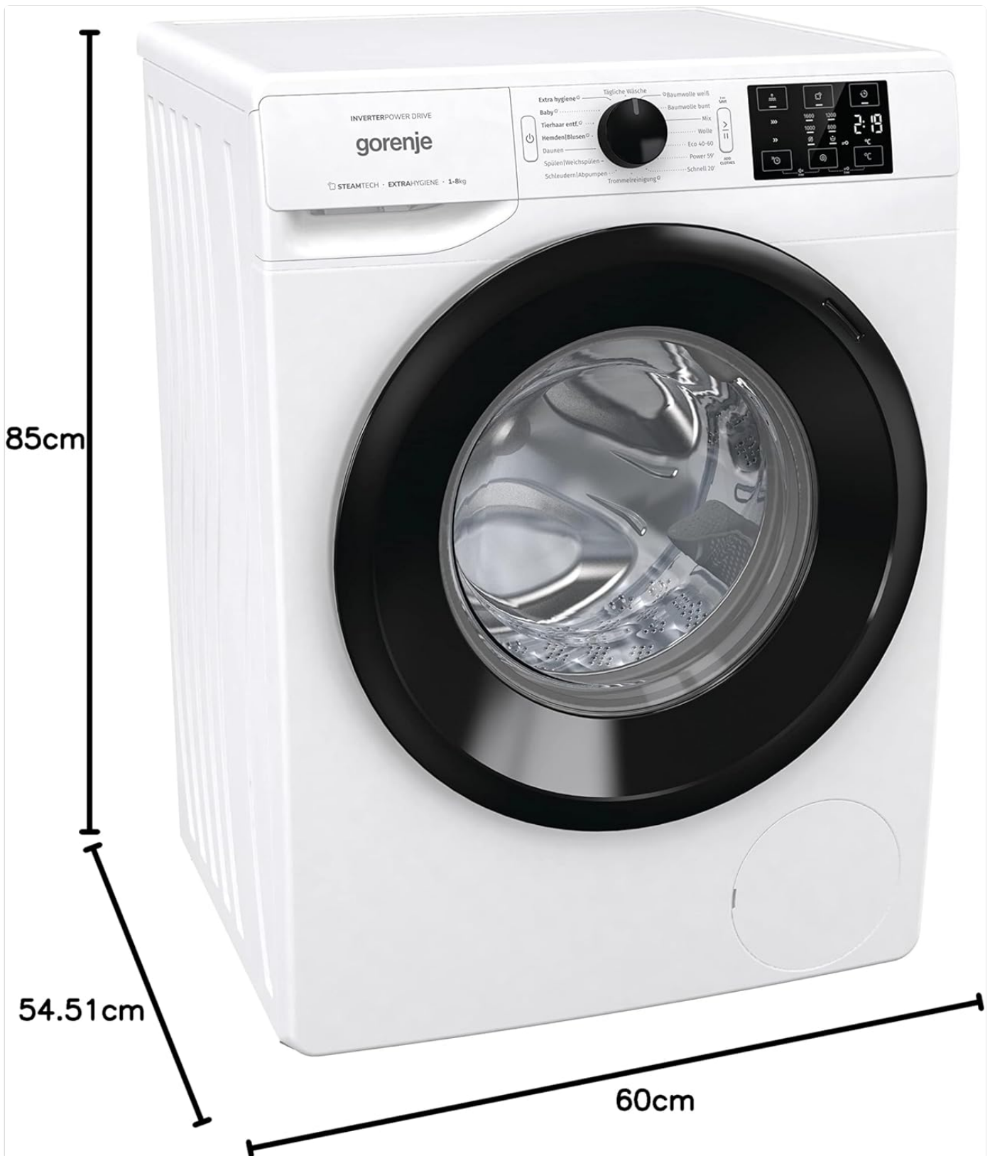
Image: Diagram showing the dimensions of the Gorenje WNEI 86 APS washing machine: 85cm height, 60cm width, and 54.51cm depth.