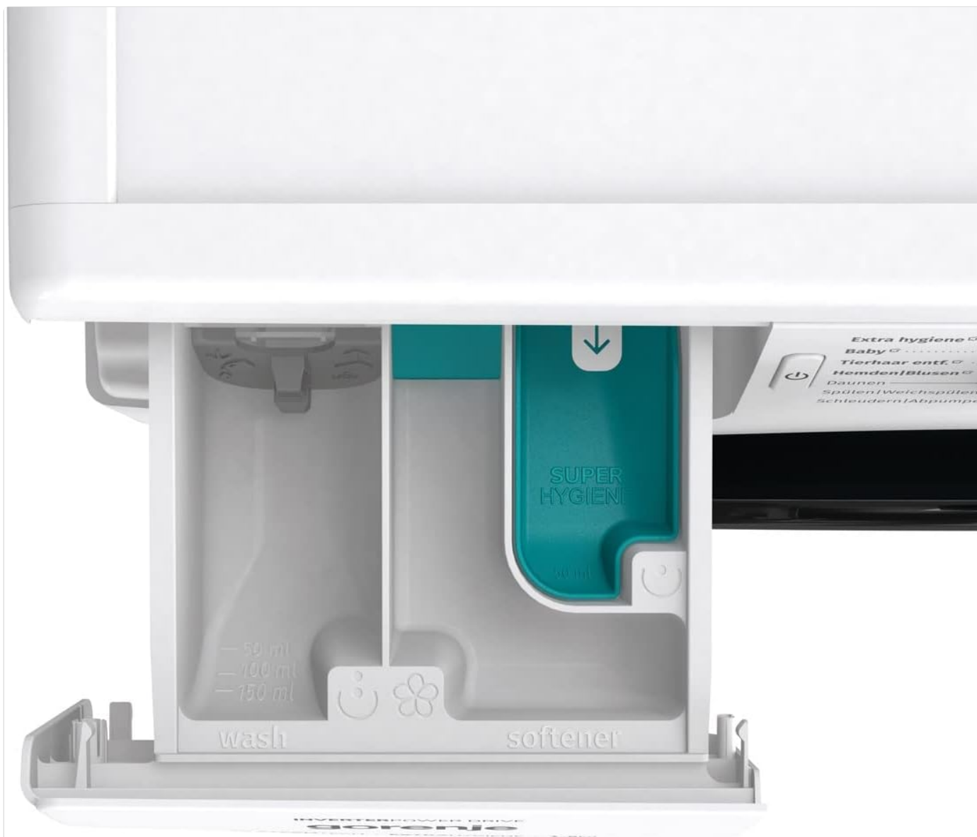
Image: Close-up of the detergent dispenser drawer, showing compartments for wash and softener.