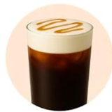
Caramel Cold Brew