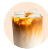
Caramel Iced Latte

✓ Pure Taste: Zero Sugar & Packed with Natural Flavor.