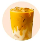
Golden Cloud Latte