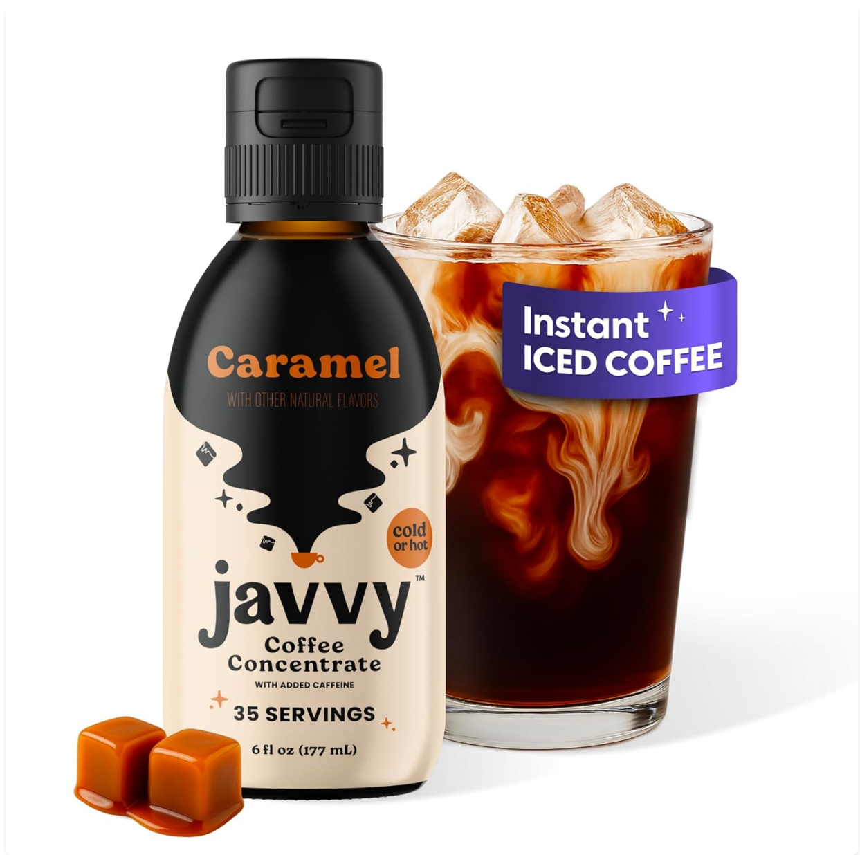
Image Description: A bottle of Javy Caramel Coffee Concentrate next to a glass of iced coffee with caramel drizzles, indicating its use for instant iced coffee.