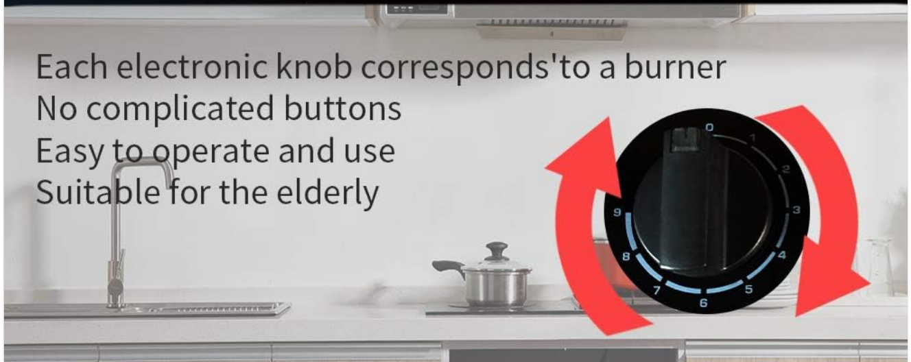
Figure 3: Electronic Knob Control

Each electronic knob corresponds to a burner No complicated buttons Easy to operate and use Suitable for the elderly