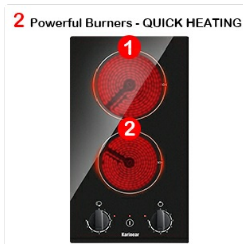
Figure 2: Two Powerful Burners

An illustration highlighting the two powerful heating zones of the cooktop, indicating their positions.