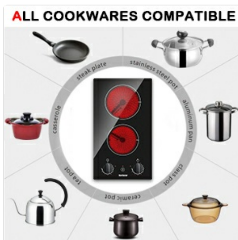
Figure 5: Cookware Compatibility

An image illustrating the wide range of cookware materials that can be safely used on the Karinear ceramic cooktop.