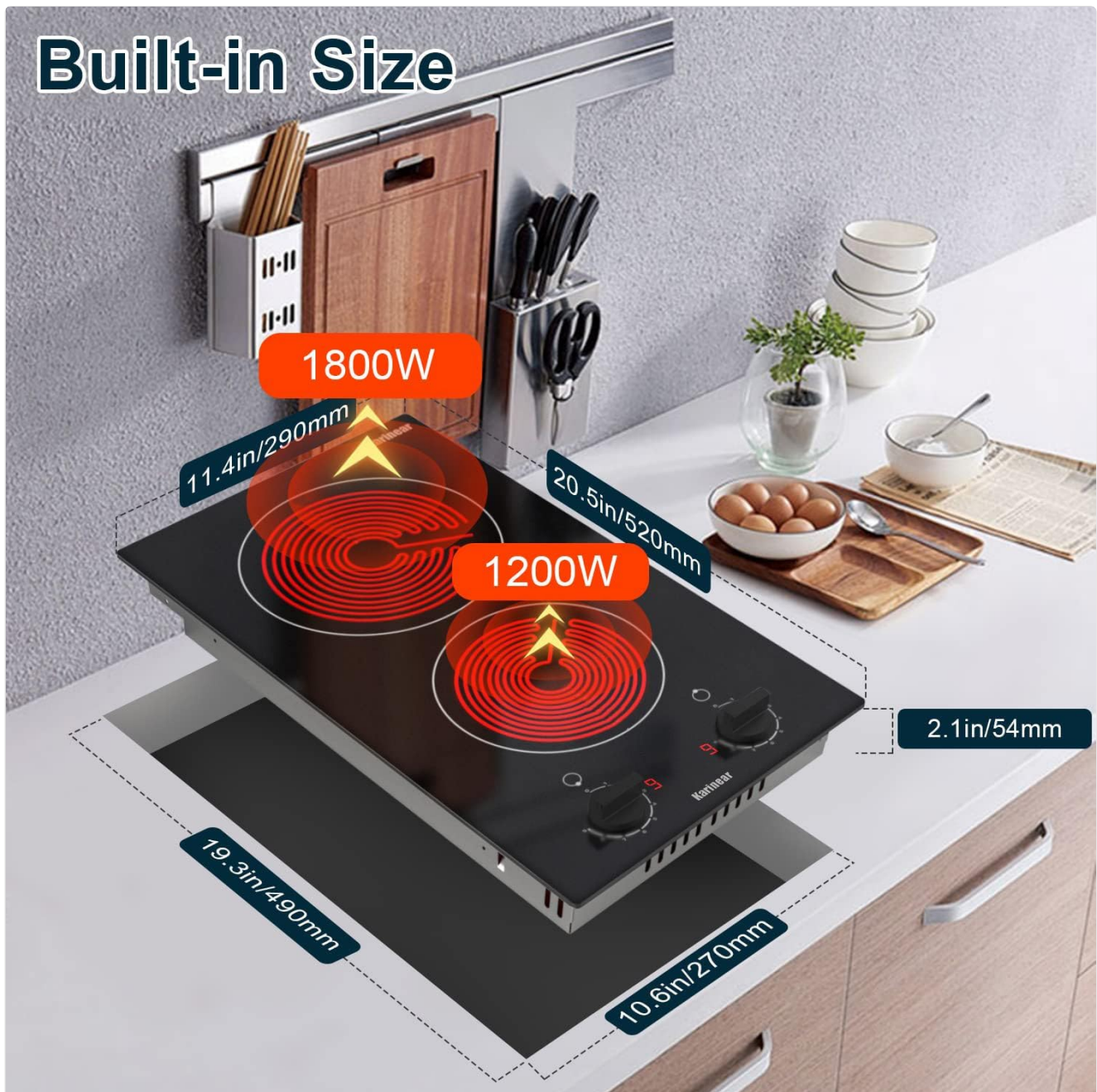
Figure 4: Built-in Dimensions Diagram

A diagram illustrating the built-in dimensions of the cooktop, showing the overall size and the required cutout dimensions for installation. It also indicates the power of each burner: 1800W and 1200W.