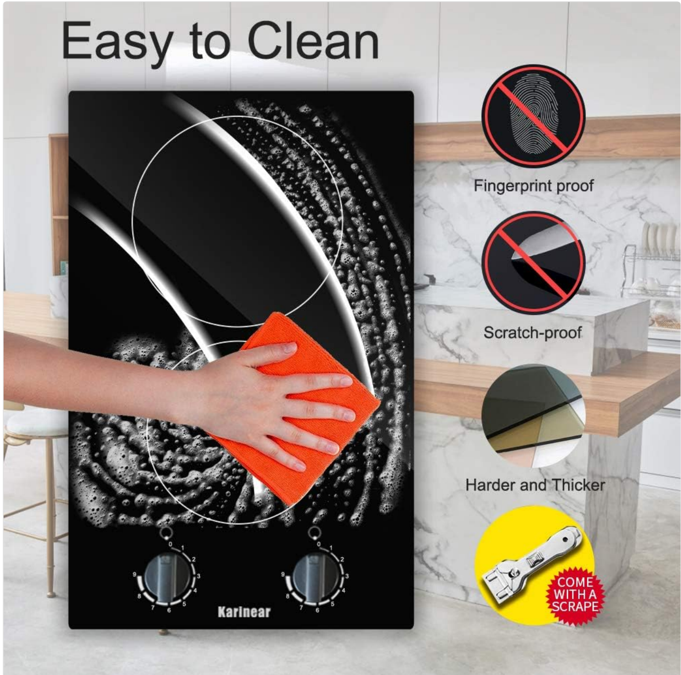
Figure 6: Easy to Clean Surface

A hand wearing a yellow glove wiping the ceramic cooktop surface, demonstrating the ease of cleaning. The image also shows a scraper, indicating it's included for cleaning stubborn stains.