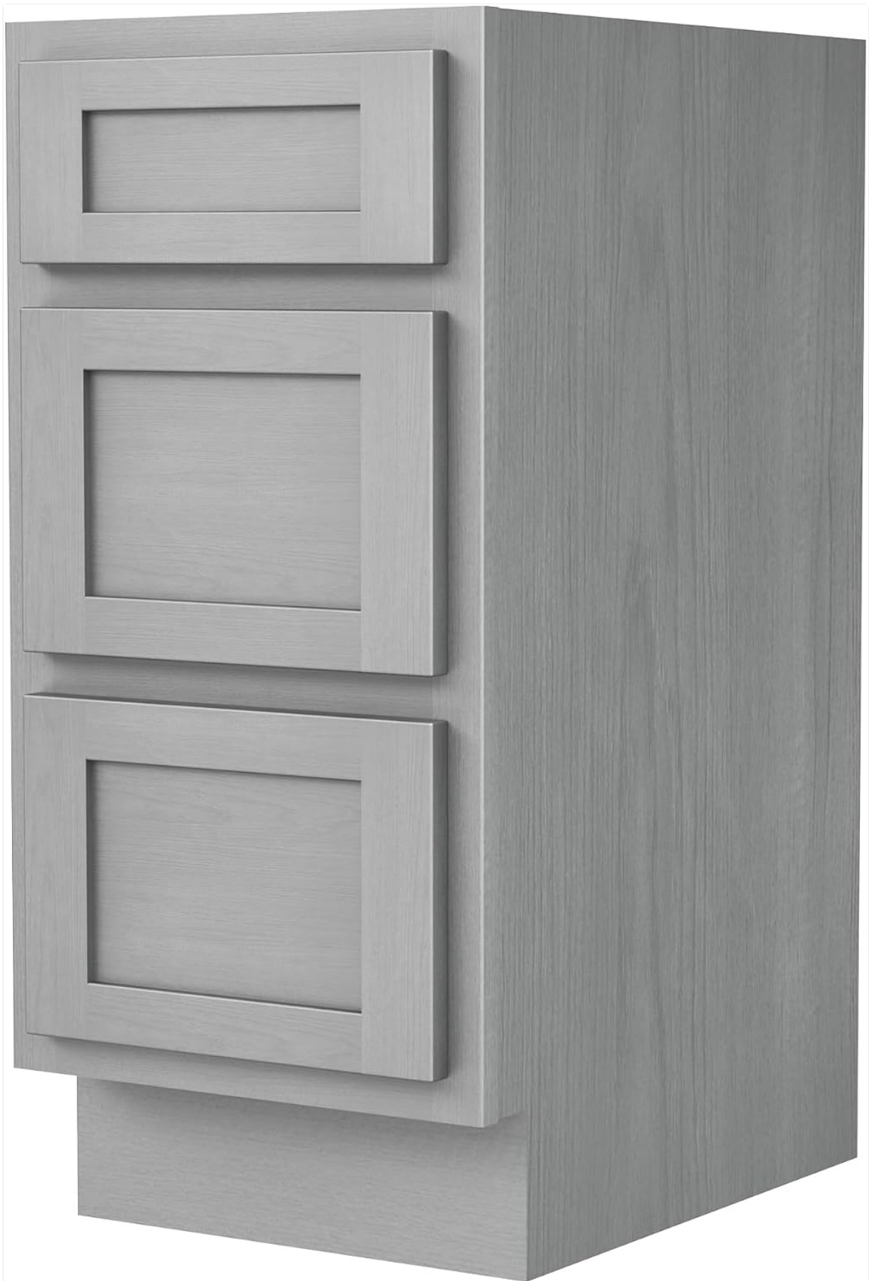
Figure 6: Side View of Cabinet