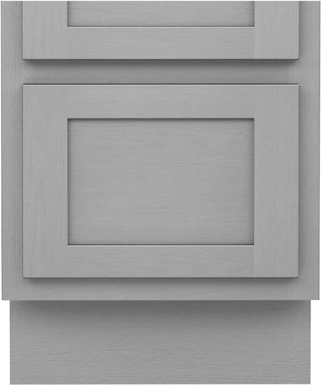
Figure 5: Front View of Cabinet