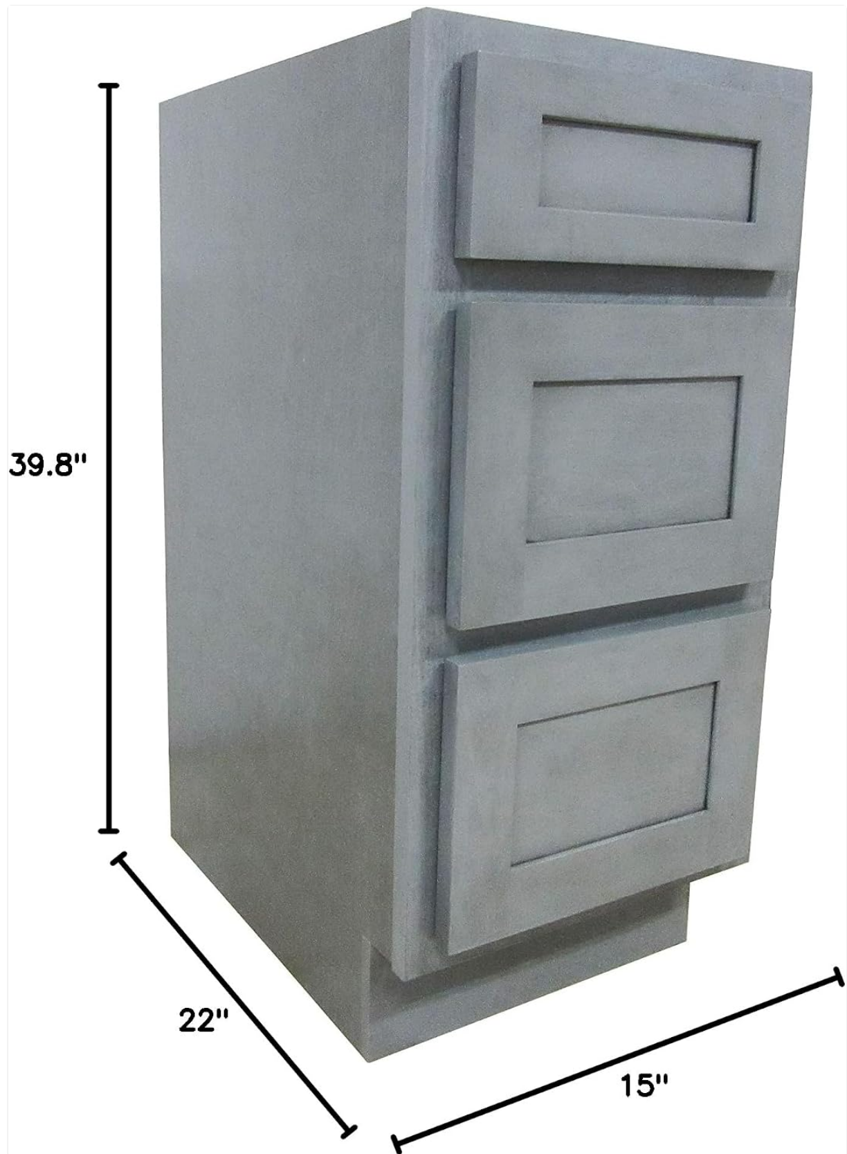
Figure 1: Product Dimensions (Height: 39.8", Depth: 22", Width: 15")