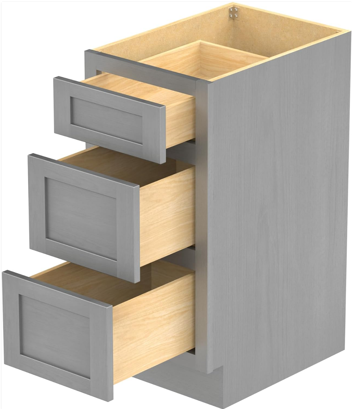
Figure 3: Drawers in Open Position