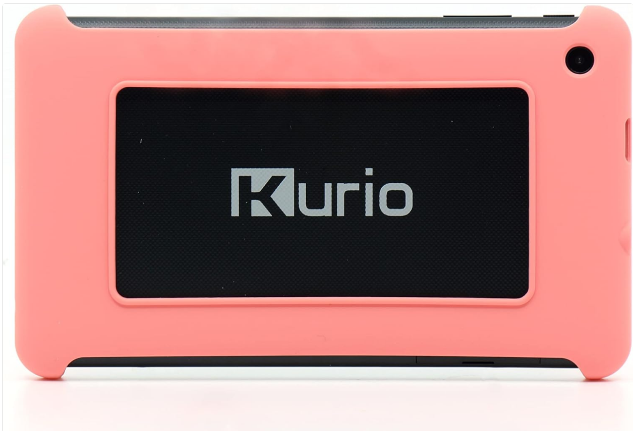
Image: The rear view of the Kurio Tab Lite 2, highlighting its durable pink silicone case and the camera lens.