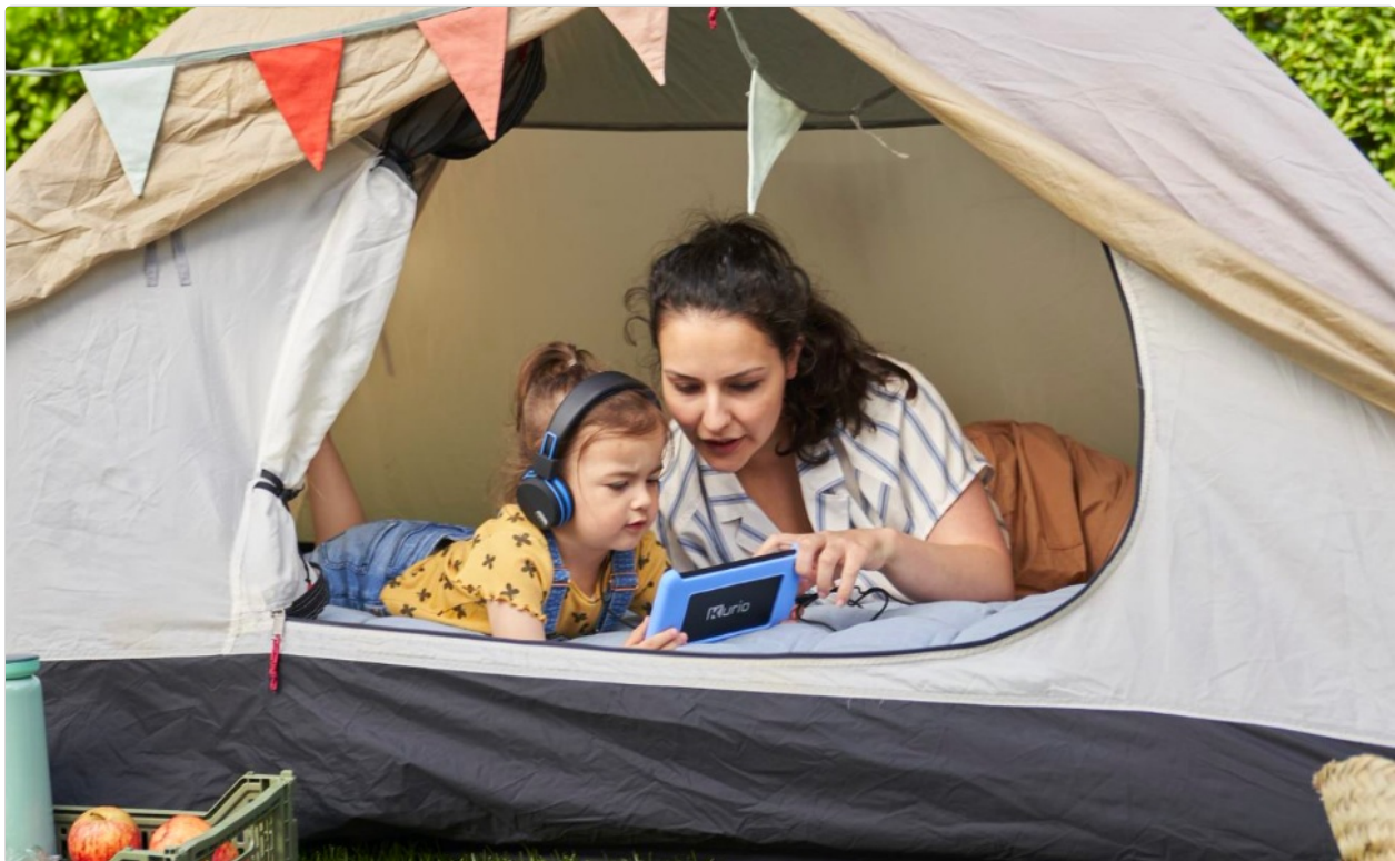
Image: A child wearing headphones and an adult interacting with the Kurio tablet inside a tent, demonstrating portable usage.

Enjoy videos, music, and e-books. The tablet's integrated ear protection feature helps safeguard your child's hearing when using headphones.