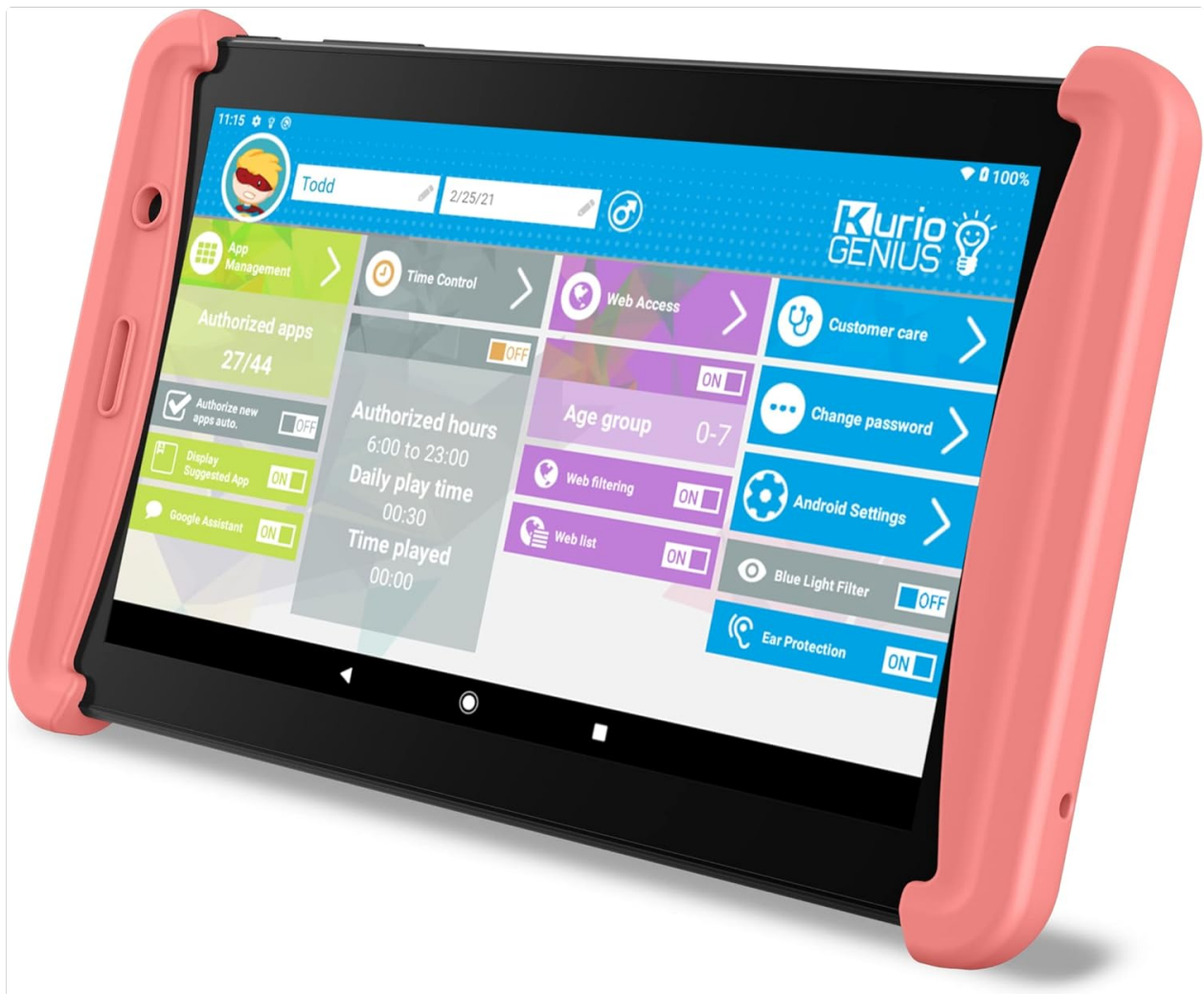
Image: The Kurio Tab Lite 2 displaying its parental control interface, showing options for app management, time control, web access, and other settings.