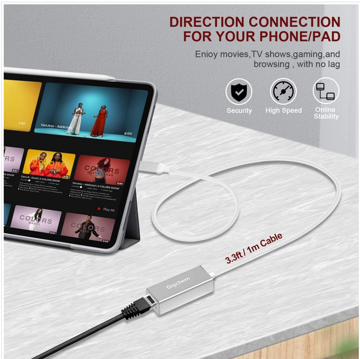
Figure 4: Device connected via Ethernet for stable streaming and gaming.