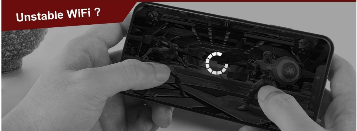
Figure 5: Illustrates the benefit of faster internet speeds with the adapter.