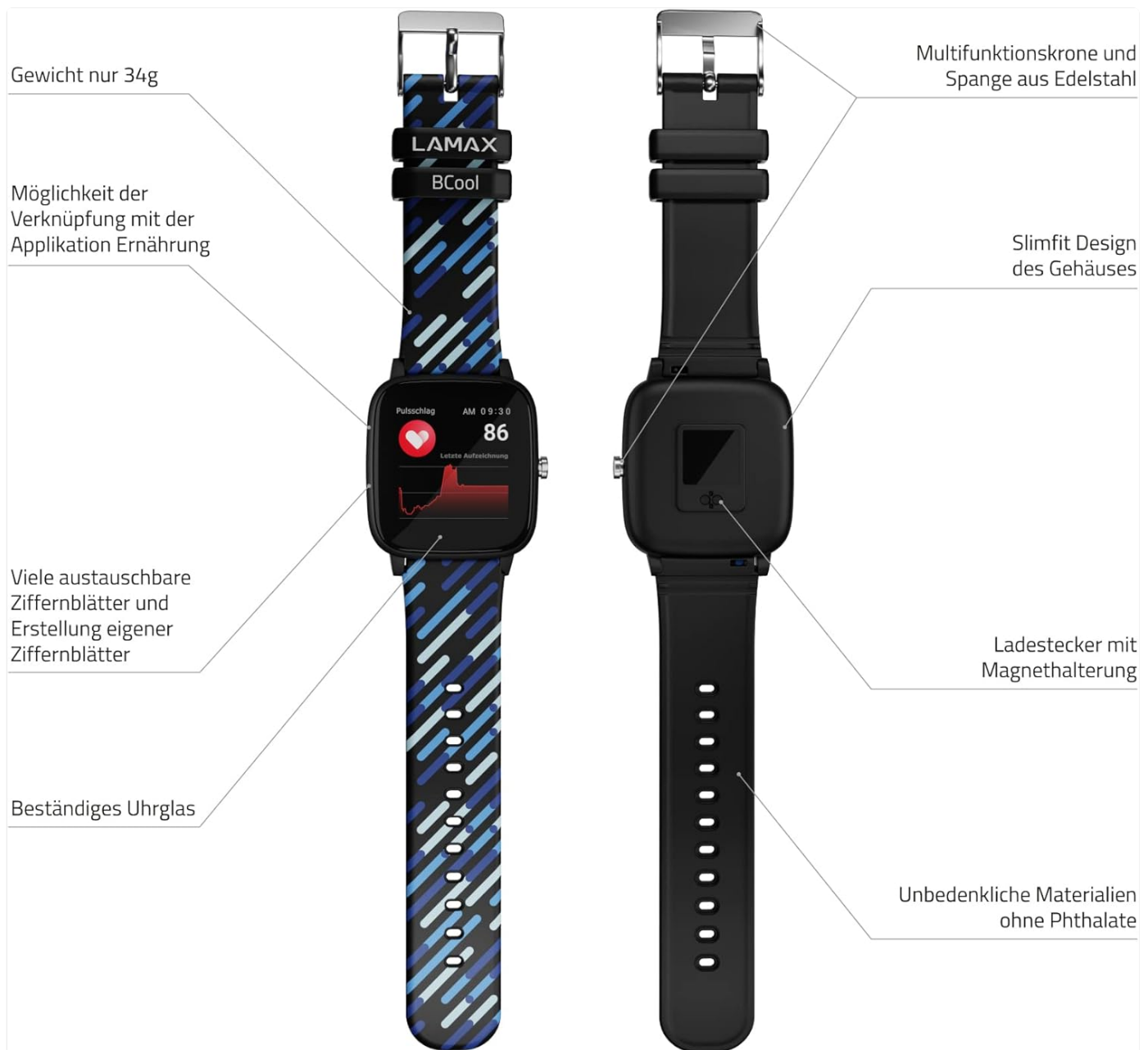
Image: A detailed view of the LAMAX BCool Smart Watch, showing its front and back. Callouts indicate features such as its light weight (34g), app connectivity, customizable watch faces, durable glass, multi-function crown, slim design, magnetic charging connector, and use of phthalate-free materials.