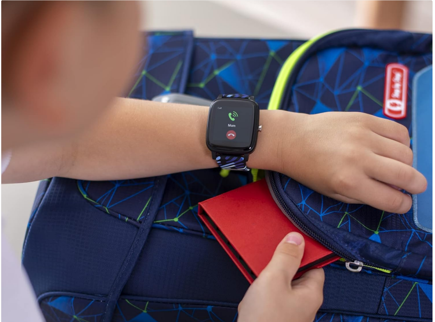
Image: A child's hand wearing the LAMAX BCool Smart Watch, which is displaying an incoming call notification from "Mom". A backpack is visible in the background.

Receive alerts for incoming calls, SMS messages, and app notifications (e.g., TikTok) directly on your watch. The watch will vibrate to alert you.