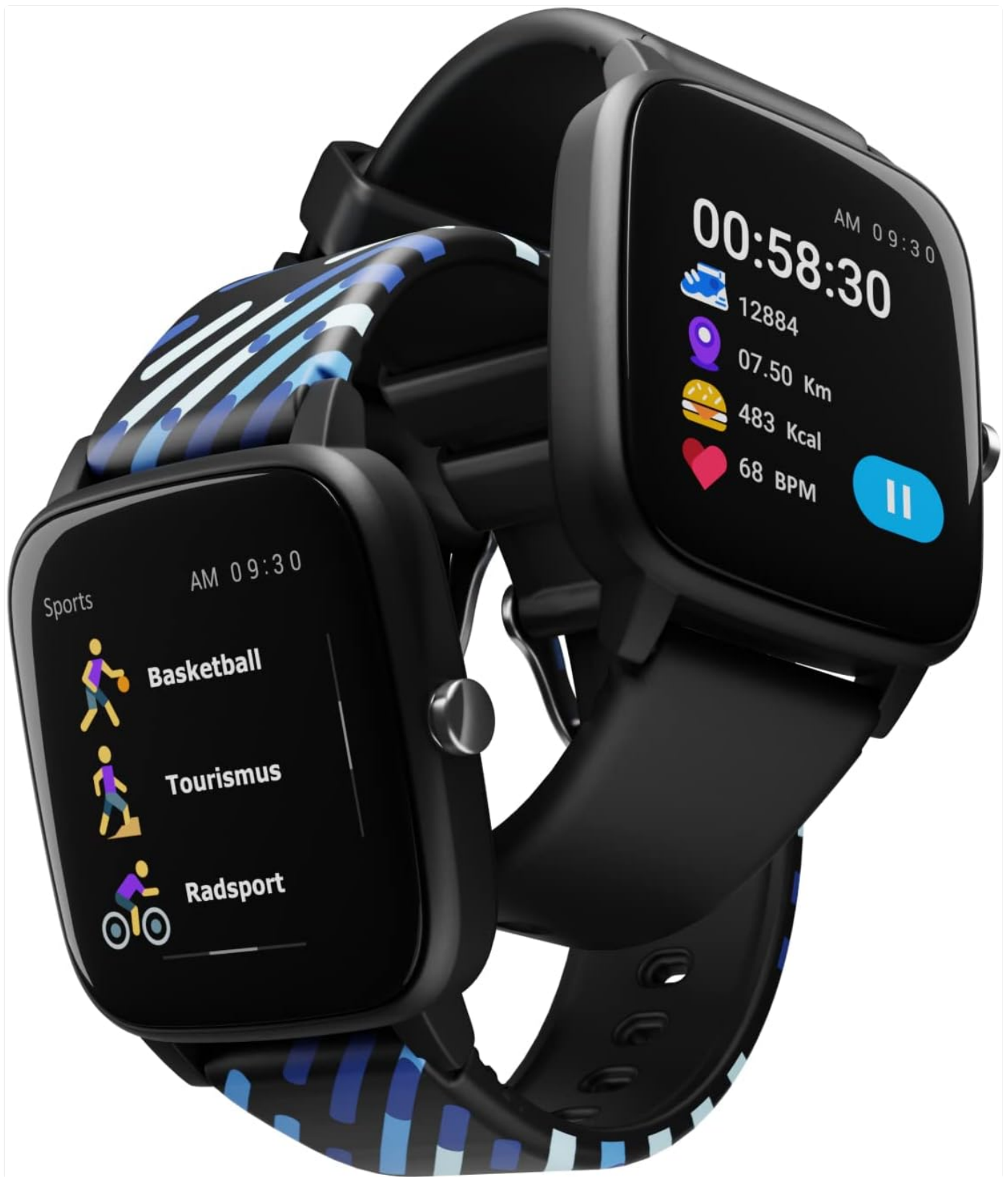
Image: Two LAMAX BCool Smart Watches. One watch displays a menu of sports activities including Basketball, Tourism, and Cycling. The other watch shows active tracking data, including elapsed time (00:58:30), distance (0.750 Km), calories burned (483 Kcal), and heart rate (68 BPM).