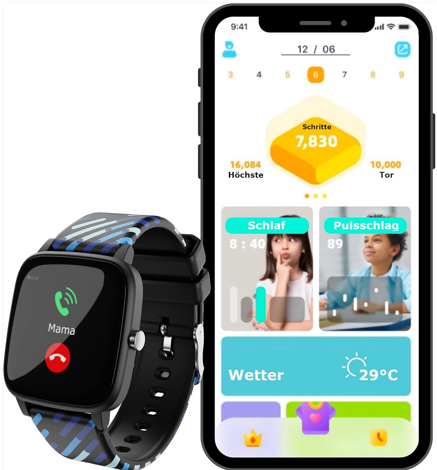
Image: The LAMAX BCool Smart Watch displaying an incoming call, positioned next to a smartphone screen that shows the companion app's dashboard with daily steps (7,830), sleep duration (8:40), heart rate (89 BPM), and current weather (29°C).