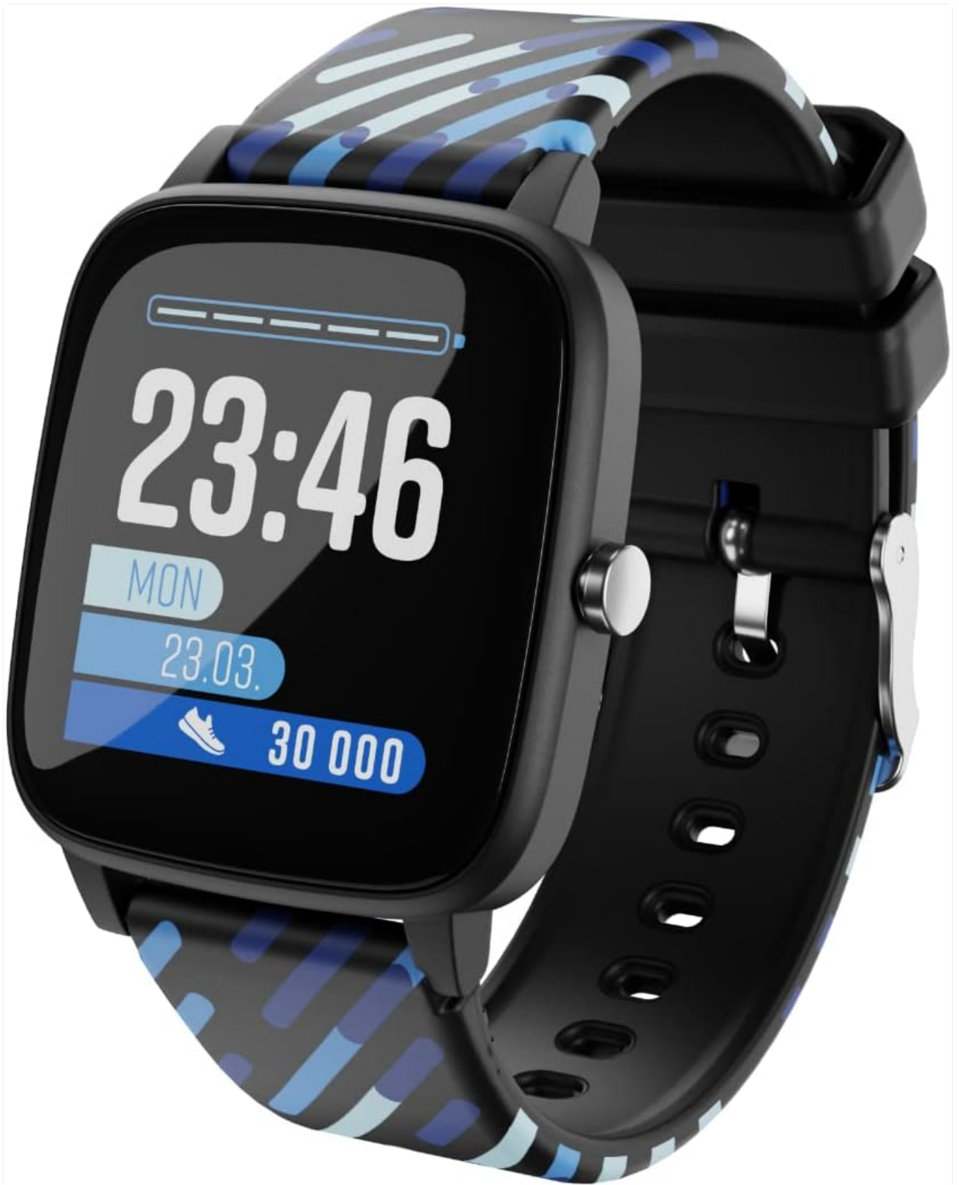
Image: The LAMAX BCool Smart Watch, featuring a black body and a blue patterned strap, displays the current time and step count on its screen.