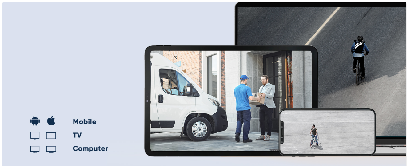
Image: Easy remote control supports live viewing and replaying on various devices.

Access your DVR remotely from anywhere using your smartphone, tablet, computer, or laptop via 3G/4G/5G or Wi-Fi. Download the official SANNCE application from your device's app store (Google Play Store or Apple App Store) or use a compatible web browser (e.g., Internet Explorer) to monitor your property.