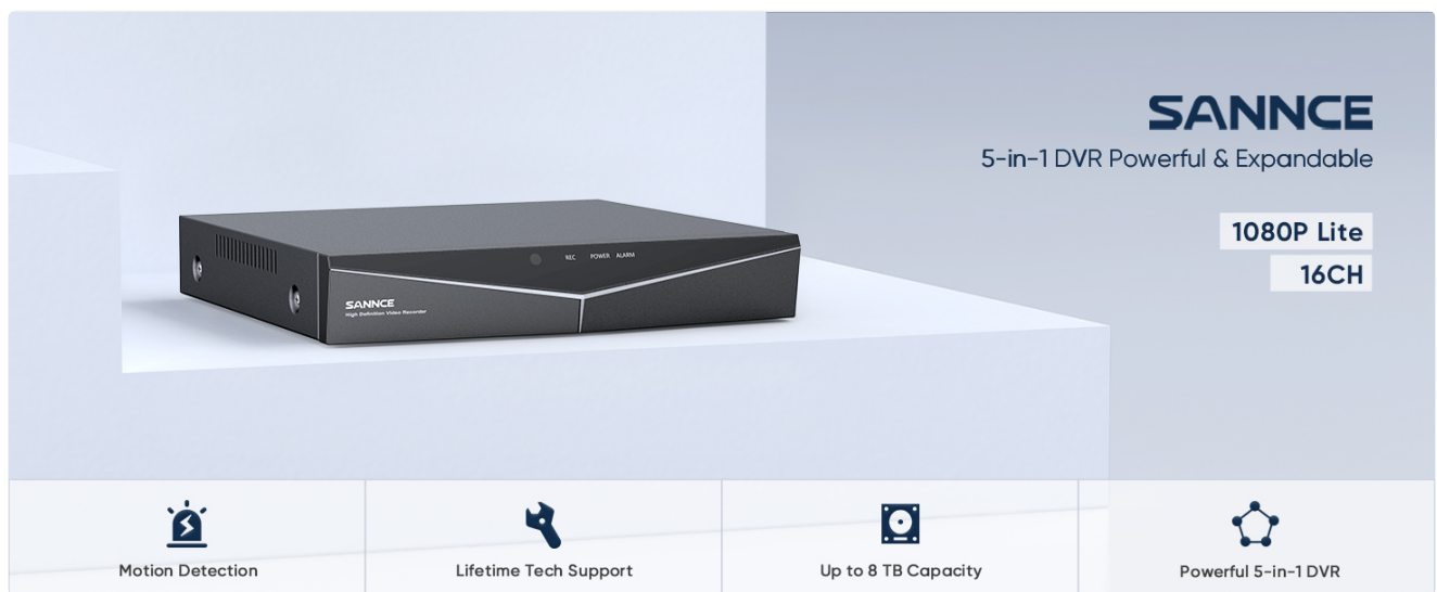
Image: The SANNCE 16 Channel DVR offers 1080P Full HD live streaming for comprehensive surveillance.

This manual provides detailed instructions for the installation, operation, and maintenance of your SANNCE 16 Channel Security CCTV DVR. This 5-in-1 hybrid video recorder supports TVI, AHD, CVI, CVBS analog, and IP security cameras up to 1080p Full HD resolution. It includes a pre-installed 2TB hard drive for continuous 24/7 recording and features smart motion alerts and remote access capabilities.