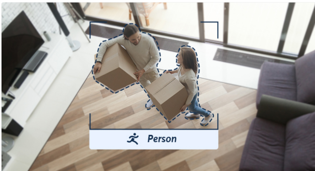
Image: Smart Human Detection triggers push alarm emails and messages to your mobile device.

The DVR features an advanced motion detection algorithm. When motion is detected, the system can send real-time app push notifications and email alerts to your configured devices. This allows you to quickly access the video recorder to review the event and take appropriate action.