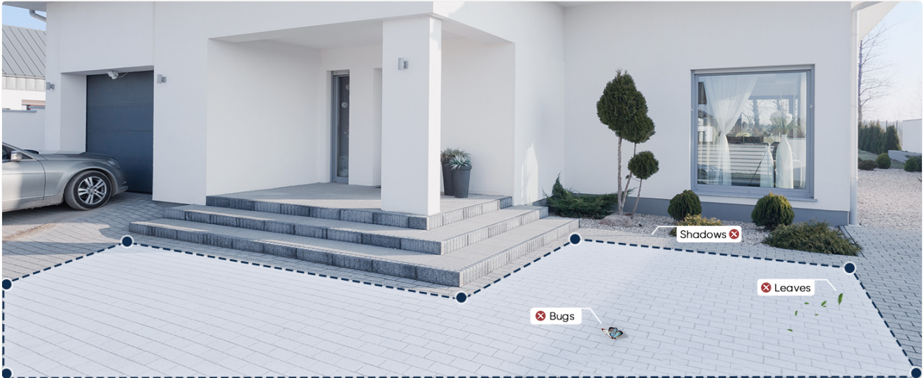
Image: The system offers 24/7 uninterrupted surveillance for complete protection.

The DVR provides continuous 24/7 recording to the pre-installed 2TB hard drive. You can view live feeds from all connected cameras on a local monitor or remotely via the mobile application or web browser.