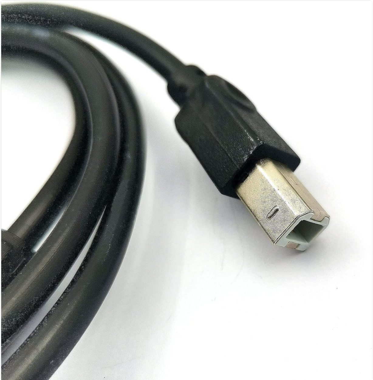
Figure 2: USB cable for board connection.