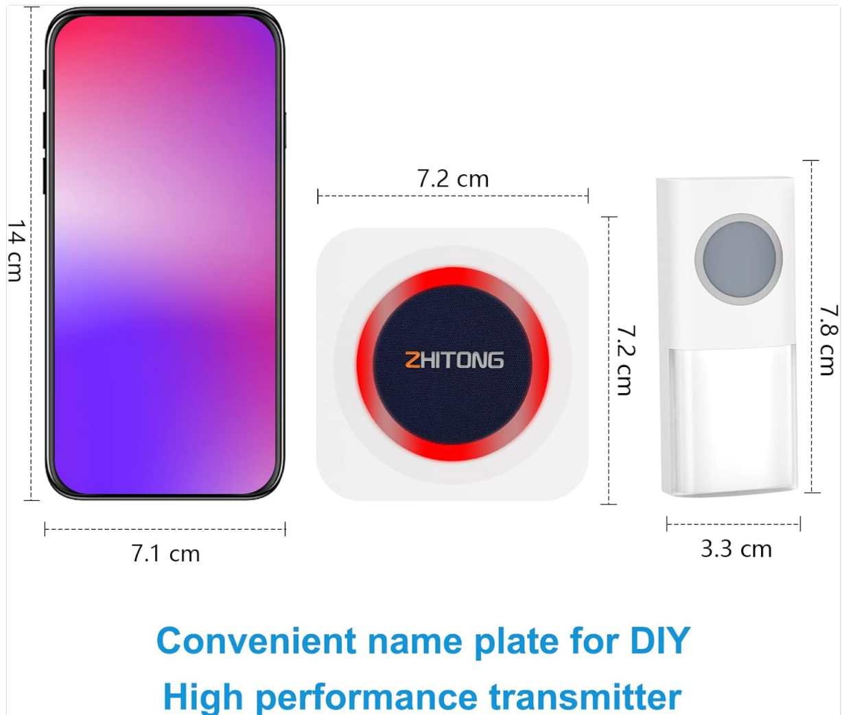
Image 2.1: Product components and their approximate dimensions. The receiver measures 7.2 cm x 7.2 cm, and the transmitter measures 3.3 cm x 7.8 cm.