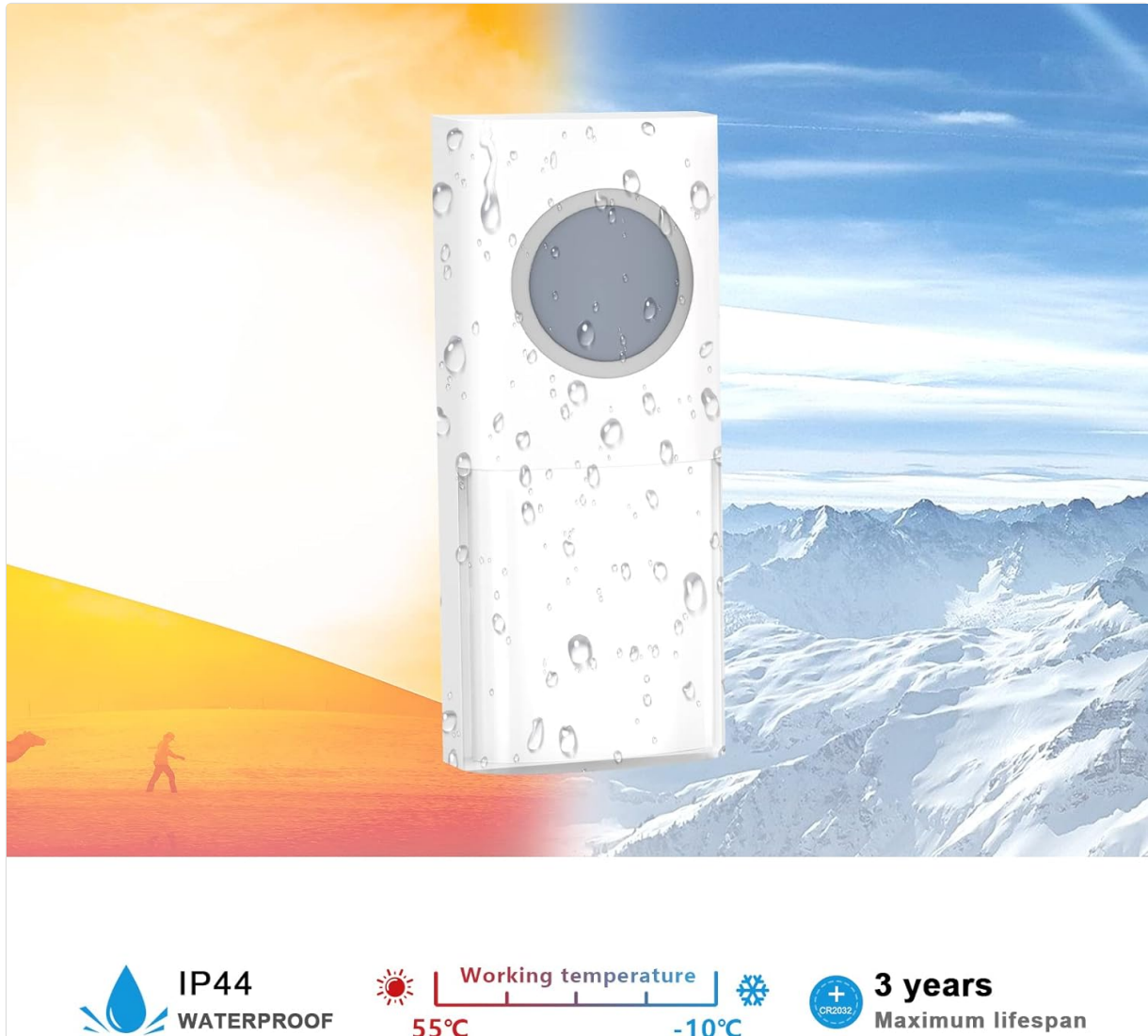
Image 5.1: The transmitter is IP44 waterproof, functional between -10°C and 55°C, and has a battery life of up to 3 years.

The transmitter is designed with an IP44 waterproof rating, making it resistant to dust and water splashes. It can operate in temperatures ranging from -10 °C to 55 °C. While it is weather-resistant, avoid submerging it in water or exposing it to extreme weather conditions for prolonged periods.