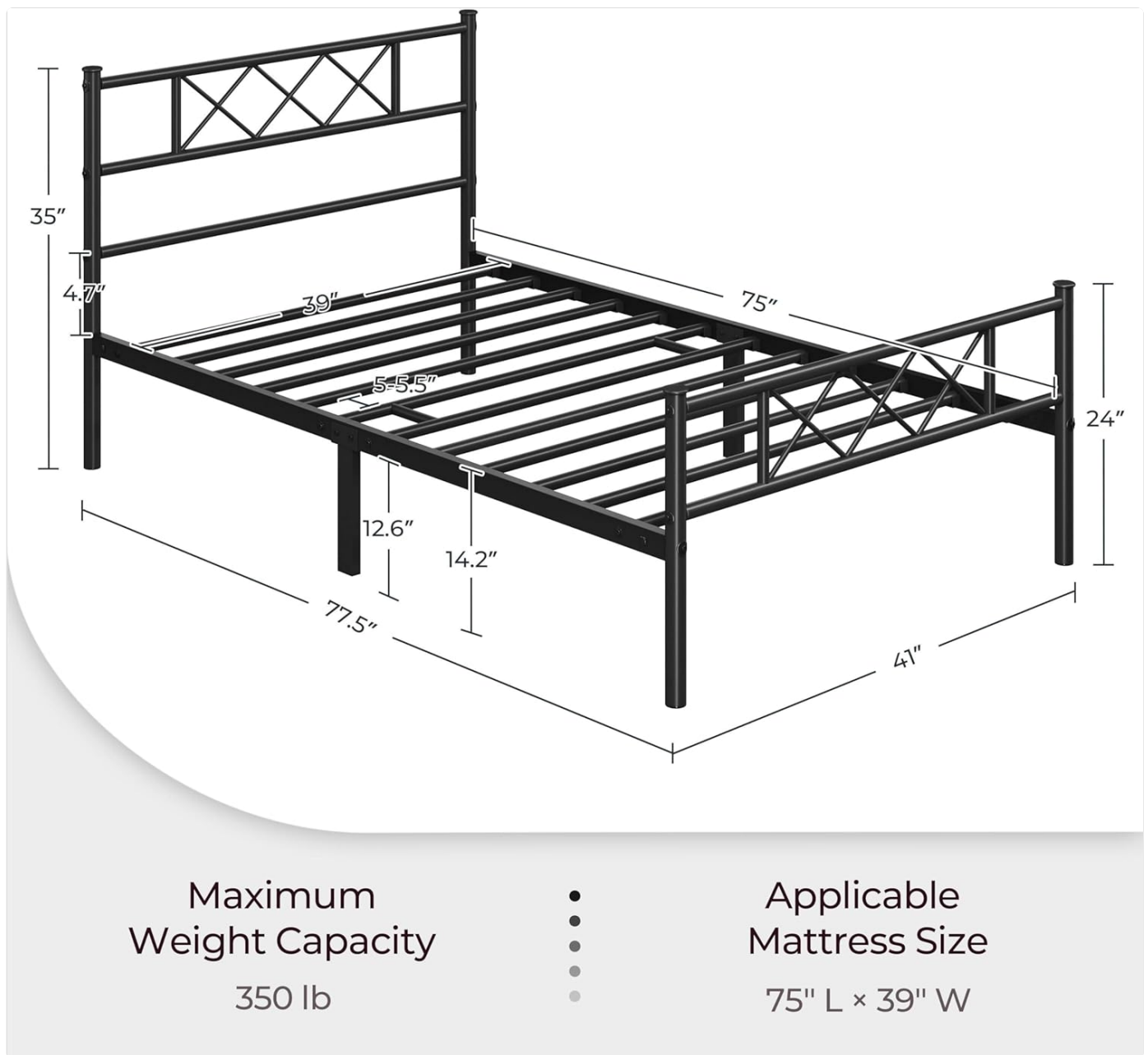
Image: Technical diagram illustrating the dimensions of the bed frame, including height, length, width, and under-bed clearance.