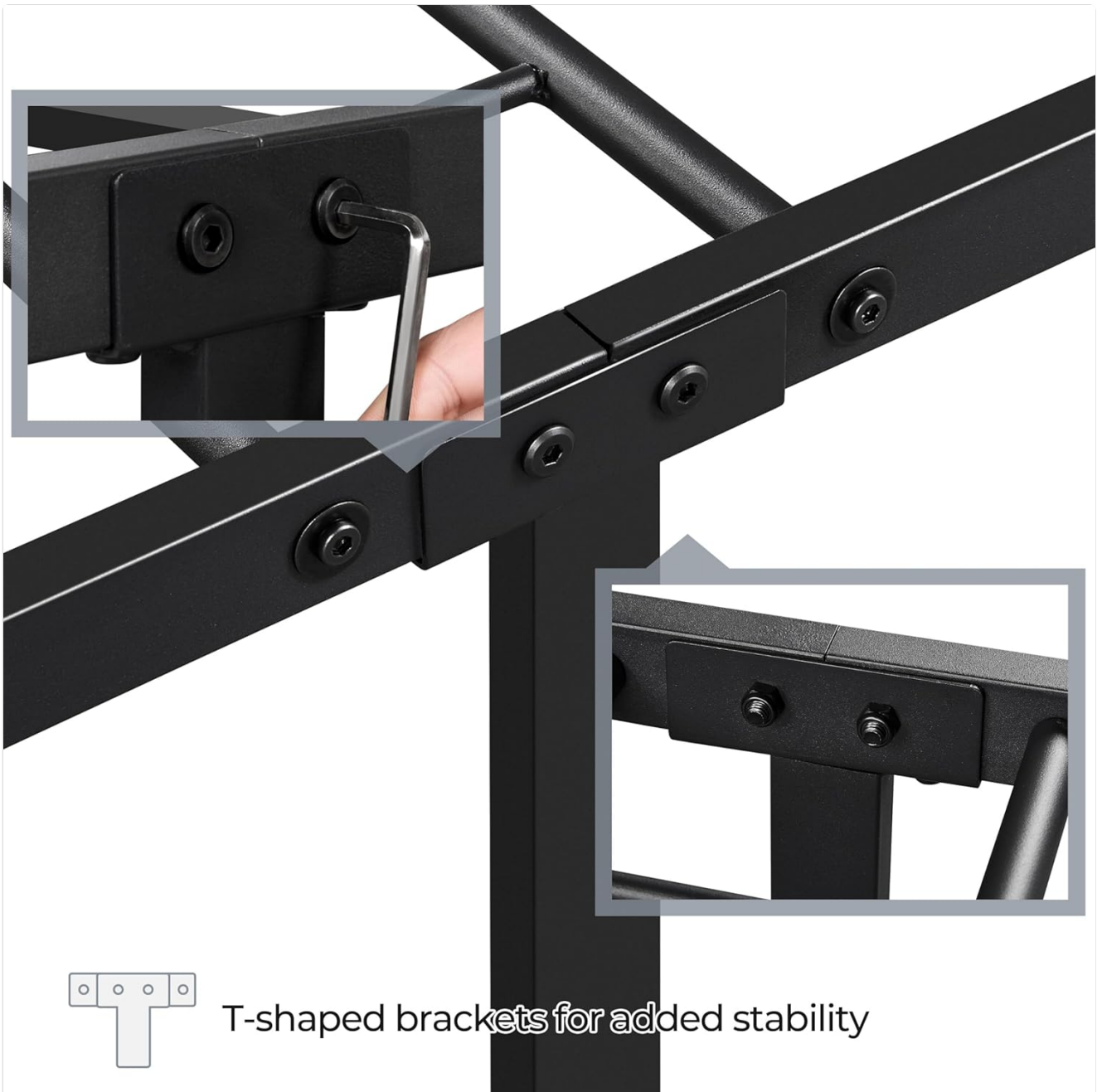
Image: Illustration of T-shaped brackets being secured with an Allen wrench, highlighting their role in enhancing frame stability.