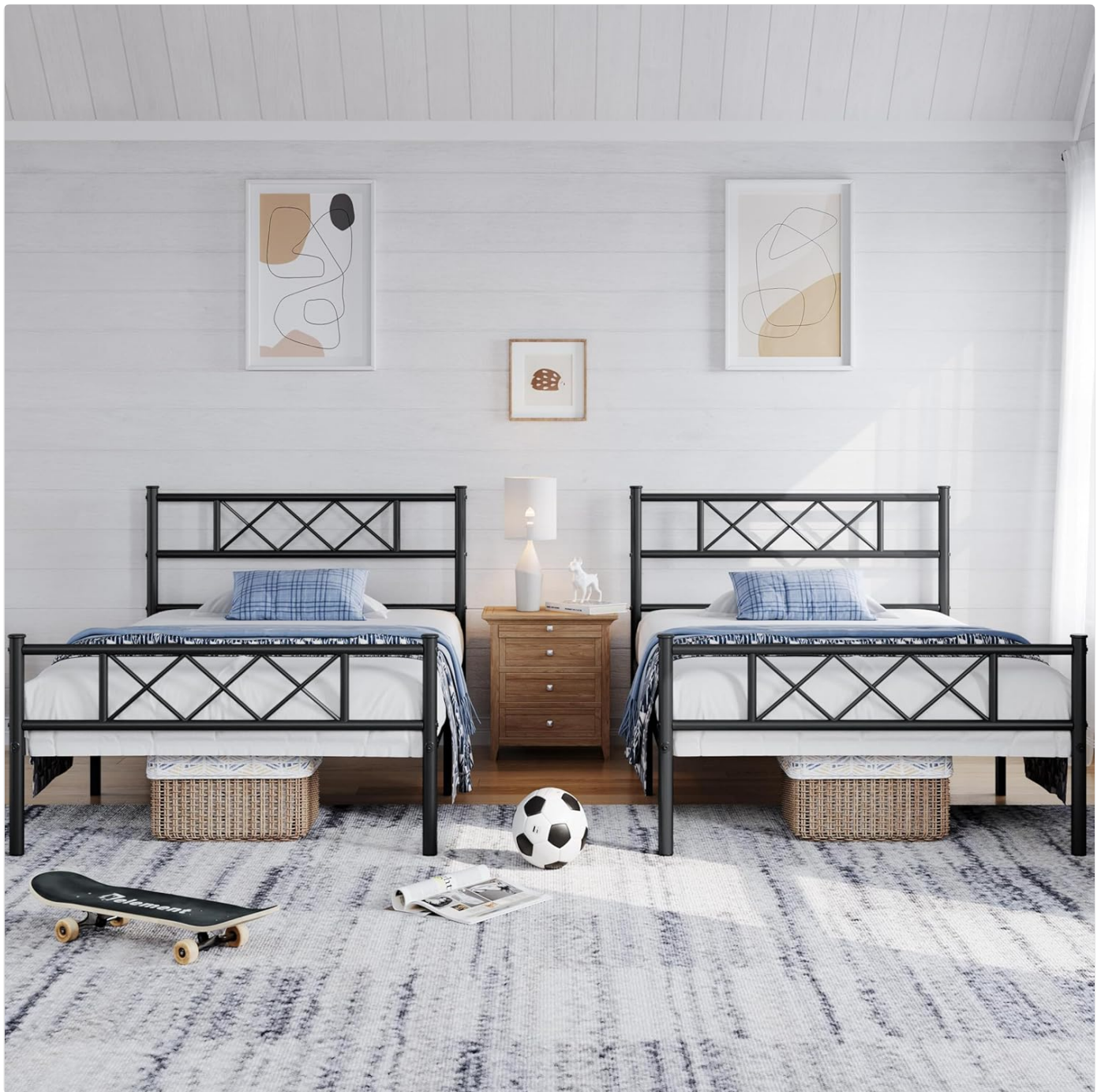
Image: Two Yaheetech Twin Metal Platform Bed Frames in a modern bedroom, showcasing their design and under-bed storage capability.