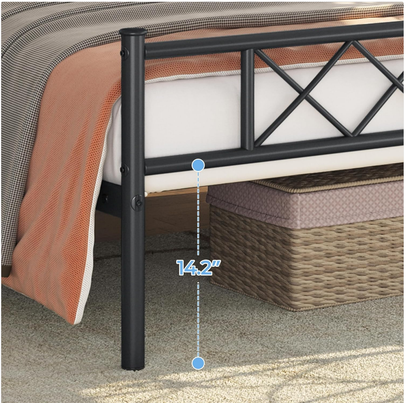
Image: A view of the bed frame highlighting the 14.2-inch under-bed clearance, demonstrating ample space for storage containers.