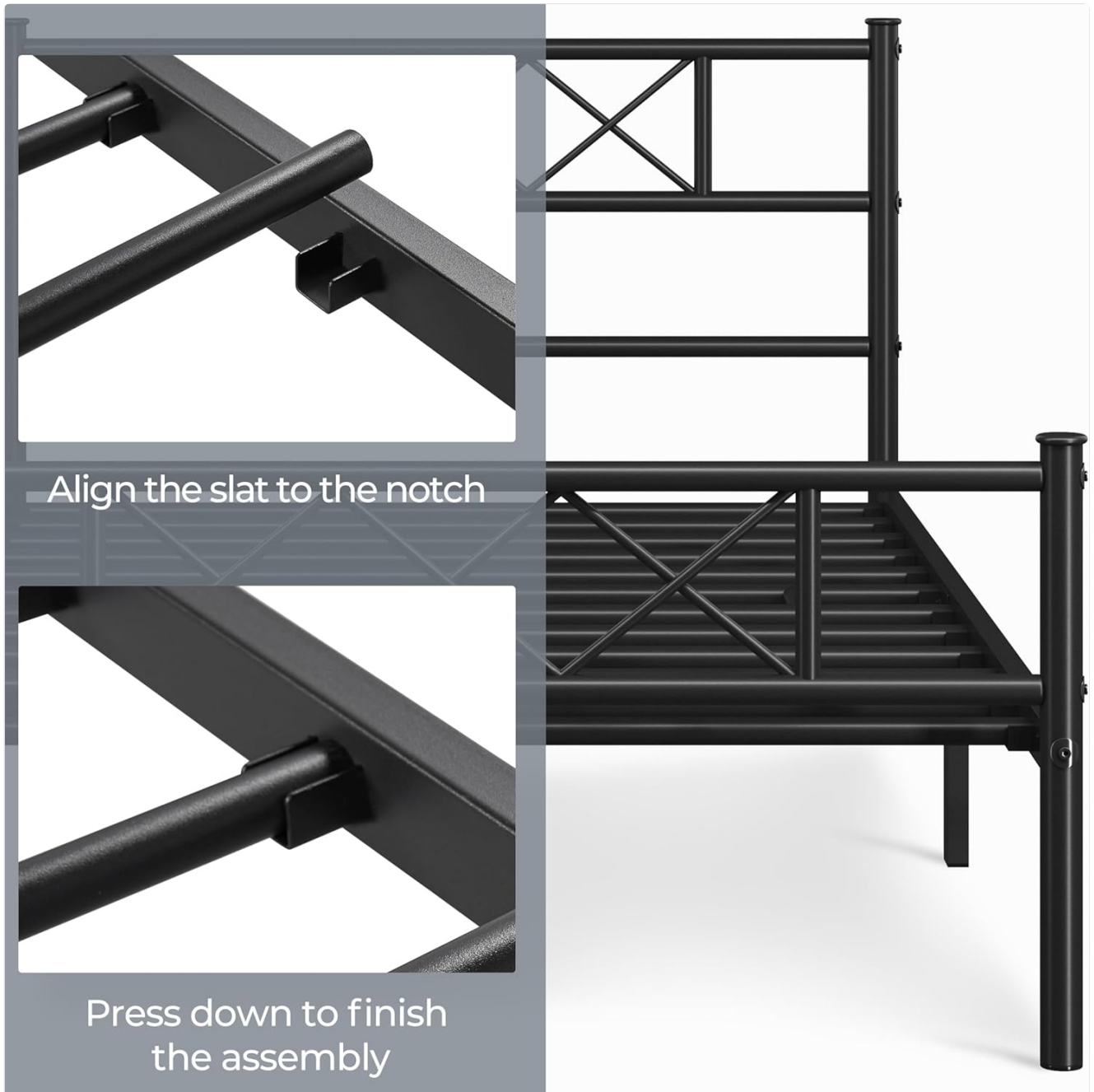
Image: Detailed view of the slat installation process, showing how to align the slat to the notch and press down to finish the assembly.