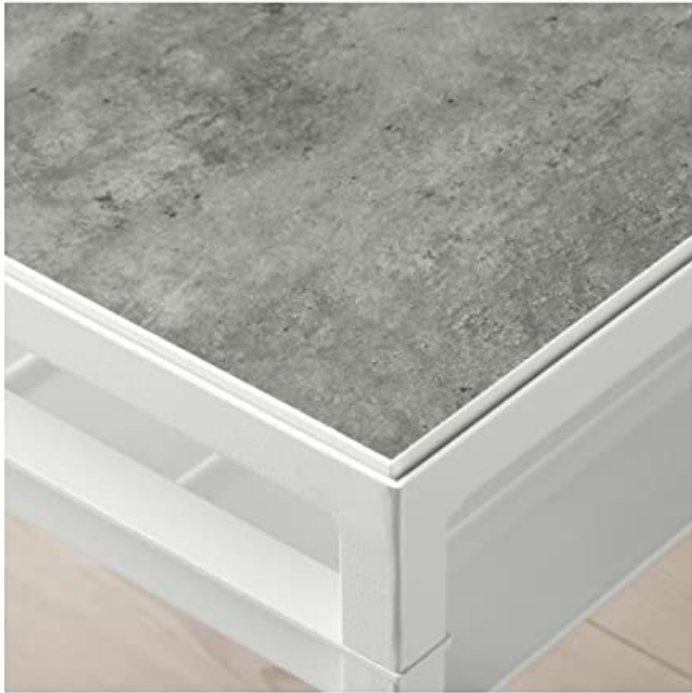
Image: A close-up view of the reversible tabletop, highlighting the dark grey concrete effect side. This demonstrates one of the two available finishes for the table surface.