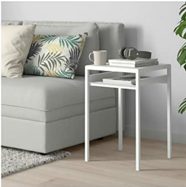
Image: The assembled Ikea NYBODA Side Table, featuring its clean lines and functional design, positioned beside a sofa. It showcases the table's compact size and suitability for living spaces.

Thank you for choosing the Ikea NYBODA Side Table. This manual provides essential information for the safe assembly, proper use, and maintenance of your new side table. Please read these instructions carefully before beginning assembly and retain them for future reference.