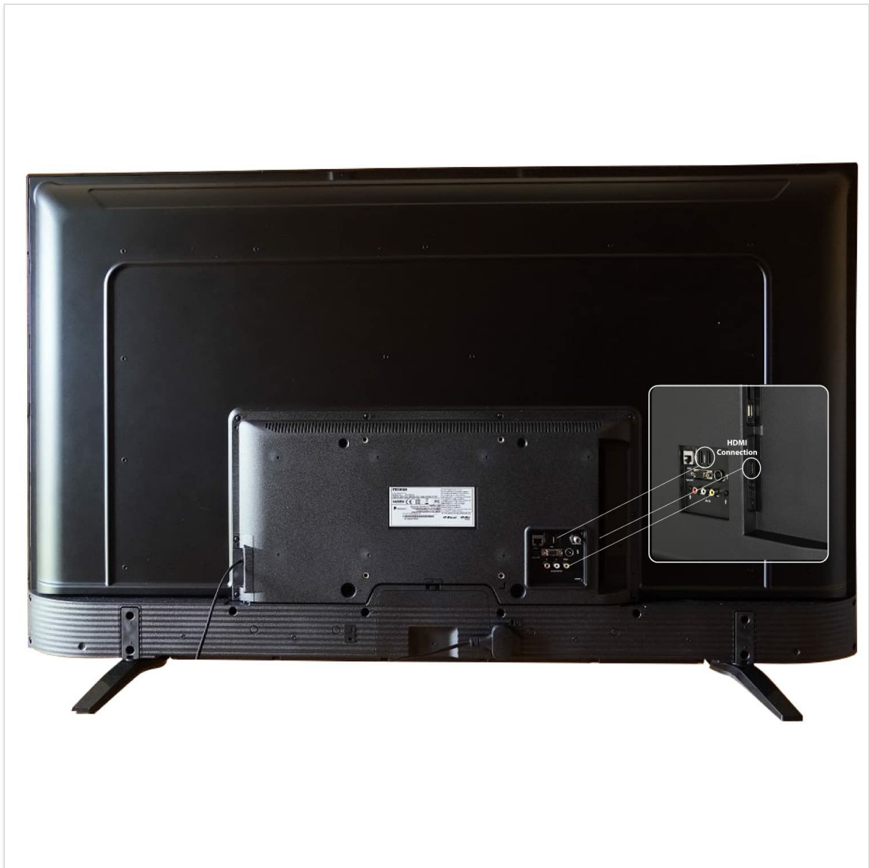
Image: Rear view of the PROSONIC Pro-24" LED TV showing dimensions and the attached table stand.