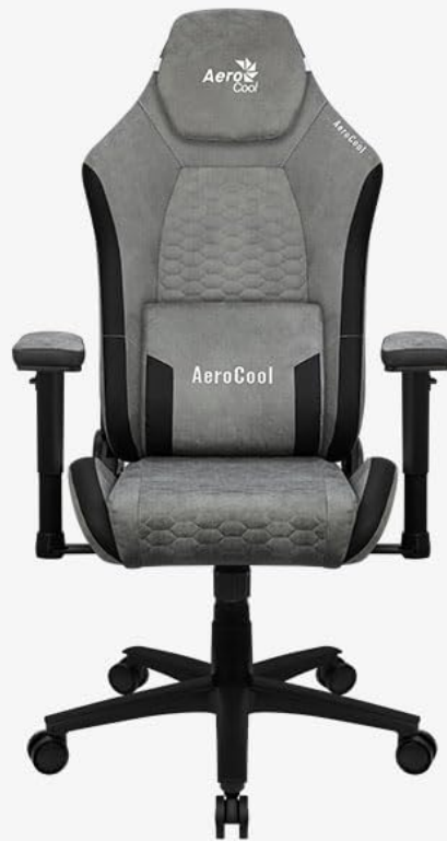
Figure 1: Front view of the AeroCool Crown AeroSuede Gaming Chair. The chair features a grey AeroSuede material with black accents, adjustable armrests, a headrest, and a five-star base with casters.