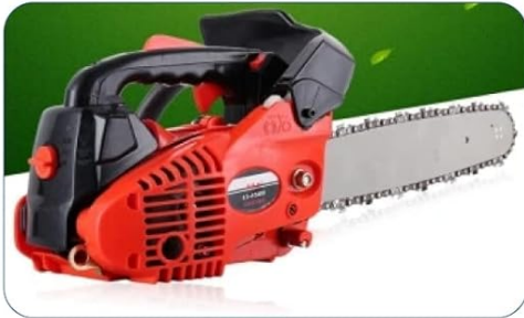
Electric Saw Trimmer