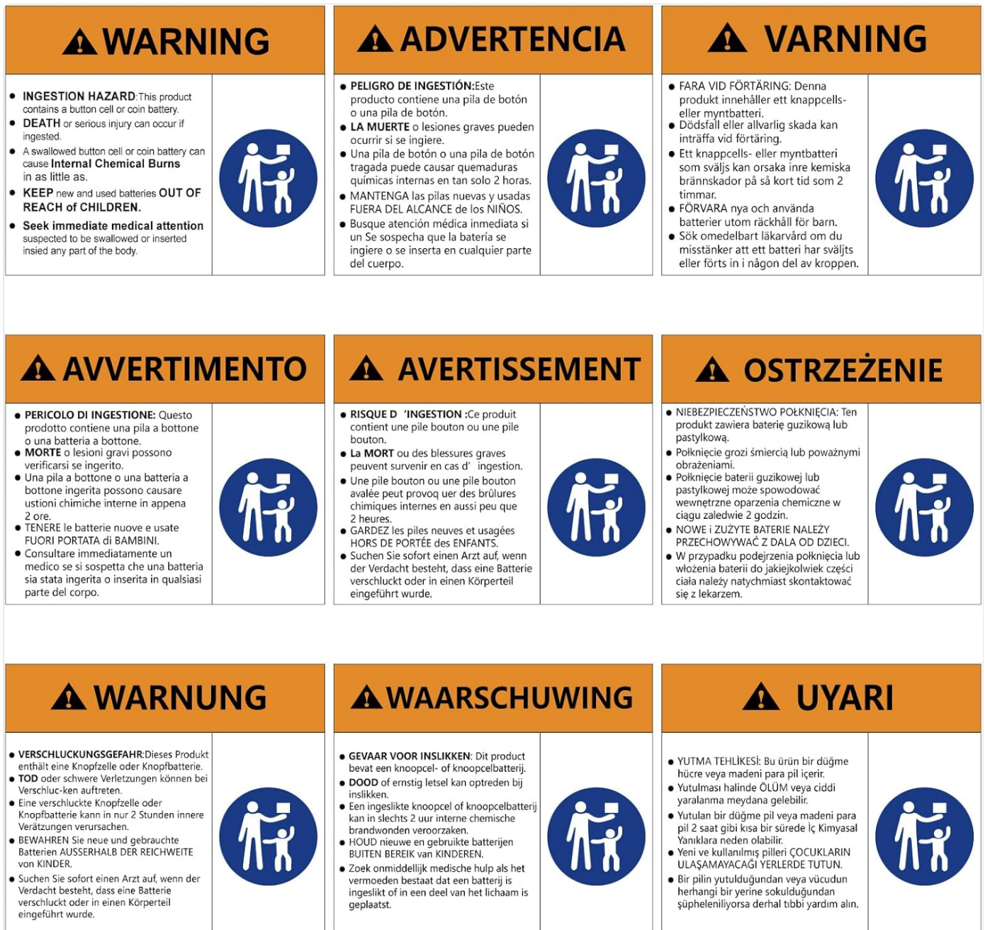
Image: Multi-language warning label regarding the dangers of button cell batteries if swallowed.