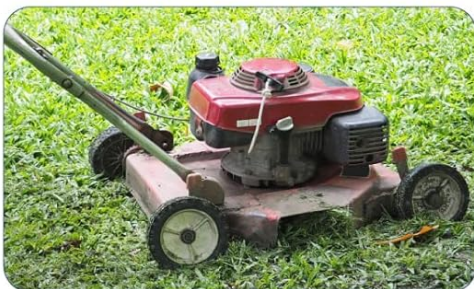
Lawn Mower Edging Machine