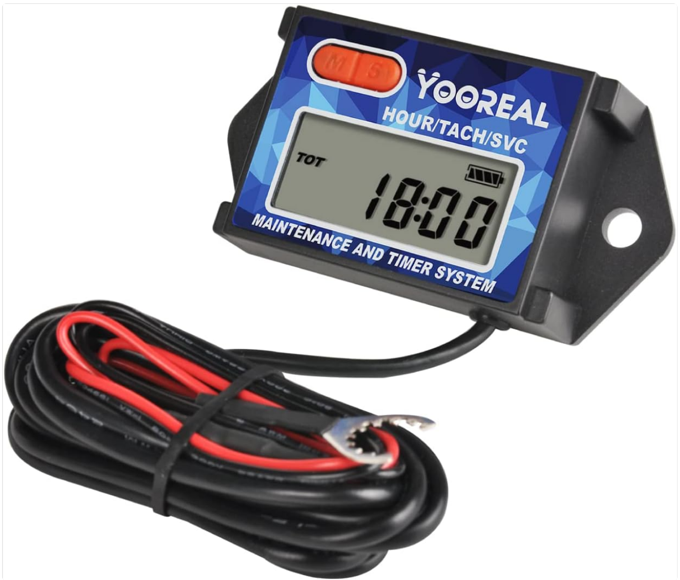
Image: The Yooreal Digital Maintenance Hours Meter, showing its compact design and attached wiring.