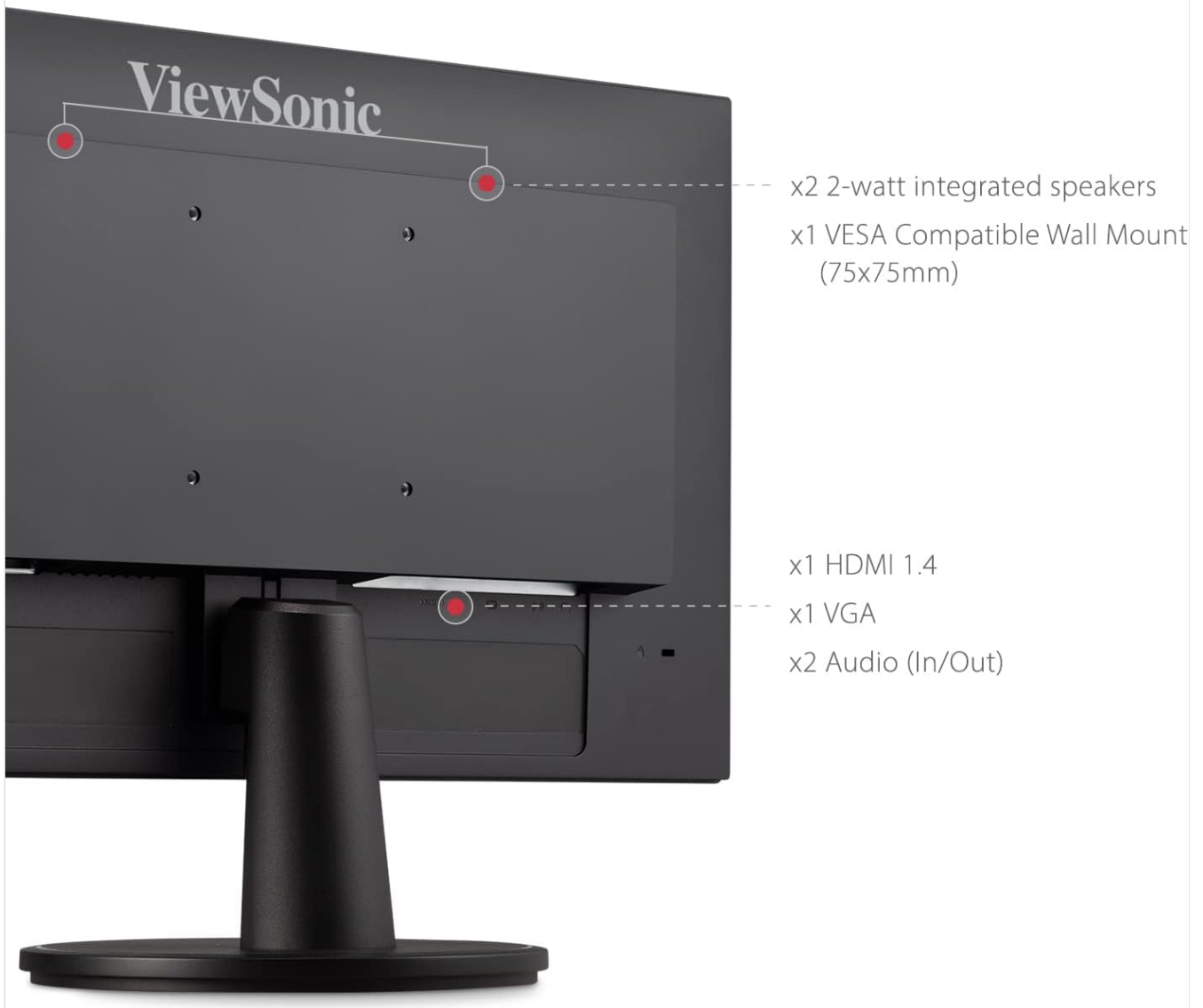
Figure 2: Available input and output ports on the VS2247-MH monitor.

Your browser does not support the video tag.