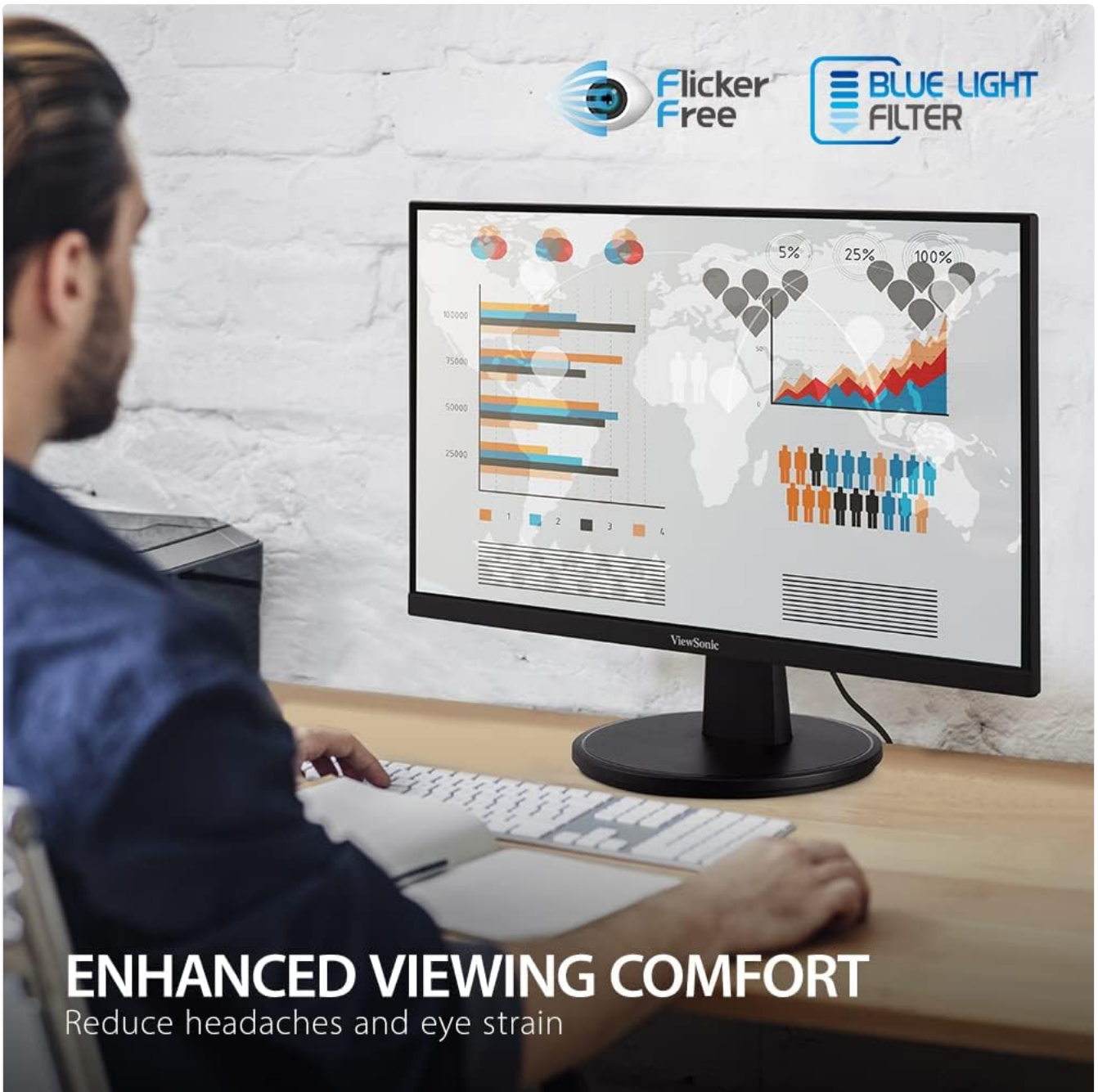
Figure 5: Enhanced Viewing Comfort to reduce headaches and eye strain.