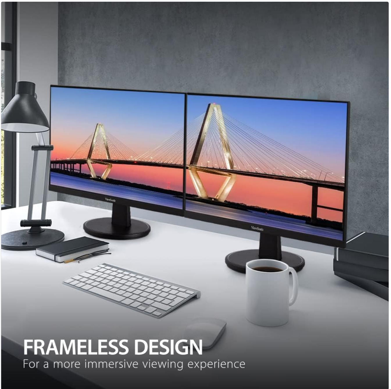
Figure 4: Frameless Design for a more immersive viewing experience.