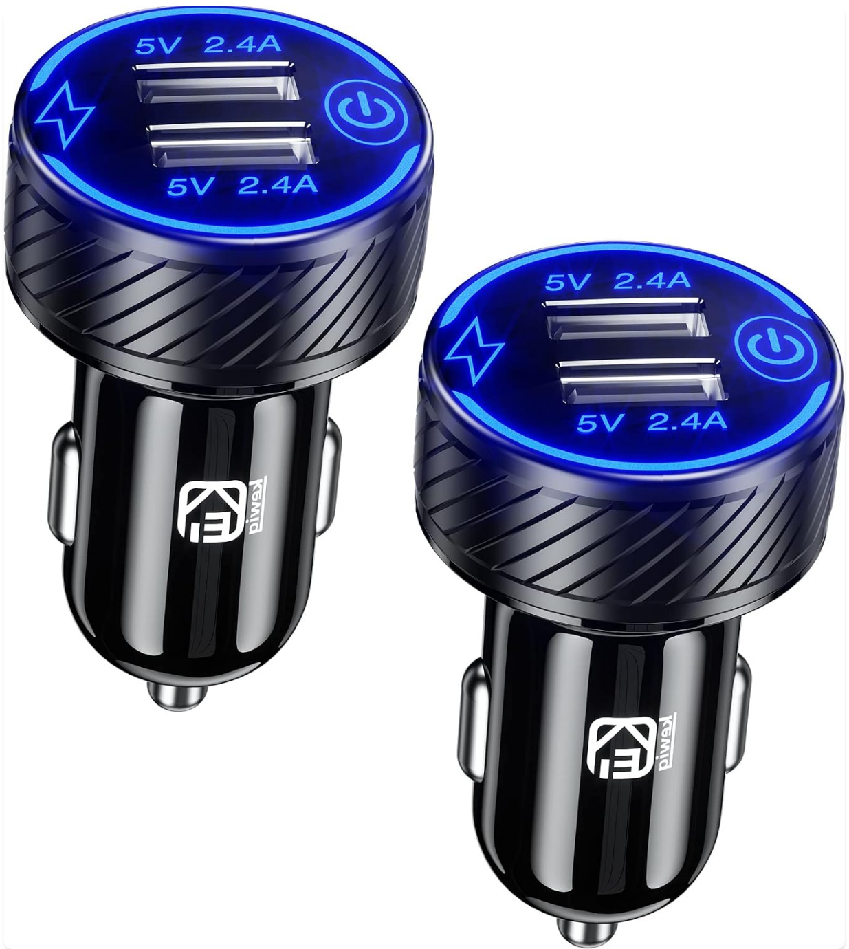
Figure 4.1: Kewig Dual USB Port Car Chargers