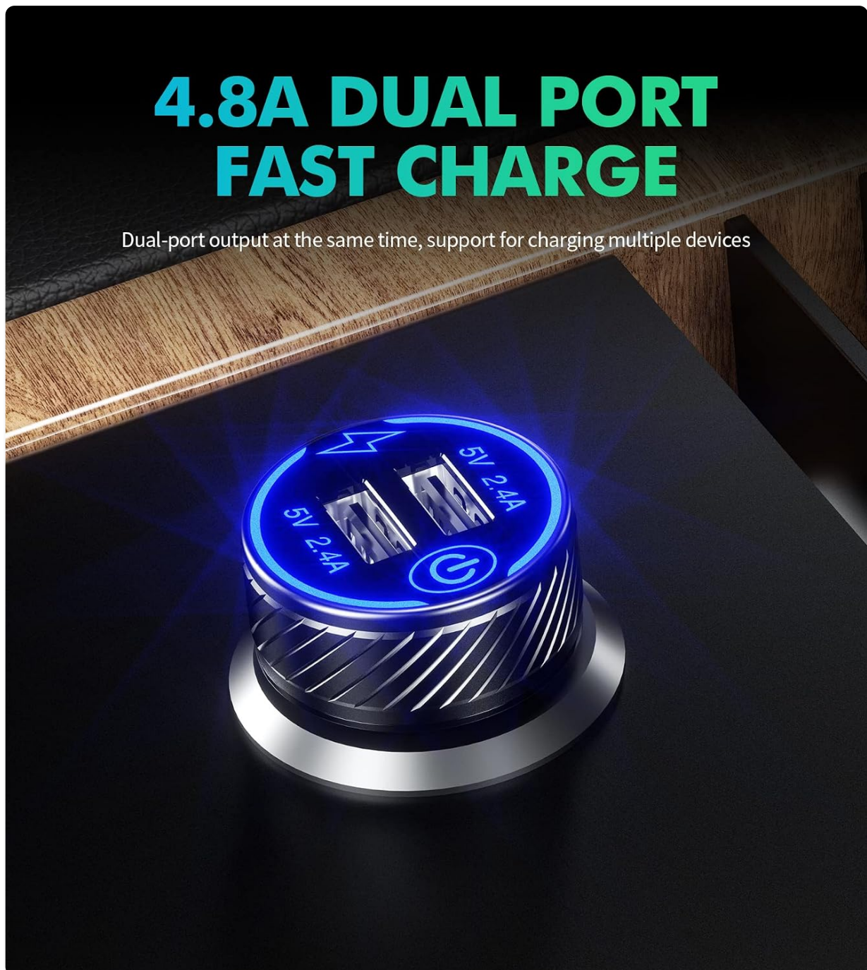
Figure 5.1: Charger Installed in Vehicle Socket