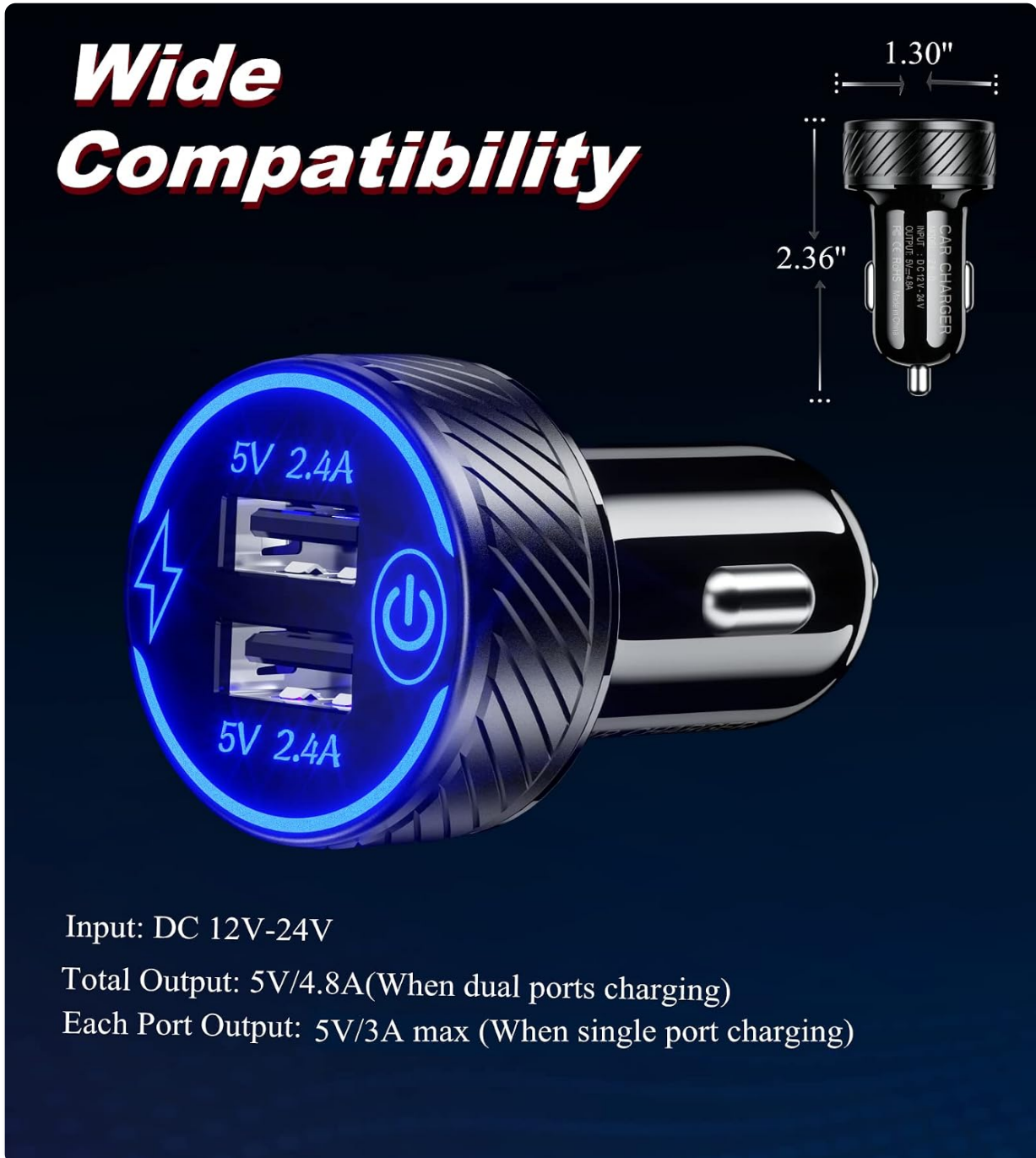
Figure 7.1: Product Dimensions and Electrical Specifications