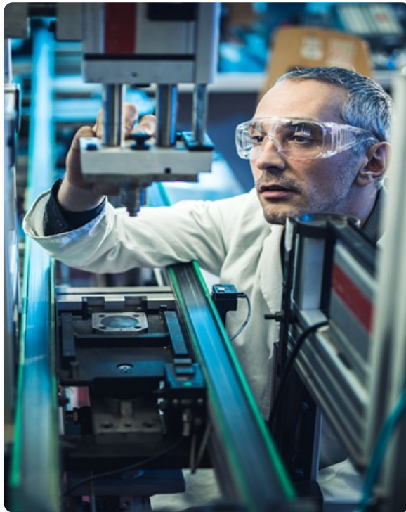
Figure 2.1: Multi-Protection Features