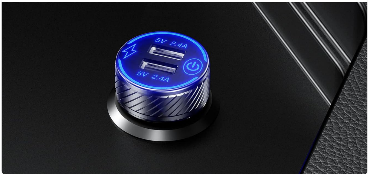
Figure 6.2: LED Lighting and Touch Switch