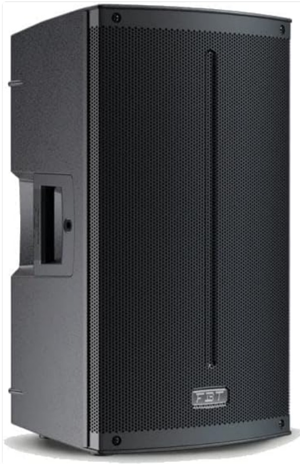
Figure 1.2: Angled view of the FBT X-Lite 112A Professional Active Speaker, highlighting its polypropylene molded enclosure and side handle for portability.