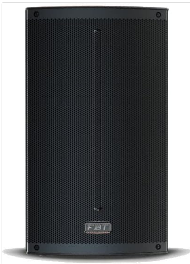
Figure 1.1: Front view of the FBT X-Lite 112A Professional Active Speaker. This image shows the speaker's front grille and the FBT logo at the bottom.

This manual provides comprehensive instructions for the safe and effective operation of your FBT X-Lite 112A Professional 12-inch Active Speaker. The FBT X-Lite 112A is a lightweight, bi-amplified system featuring an integrated 3-channel mixer and Bluetooth 5.0 connectivity, designed for high-fidelity audio reproduction in various applications.