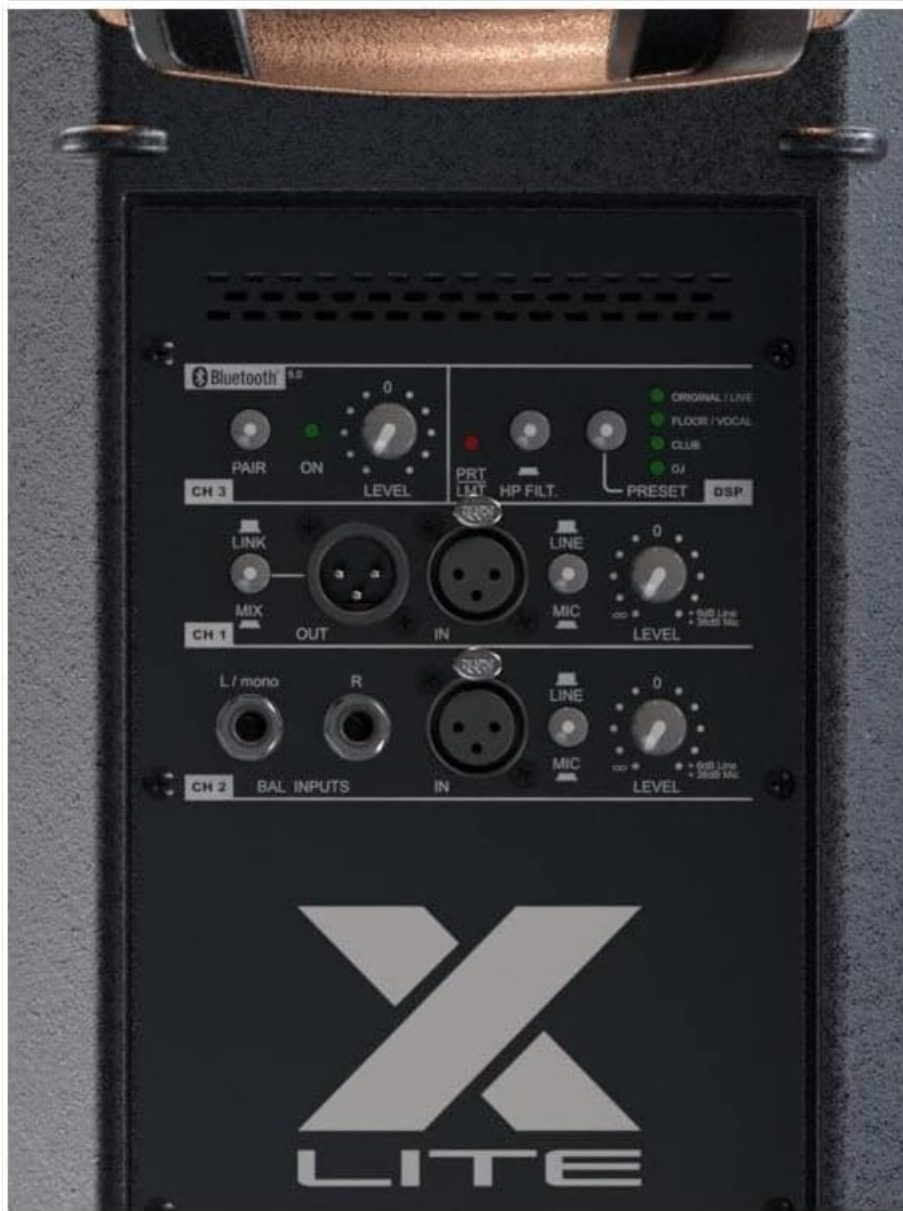
Figure 5.1: Detailed view of the FBT X-Lite 112A control panel, showing inputs, outputs, level controls, DSP presets, and Bluetooth pairing button.