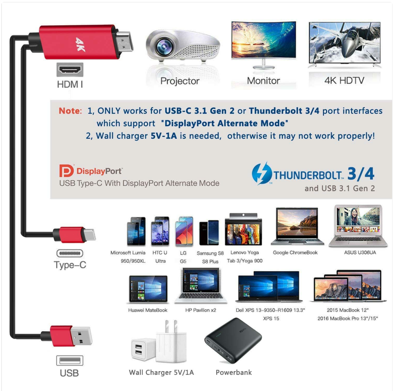
Image: A diagram showing the USB-C to HDMI adapter connected to a projector, monitor, or 4K HDTV, with the USB-A end connected to a wall charger or power bank.