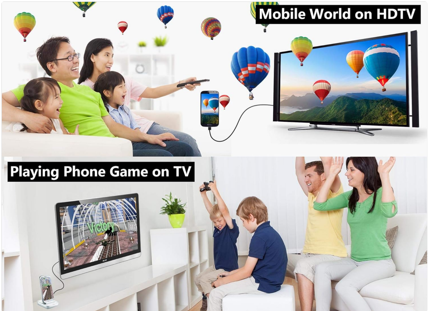
Image: A family enjoying movies and playing mobile games on a large TV screen, connected via the USB-C to HDMI adapter.