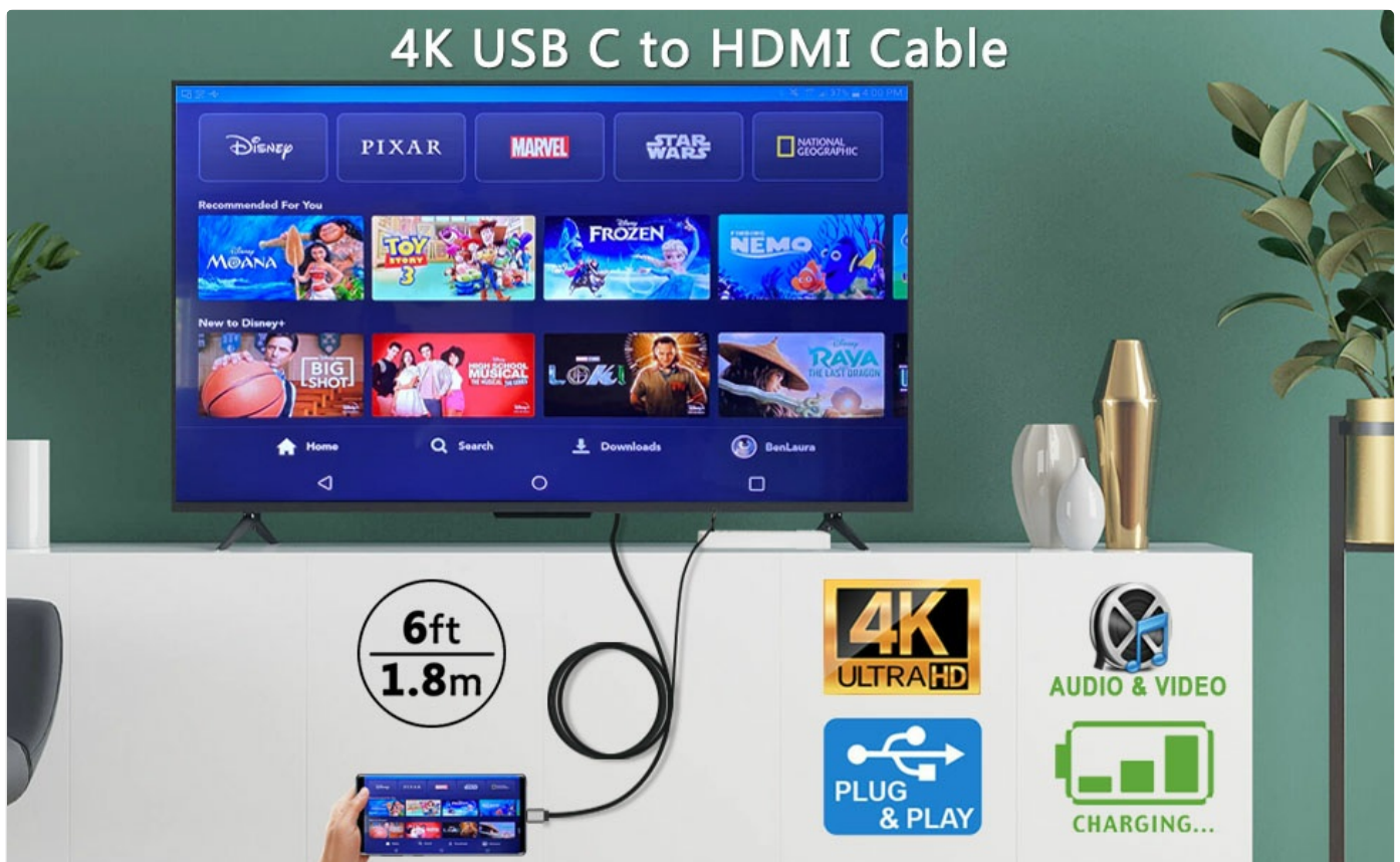
Image: The TASUMATO HK03CM USB-C to HDMI Adapter, showcasing its 4K capability and compact design.