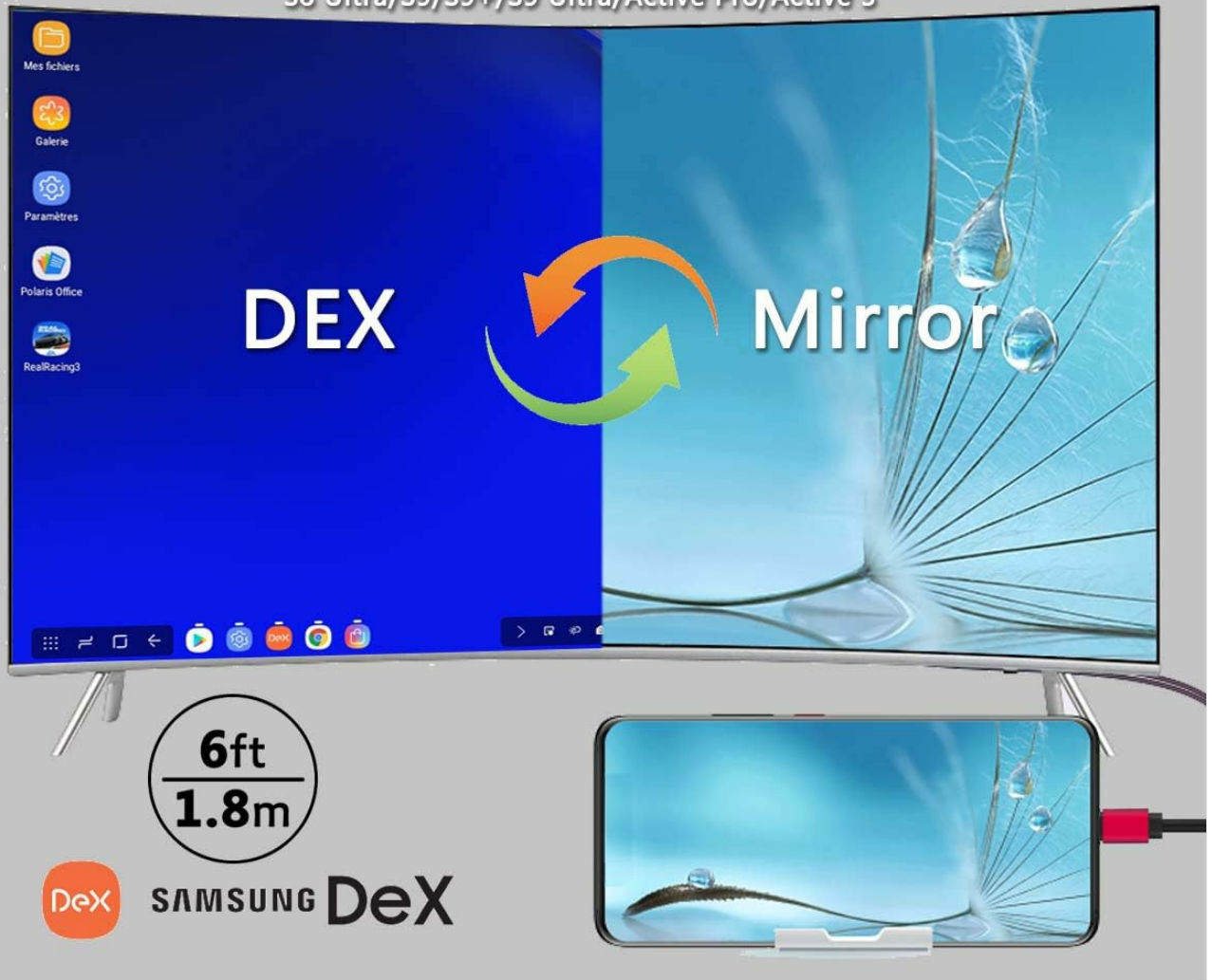
Image: A smartphone displaying the Samsung DeX interface, connected via the USB-C to HDMI adapter to a curved monitor, illustrating both DeX and mirroring modes.

Tablet : Samsung Galaxy Tab Pro S/S4/S5e/S6 (excluding Lite model)/S7/S7+/S8/S8+/S8 Ultra/S9/S9+/S9 Ultra/Active Pro/Active 3