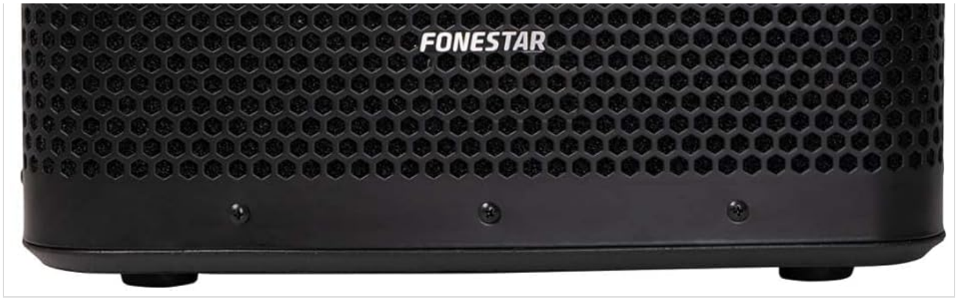
Figure 1: Front view of the FONESTAR FORCE-12DSP Active Speaker. The speaker features a durable black hexagonal mesh grille covering the entire front surface, protecting the internal components. The 'FONESTAR' brand logo is prominently displayed in white text at the bottom center of the grille. The speaker has a rectangular shape with slightly rounded corners, indicating a sturdy build for professional use.