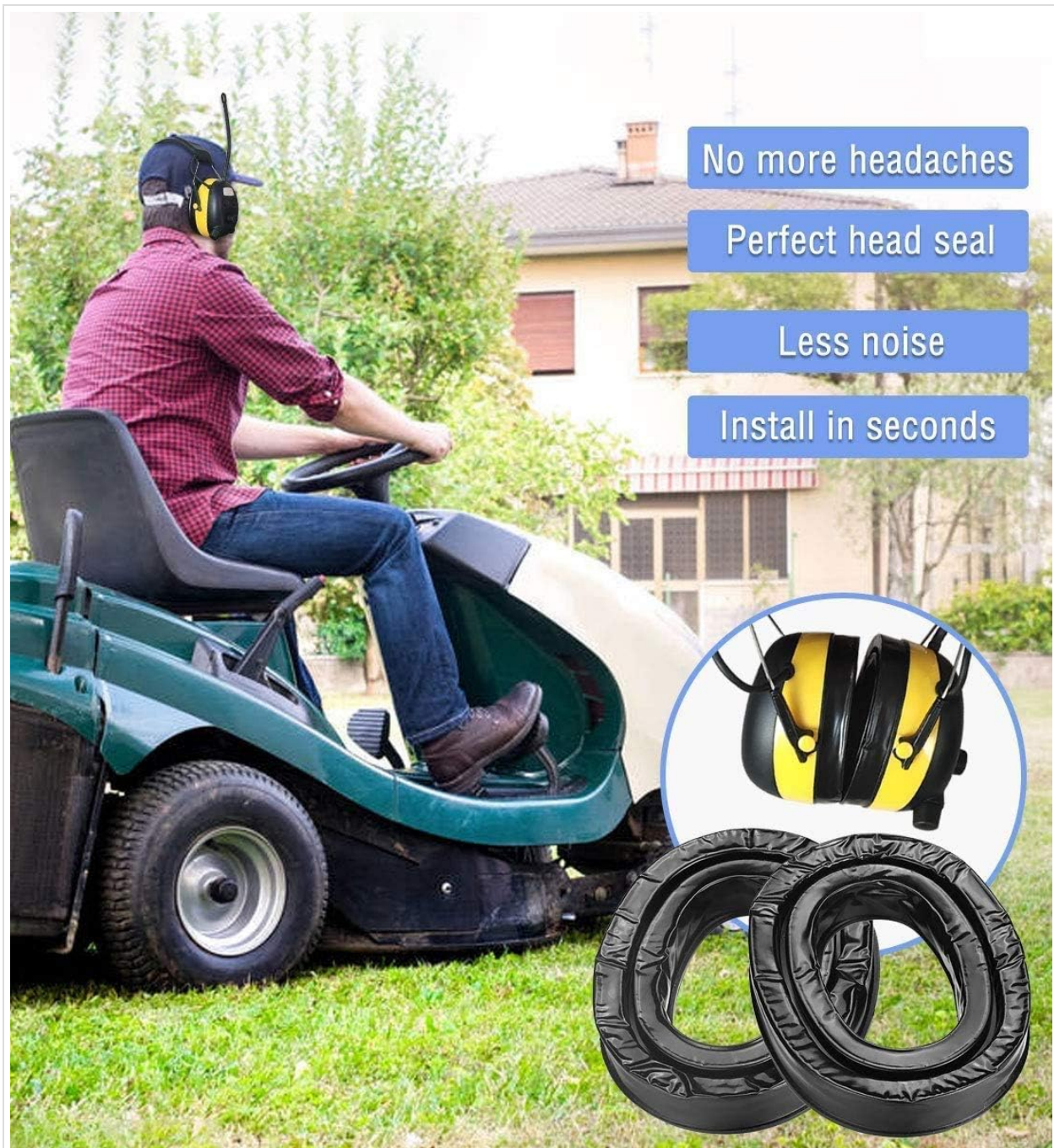
Image 4.2: GEP01 Gel Ear Pads provide a perfect head seal and reduce noise.