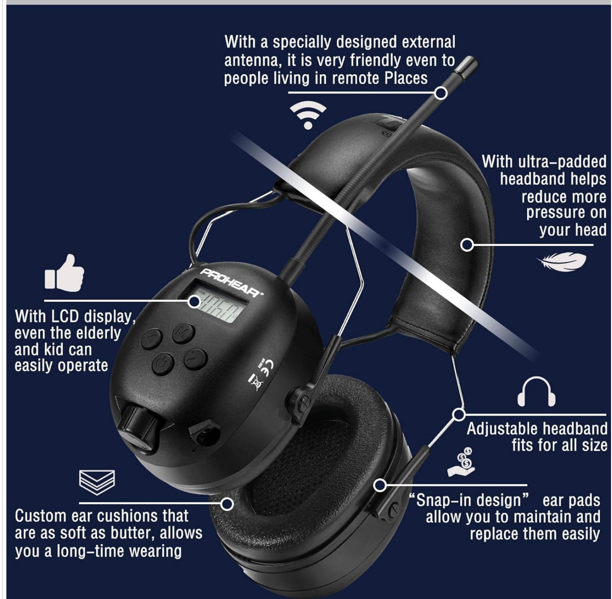
Image 6.1: All-day comfort features of the PROHEAR 033 headphones.