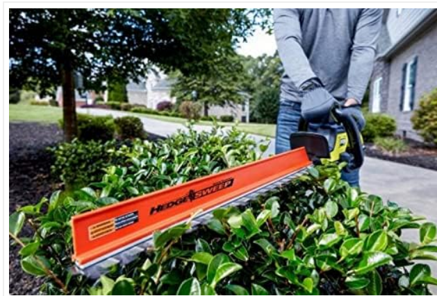
Image: A person demonstrating the use of the RYOBI 40V HP Brushless 26-inch Cordless Hedge Trimmer to trim the top of a green bush. This shows the trimmer in action, highlighting its ergonomic design and cutting capability.