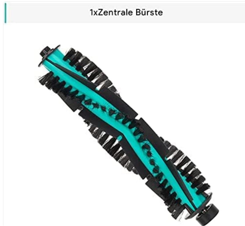
Image: Deenkee D40 Main Brush.