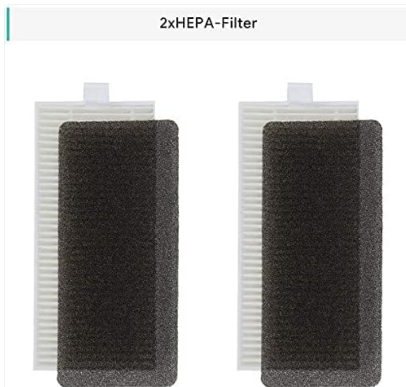
Image: Deenkee D40 HEPA Filters.