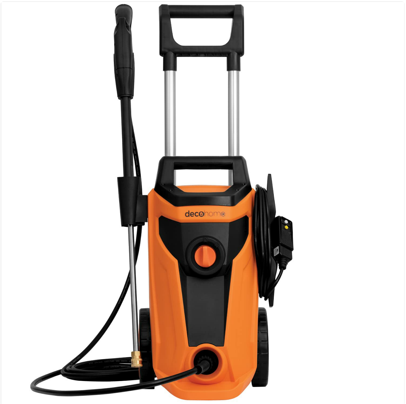
Image: The Deco Home 1800W Electric Pressure Washer, highlighting its high pressure capability and ease of use.