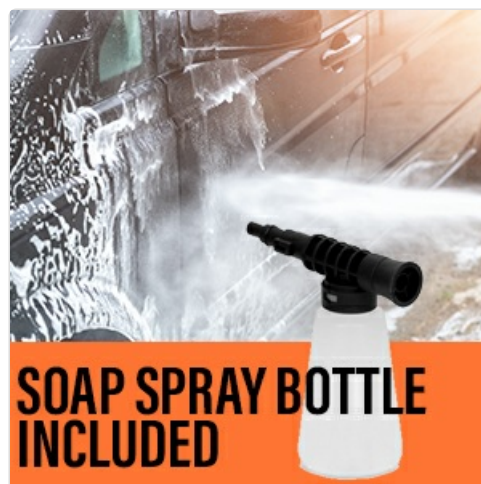
Image: Soap spray bottle attachment for applying detergent during cleaning.