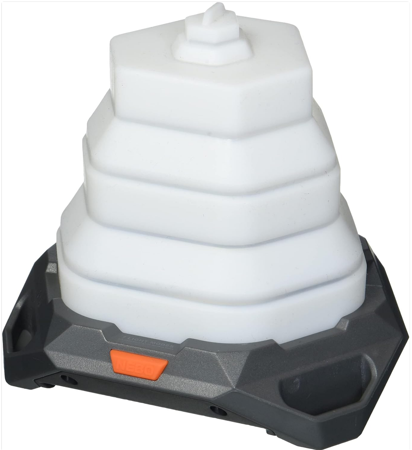
Figure 1: The NEBO Galileo Air 1000 lantern in its collapsed, compact form.