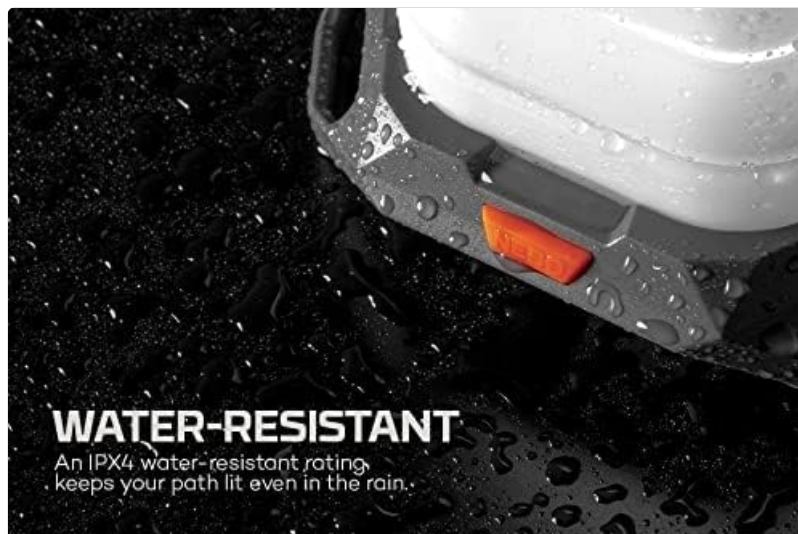
Figure 4: The lantern's water-resistant design, suitable for outdoor conditions.