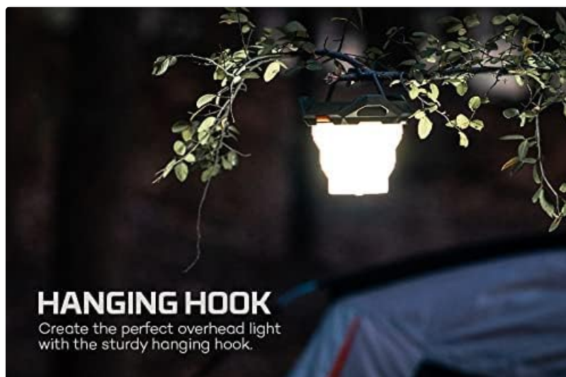
Figure 3: The lantern demonstrating its hanging capability, providing overhead light.

The lantern features a sturdy integrated hanging hook on its base, allowing it to be suspended for overhead illumination. It can also be placed on any flat surface for stable, ambient lighting. The base also includes attachment points for tethering or securing the lantern.