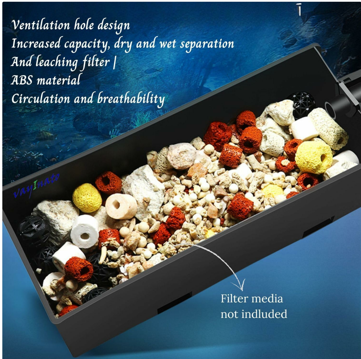
Image: The internal compartment of the SOBO WP-880F filter box, designed for various filter media (media shown are for illustration and not included). Note the ventilation hole design for improved circulation.

3. Filter Box Cleaning: Rinse the filter box with aquarium water to remove any accumulated sludge.