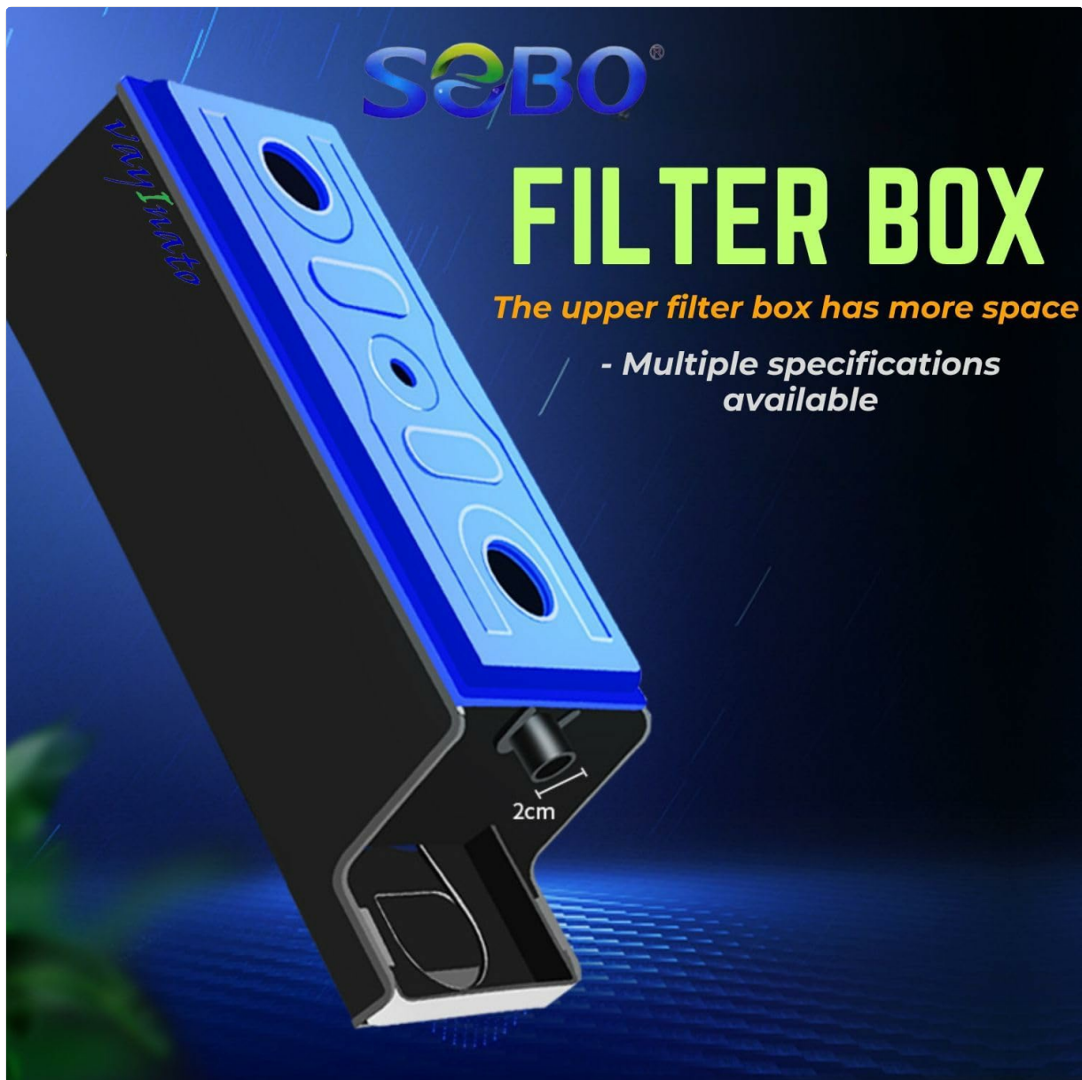
Image: A detailed view of the SOBO WP-880F filter box, highlighting its internal structure and potential for holding filter media.