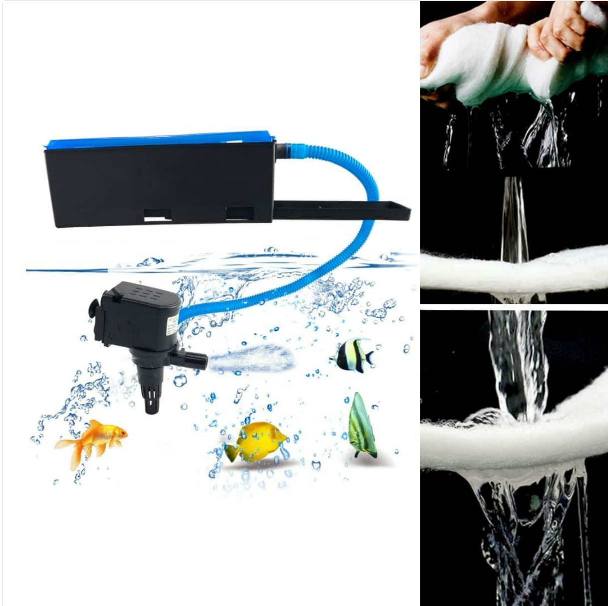
Image: Exploded view of the SOBO WP-880F Top Filter, showing the main pump unit, the filter box, and the included sponge filter media.