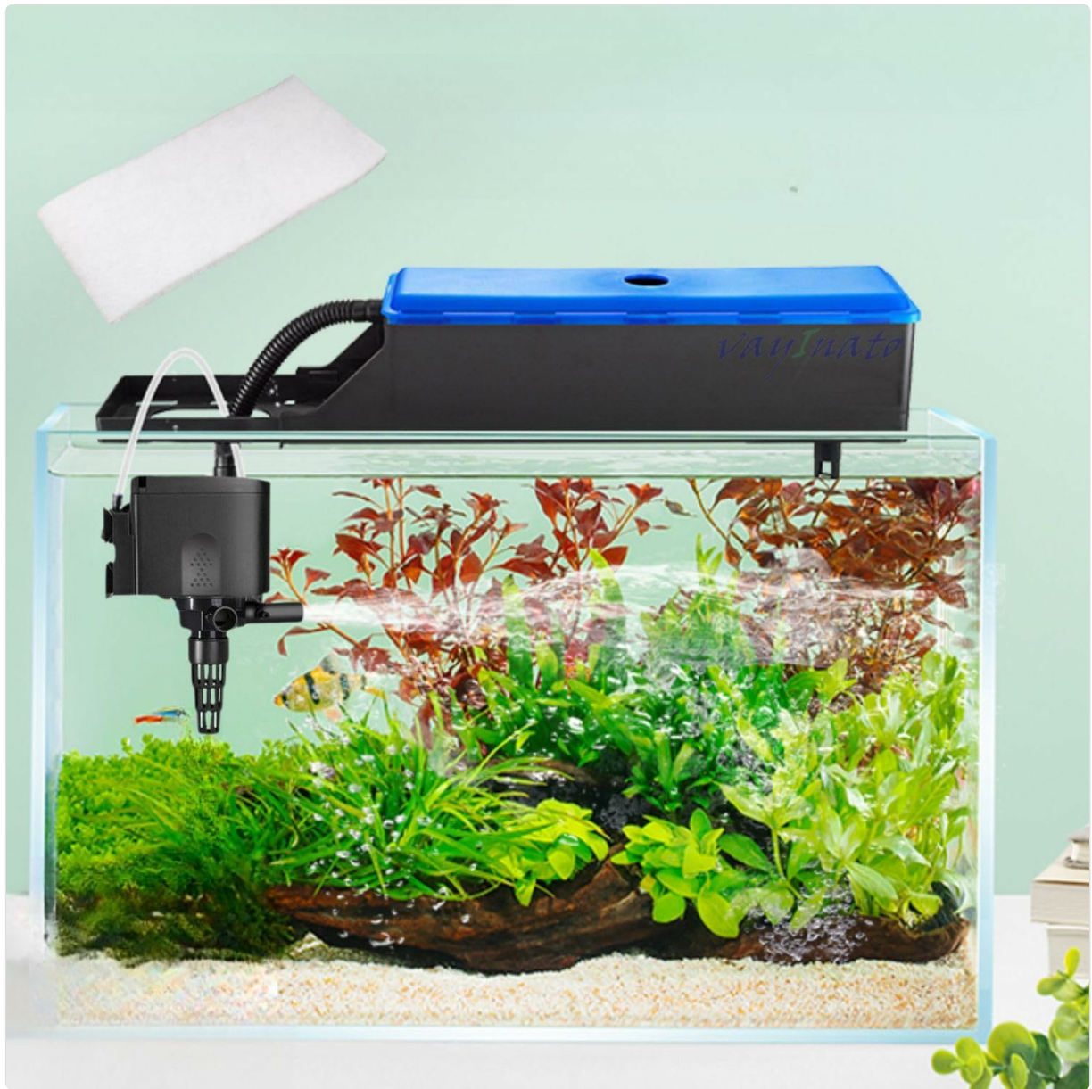
Image: The SOBO WP-880F Top Filter system, illustrating its three primary functions: filtration, water circulation, and oxygen supply for an aquarium.