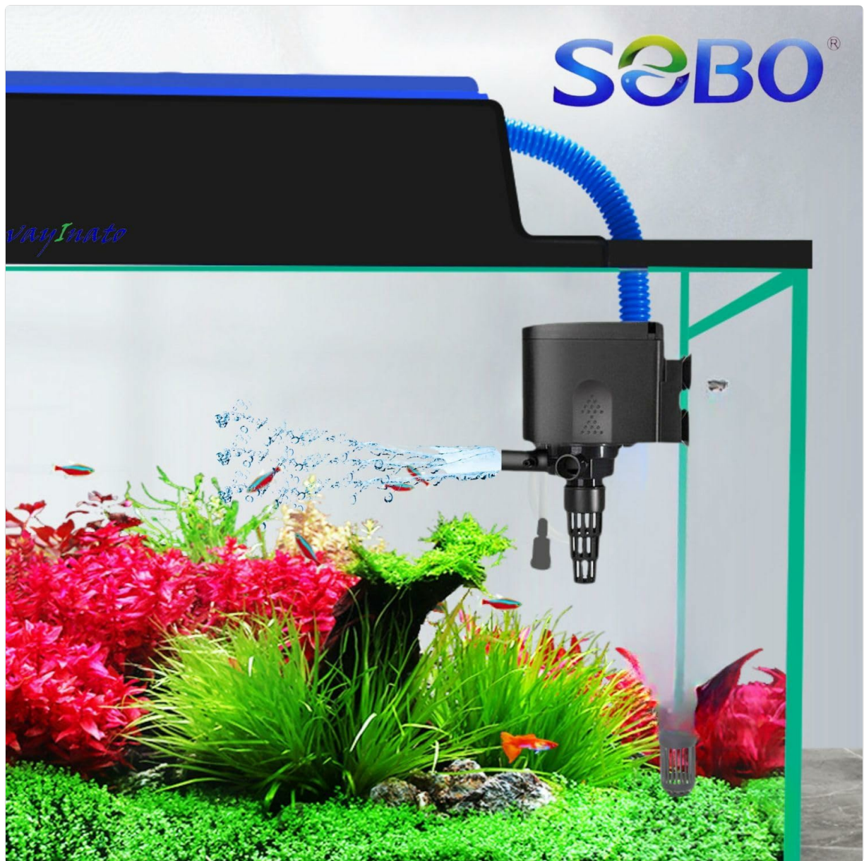
Image: The SOBO WP-880F Top Filter correctly installed on an aquarium, demonstrating the submersible pump and the top-mounted filter box.