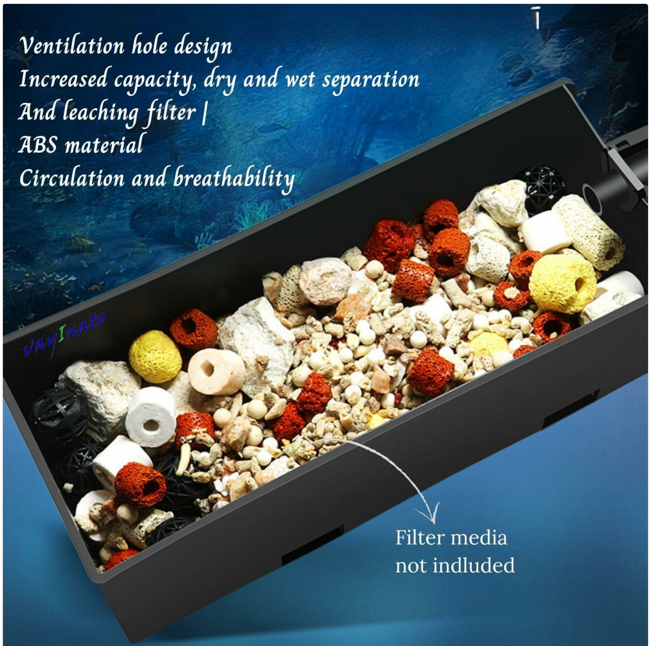
Image: The internal compartment of the filter box, designed to hold various filter media. Note that filter media is not included.