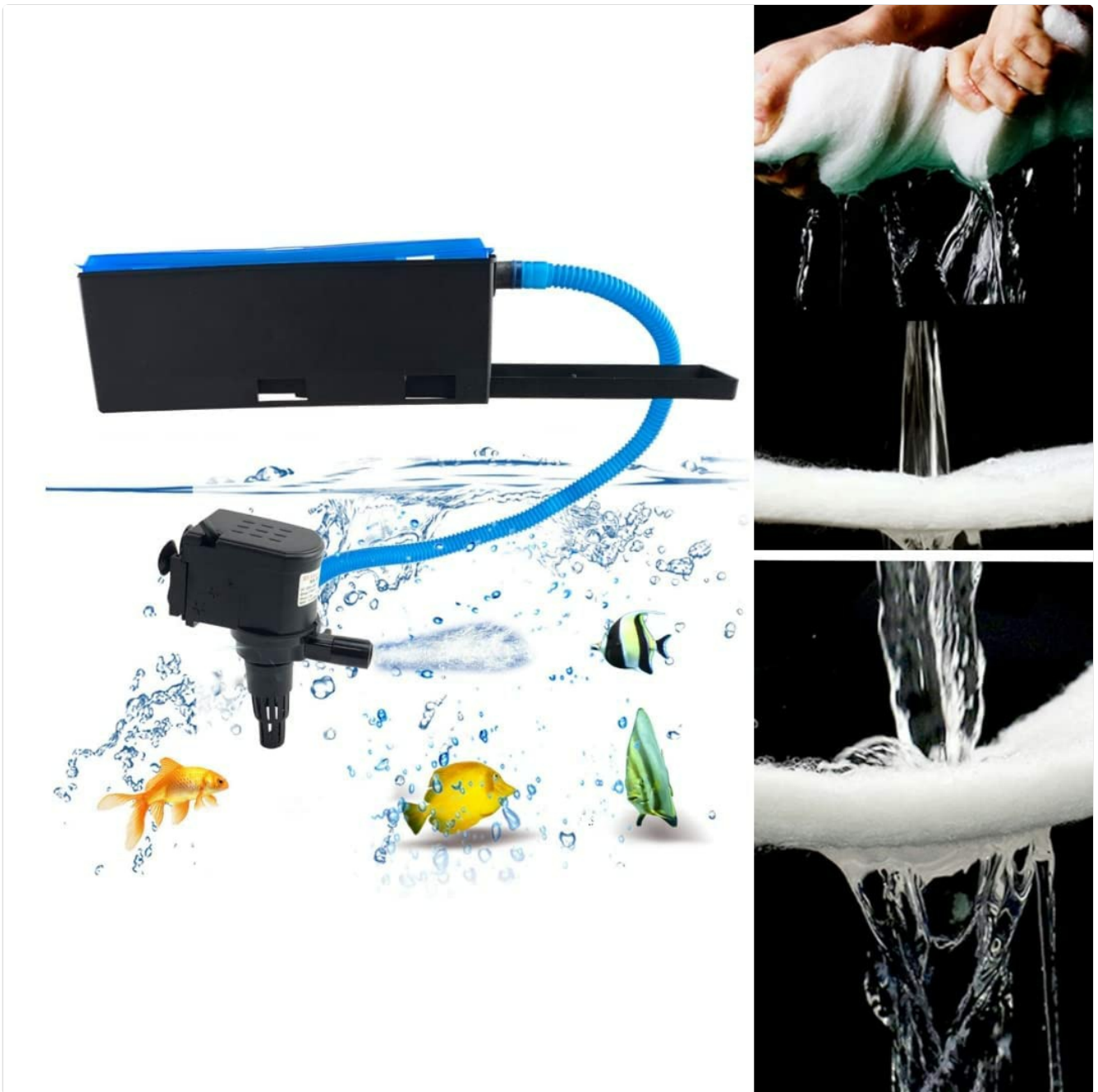
Image: Demonstrates the process of cleaning the filter sponge by rinsing it under water.