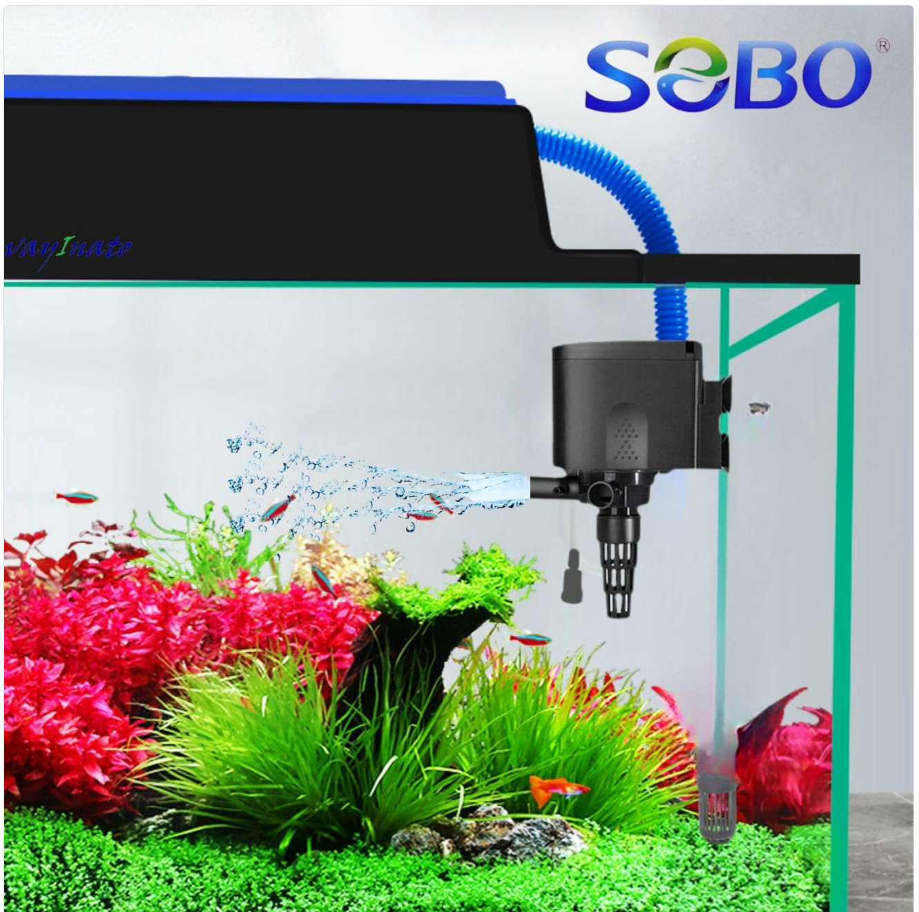
Image: The filter pump is shown correctly submerged in the aquarium water, connected to the top filter box which rests on the tank rim.