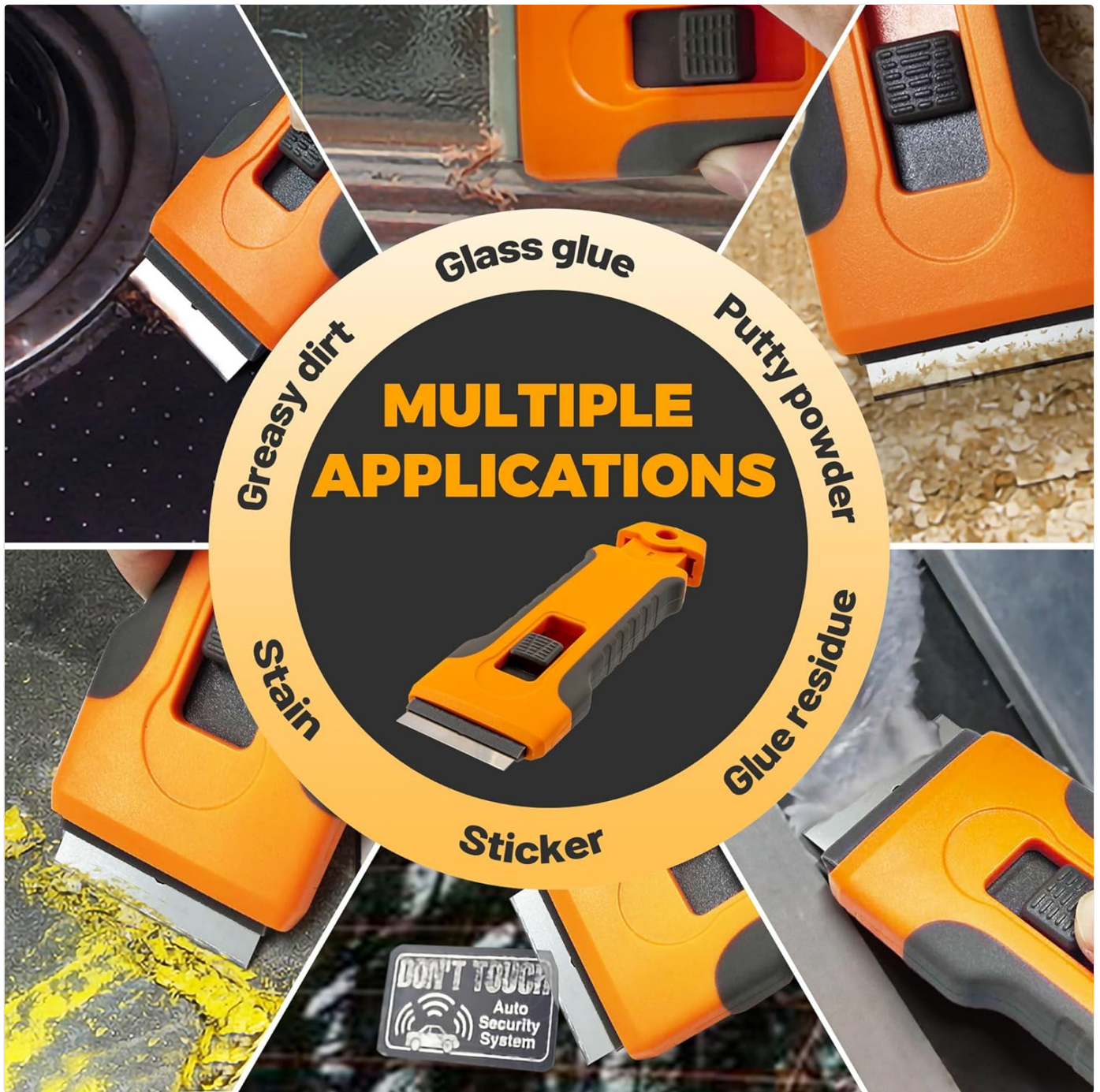
Image: A visual representation of the scraper's versatility, demonstrating its use for removing glass glue, putty powder, glue residue, stickers, stains, and greasy dirt.