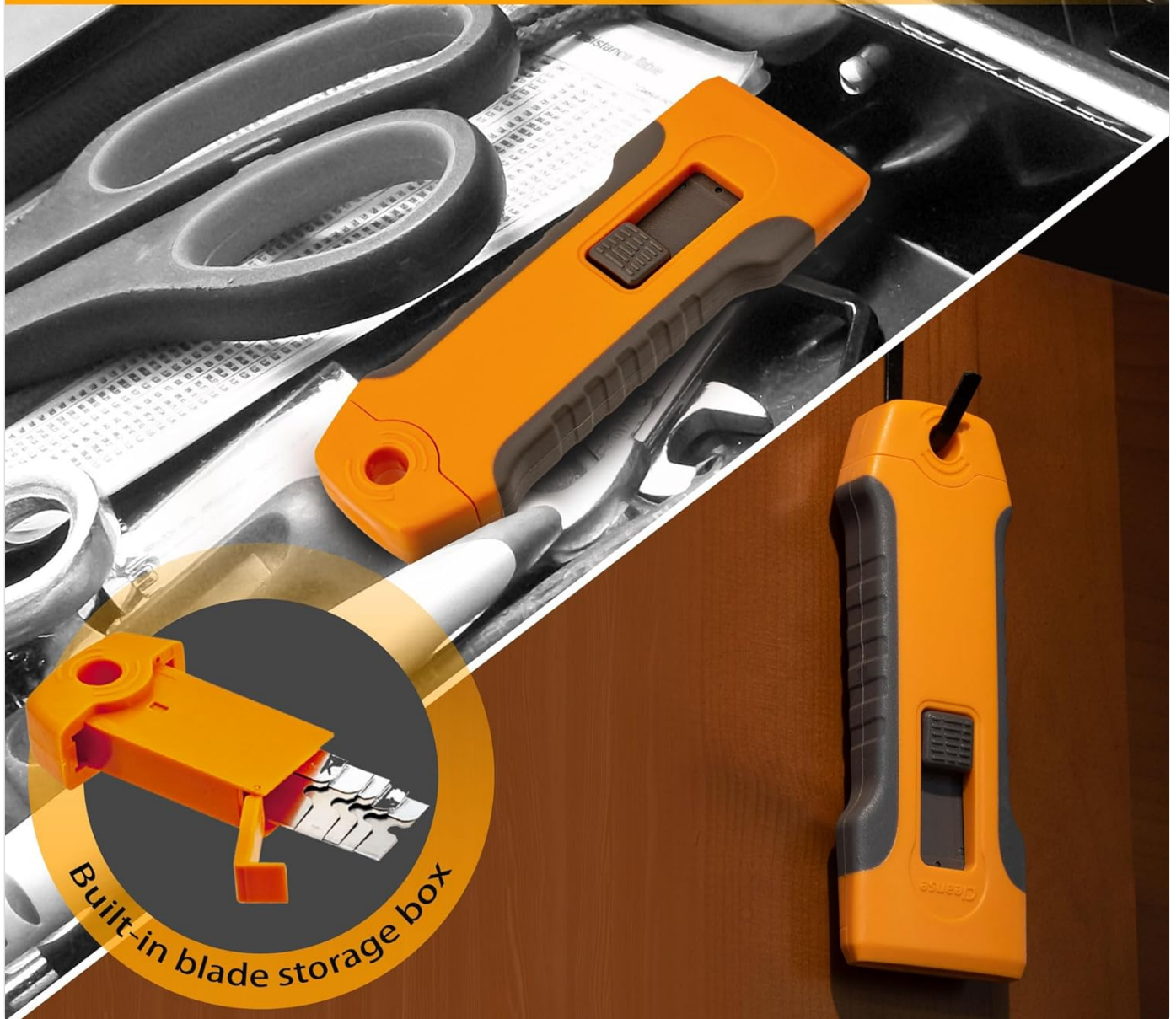
Image: The scraper tool neatly stored in a drawer, with an inset showing the built-in compartment for spare blades.