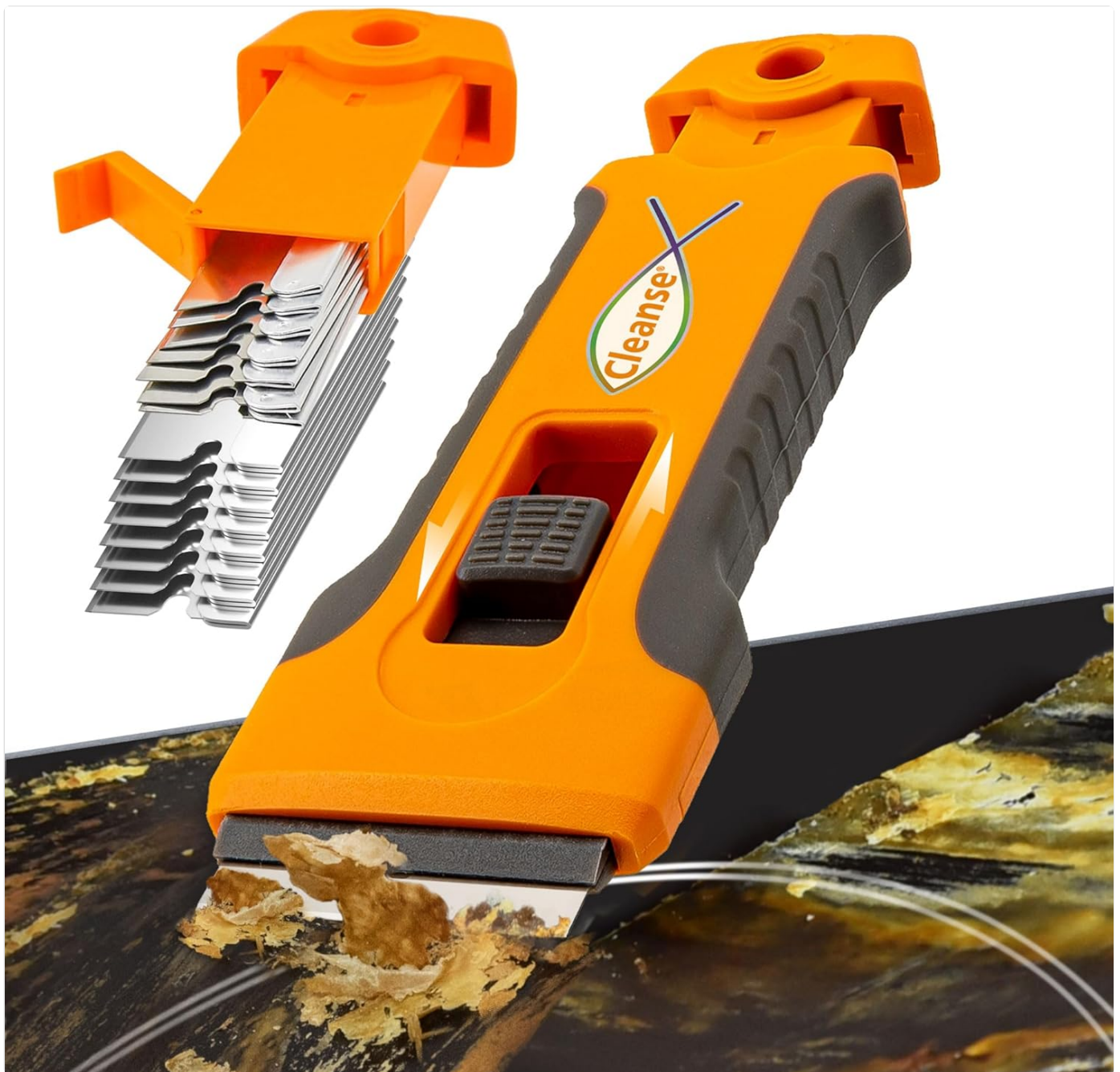
Image: The Cleanse Razor Blade Scraper Tool, showing its ergonomic design and a separate container for extra blades.