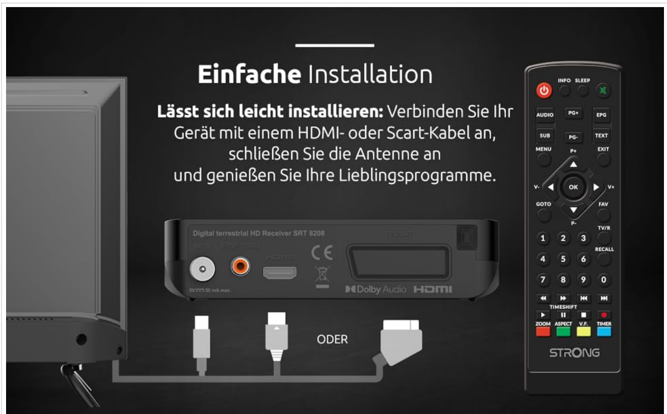
An illustrative diagram demonstrating how to connect the STRONG SRT8208 receiver to a television using either an HDMI or SCART cable, and connecting the antenna.