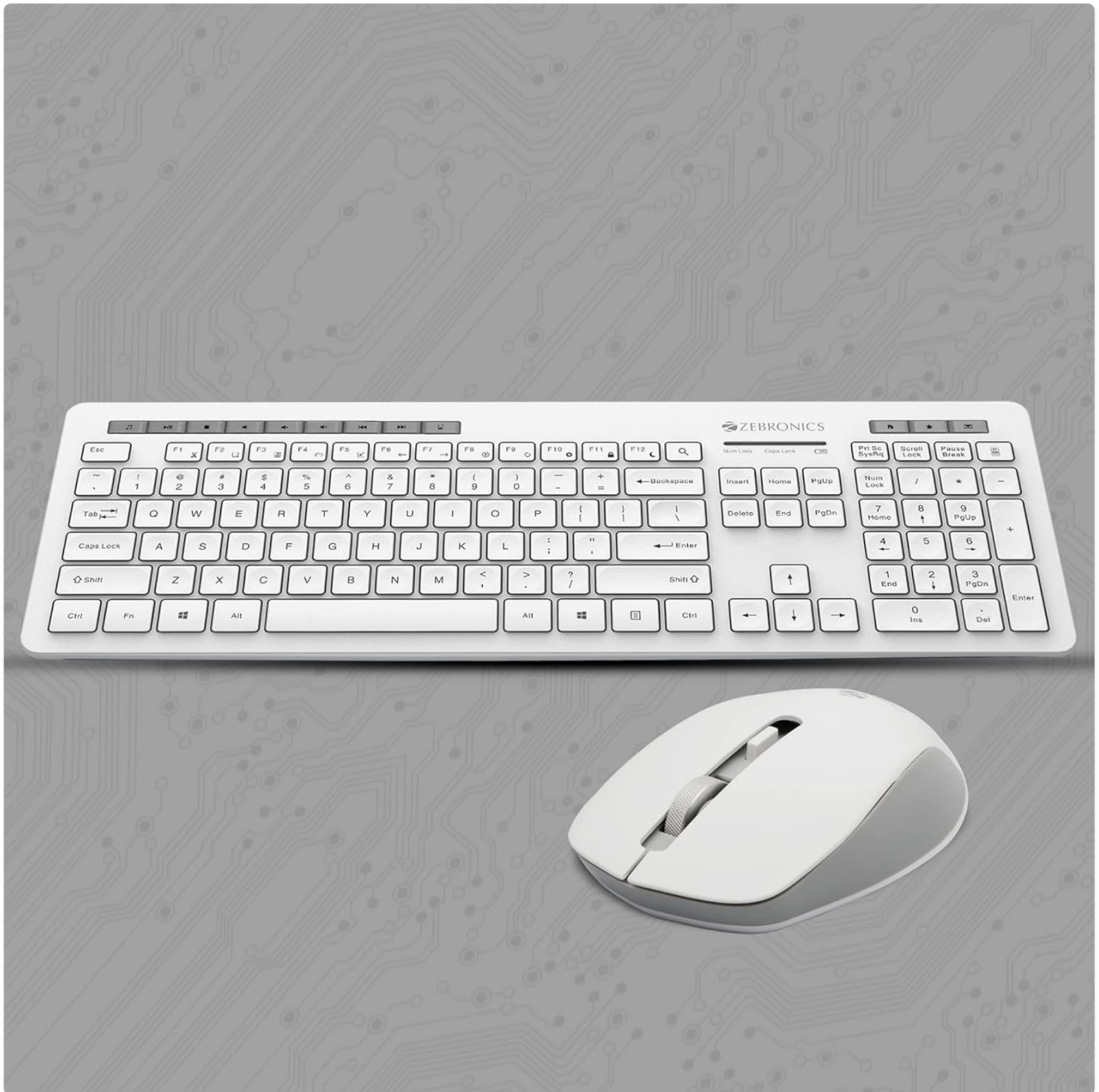
Image: Close-up of the keyboard highlighting chiclet keys.