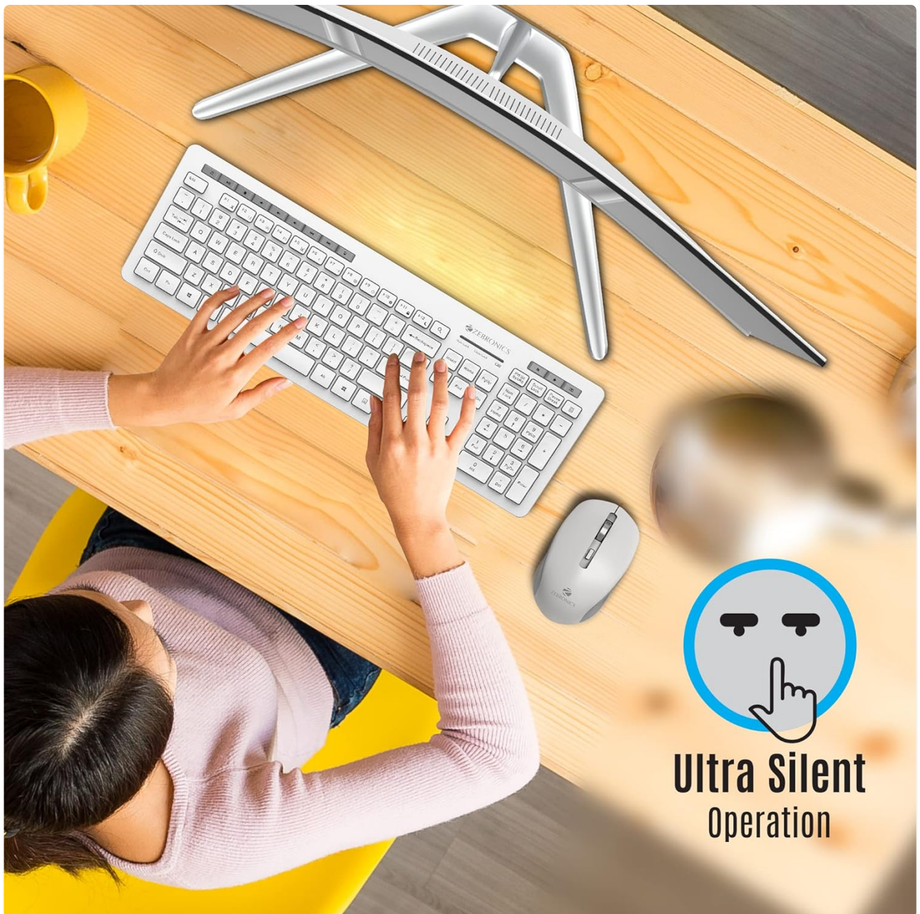
Image: Ultra-silent operation for a quiet workspace.