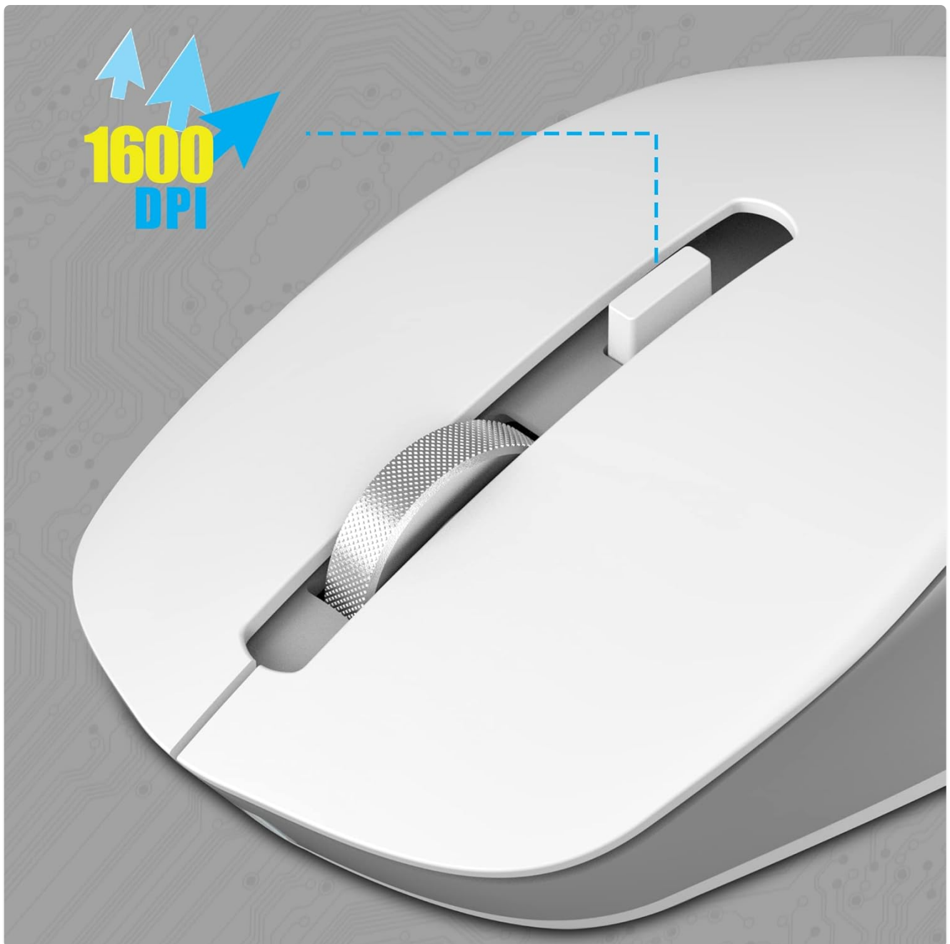
Image: Mouse DPI settings.