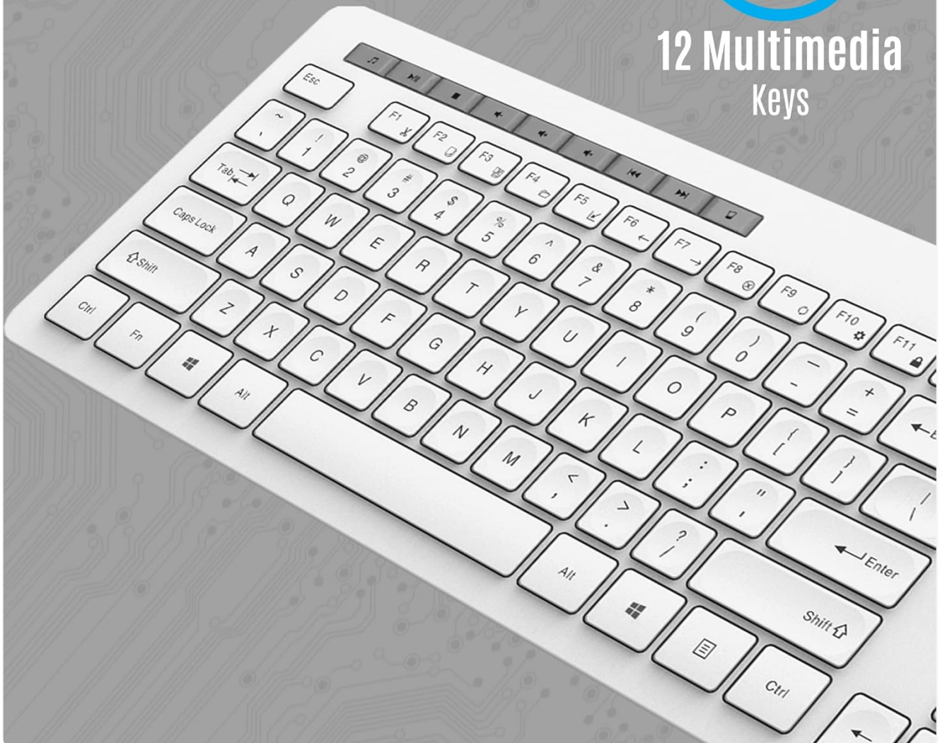
Image: Keyboard multimedia keys.