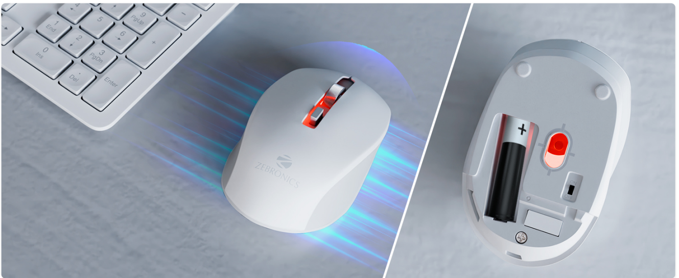
Image: The USB Nano Receiver.