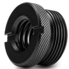
3/8" - 5/8" Thread Adaptor

Image: The PSA1+ base providing superior isolation from vibrations.