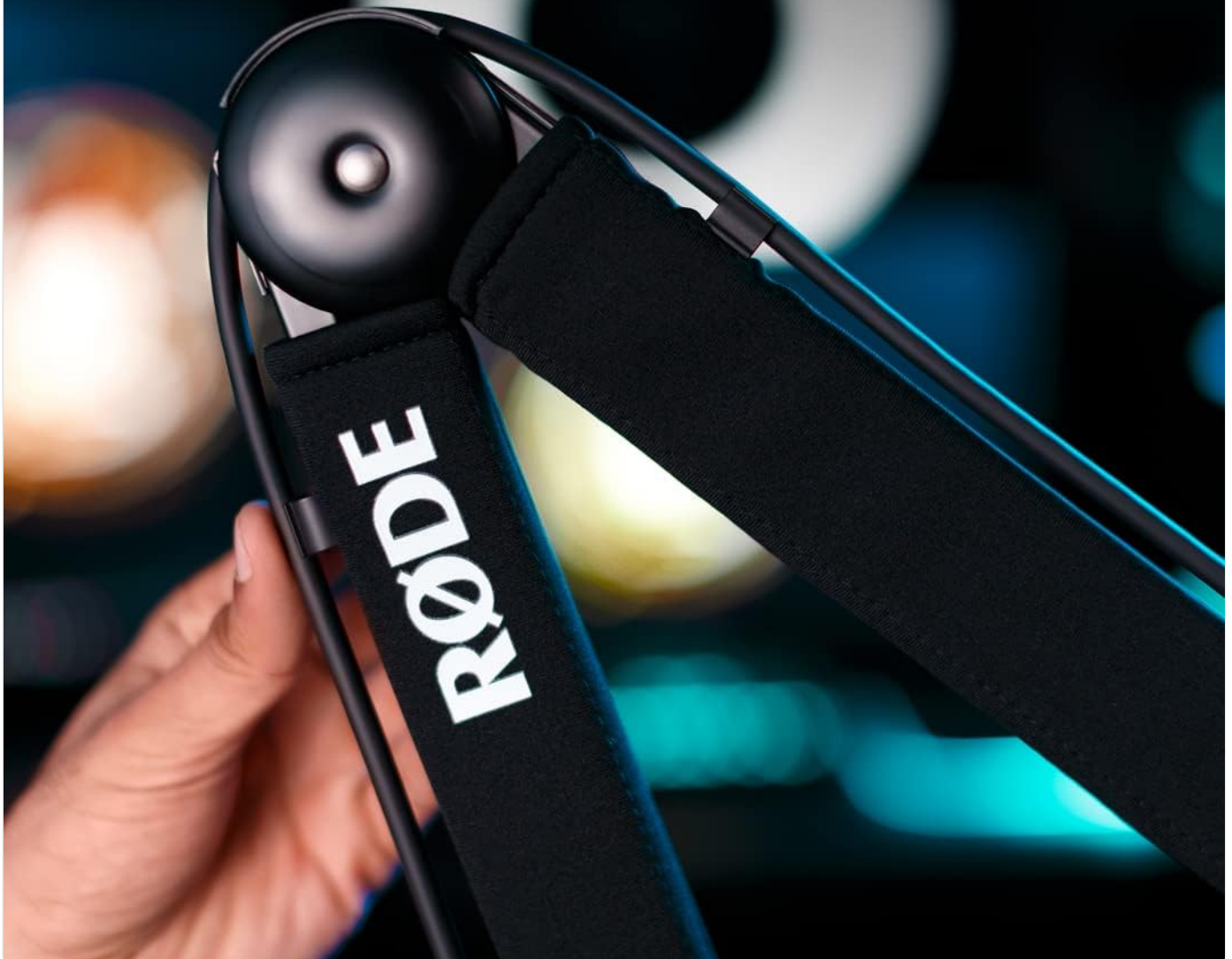
Image: Detail of the smooth and silent movement mechanism.