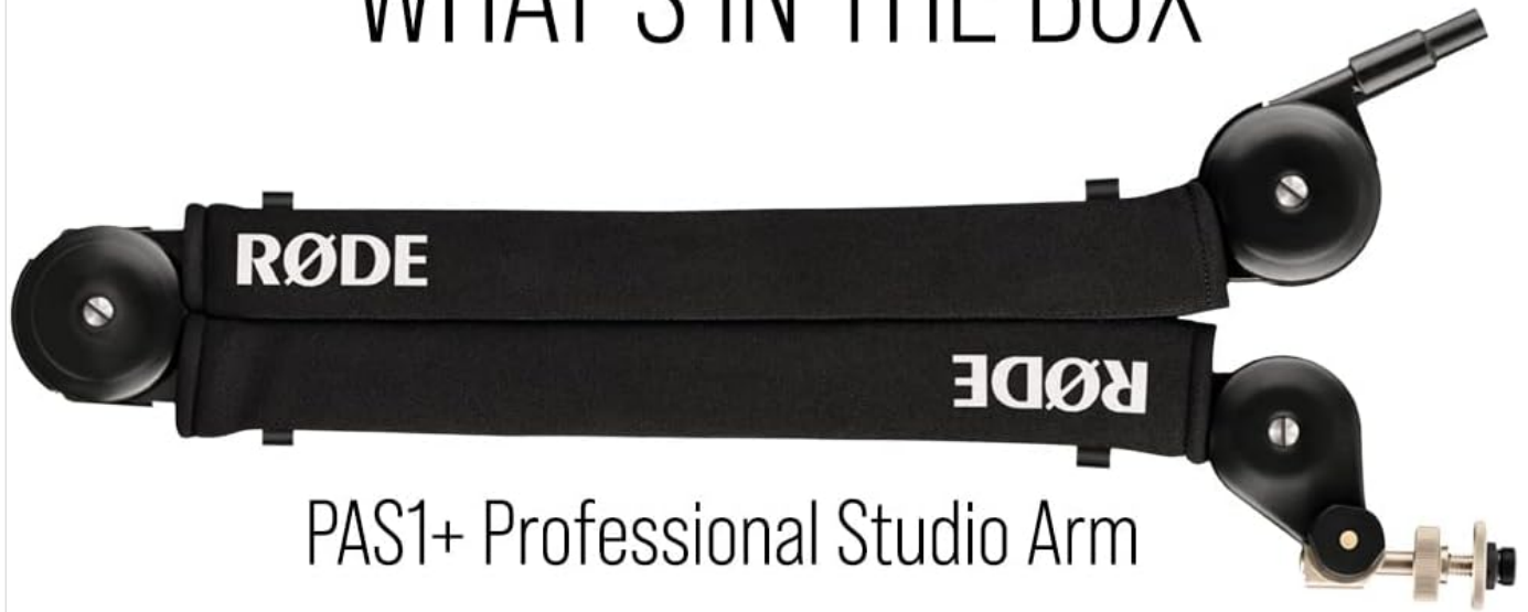
PAS1+ Professional Studio Arm