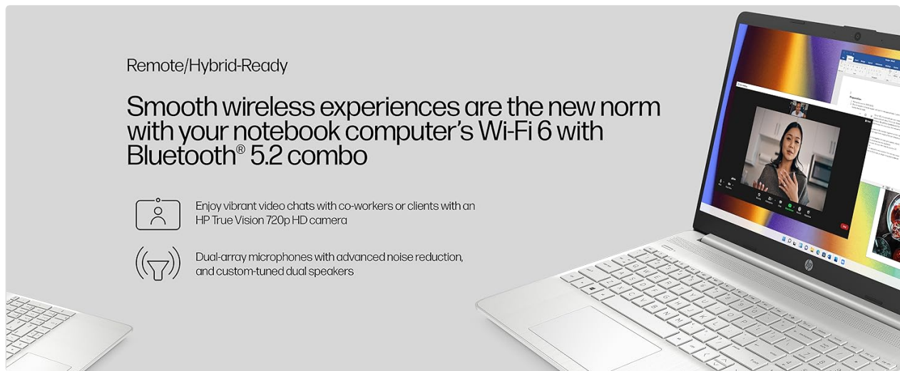
Image: HP Connection Optimizer ensures stable Wi-Fi performance.

The HP Connection Optimizer software ensures consistent and reliable Wi-Fi performance by automatically switching between the most efficient wireless access points.