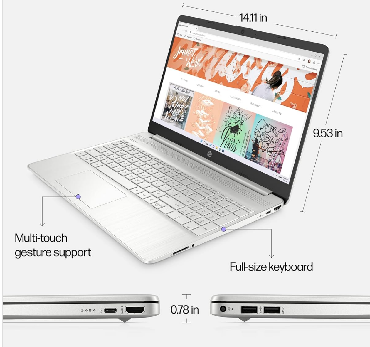
Image: The full-size keyboard and HP Imagepad with multi-touch gesture support.

Revolutionize your display and see more of what you love with this slim bezel design.