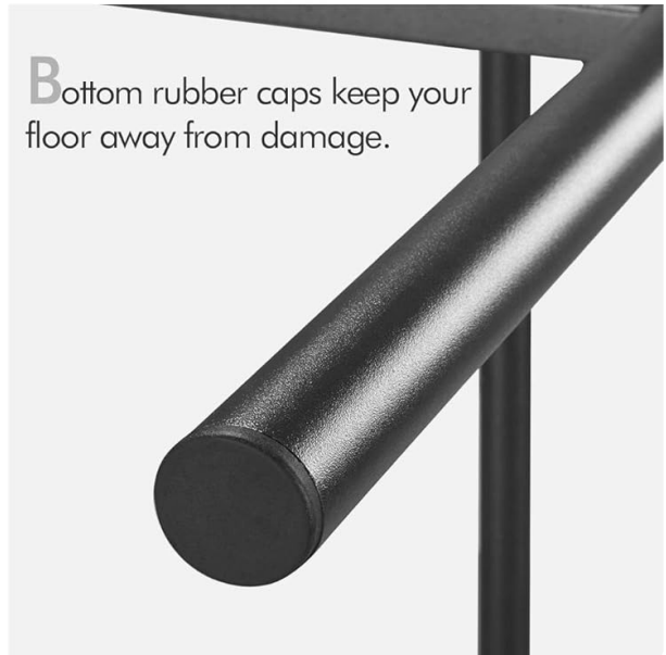
Image: Features including protective foot pads.

Bottom rubber caps keep your floor away from damage.