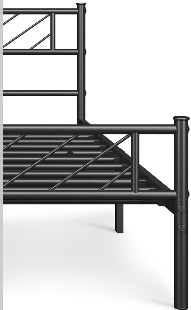
Image: Aligning a metal pipe into a notch during assembly.