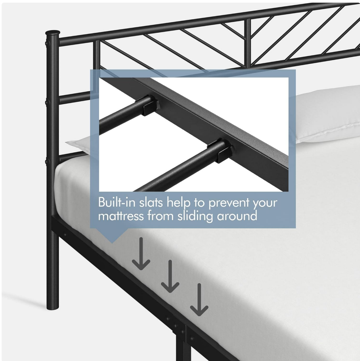
Image: Securing slats into the bed frame.