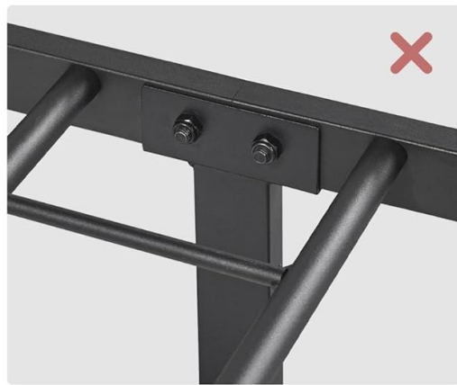
Image: Built-in slats securing the mattress.