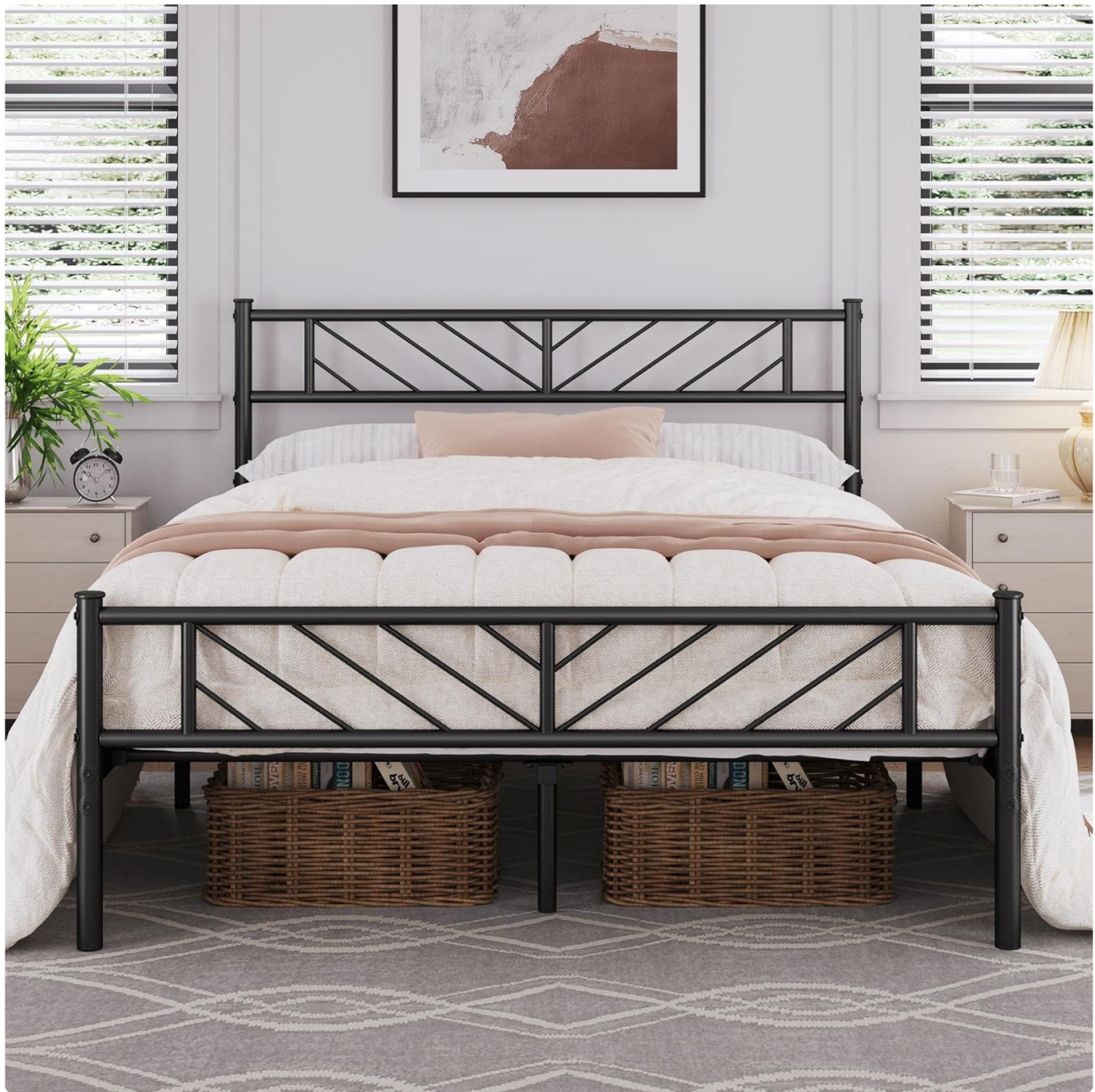
Image: Assembled Yaheetech Queen Size Platform Bed Frame.