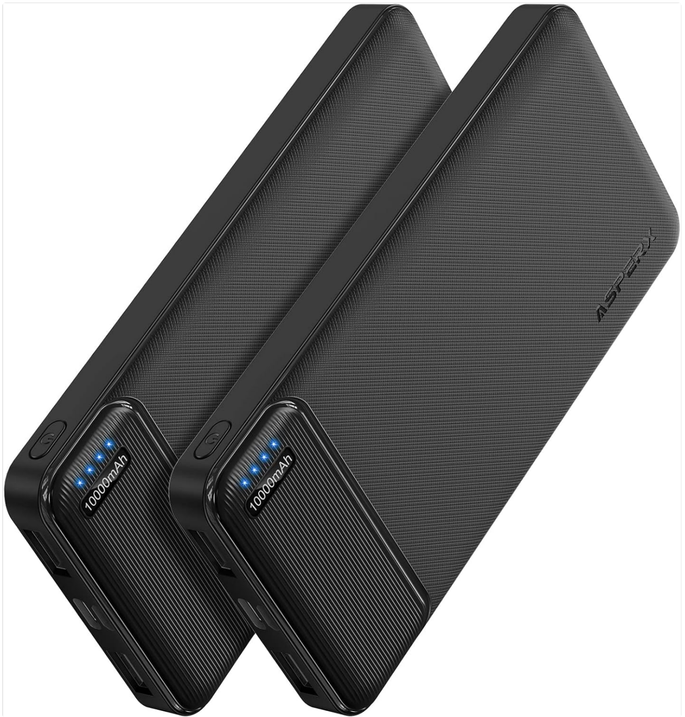
Image: Two AsperX 10000mAh portable power banks.