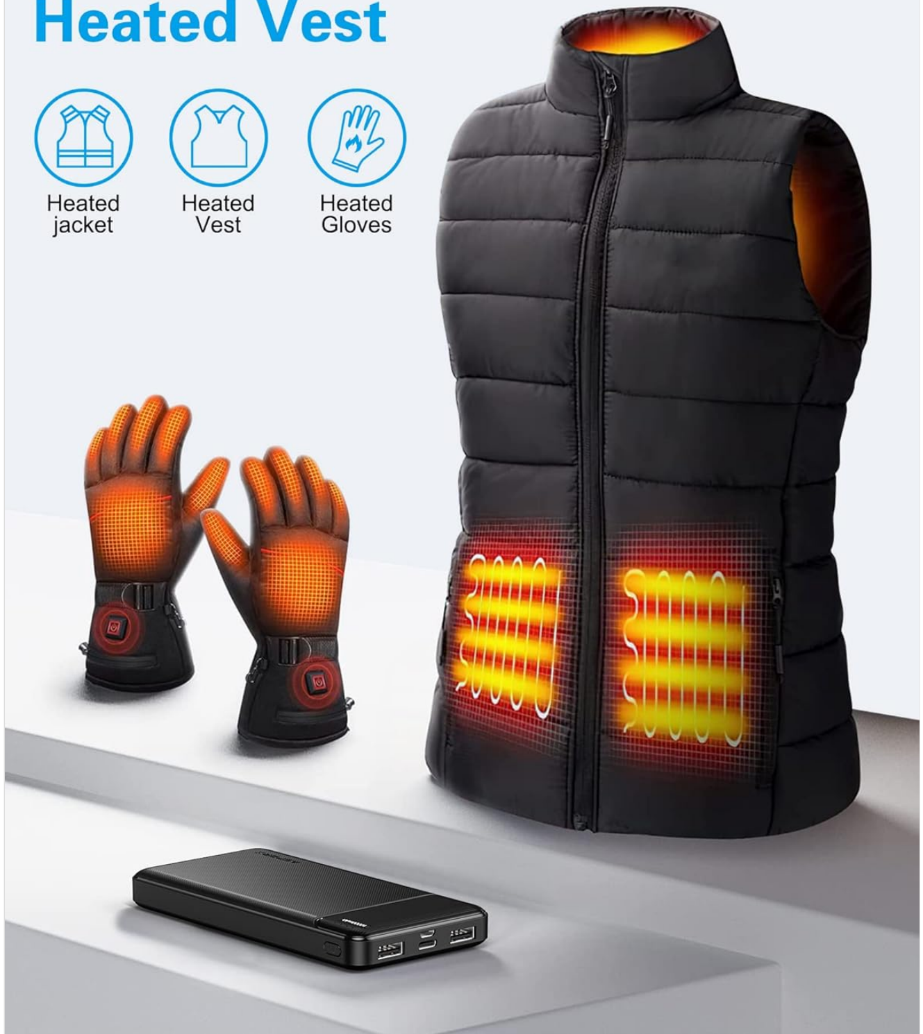
Image: Compatibility with heated vests and other accessories.