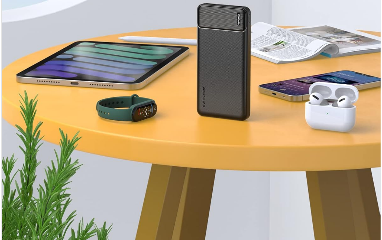
Image: Charging capacities for various devices.