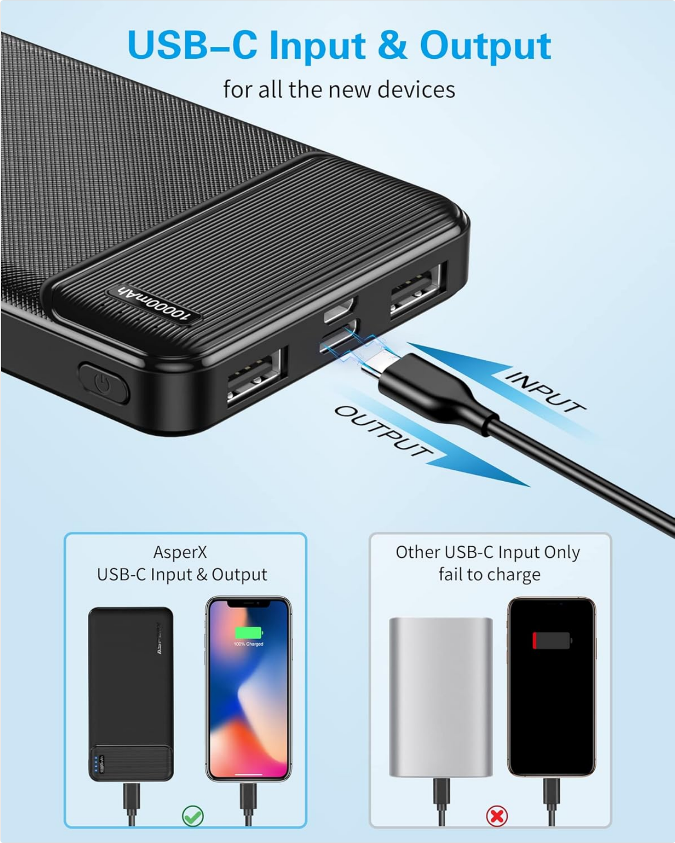
Image: USB-C port for both input and output.

The power bank is compatible with a wide range of devices, including mobile phones, tablets, AirPods, Bluetooth headsets, fitness trackers, and smartwatches. It can also be used to power heated vests and other compatible accessories.