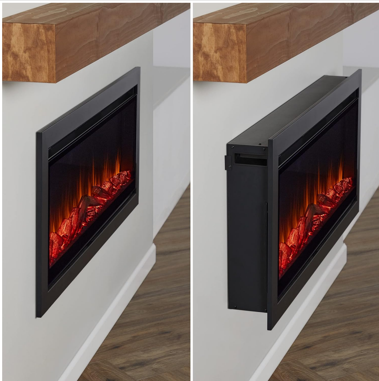
Figure 3: Installation Options. This image demonstrates both recessed (left) and wall-mounted (right) installation methods for the fireplace insert.